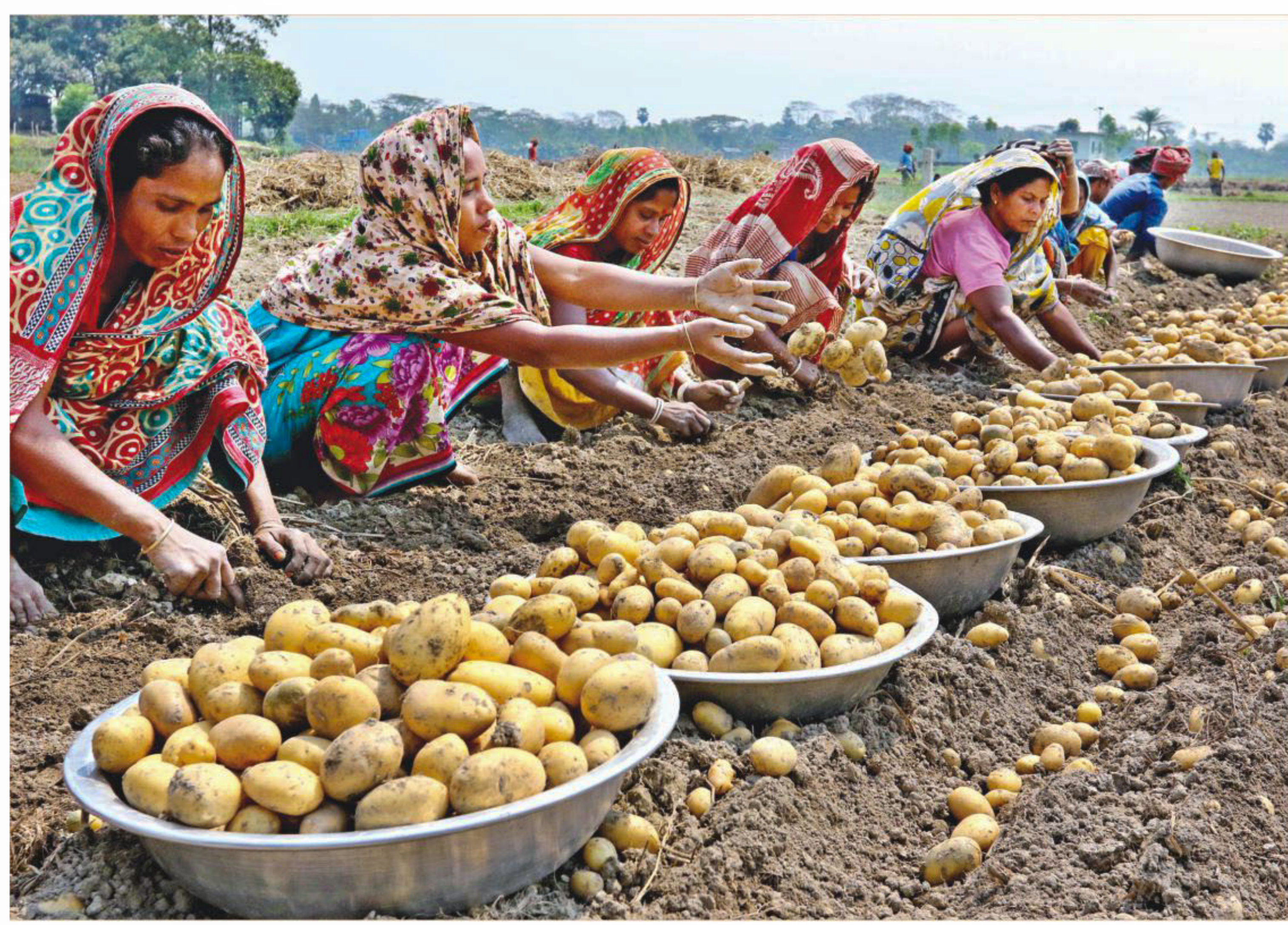
Farmers busy collecting potatoes, following what they said was a bumper harvest in Munshiganj's Sirajdikhan upazila. They credited favourable weather for the yield. The photo was taken yesterday.