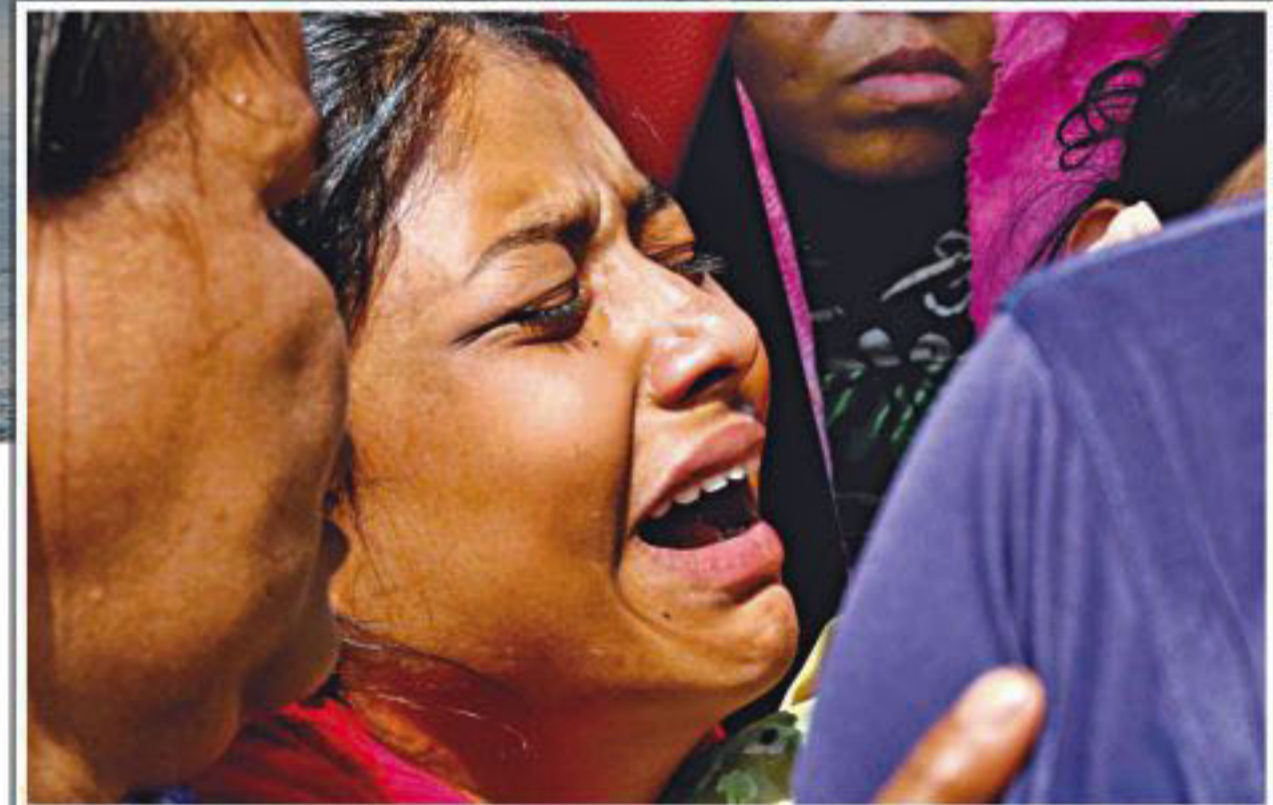
A boat carrying a passenger's body recovered from the Buriganga river in the capital's Sadarghat yesterday. Five of a family, including a five-month-old, died and another went missing when a boat sank after being hit by a launch. Inset, a family member breaks down in tears.