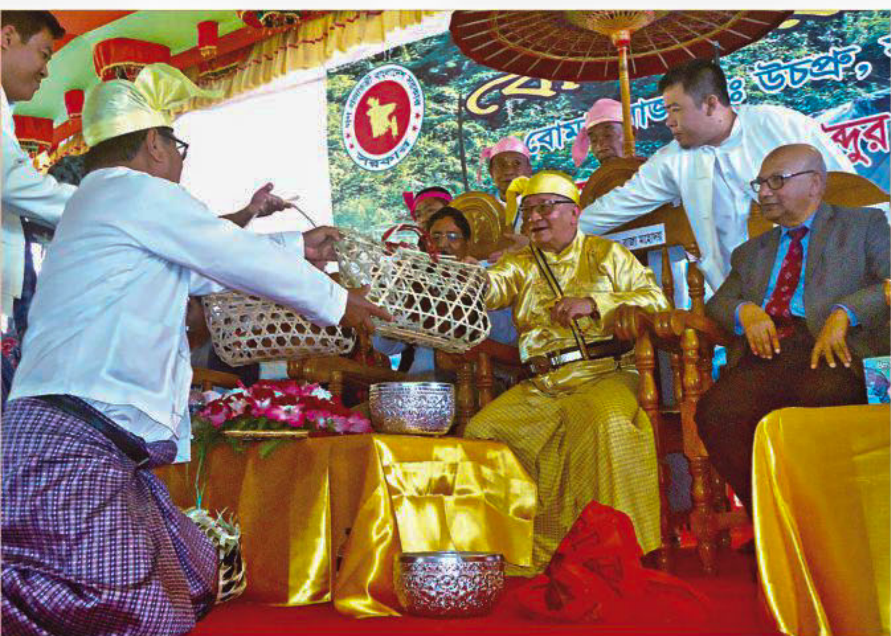
Indigenous village chiefs of Bohmong Circle in Bandarban offering gifts to their king U Chaw Prue as they celebrate Raj Punnah, an annual revenue-collection programme.