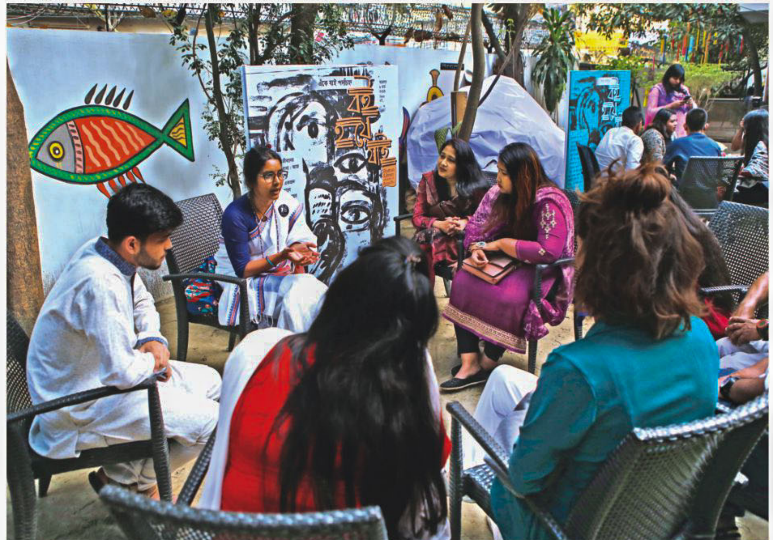
Readers engrossed by the story of a human book at the latest session of Human Library Bangladesh yesterday.

"We love the curiosity with which people listen to the stories, and are glad that we get to play a part in helping others form balanced perspectives on various issues that are often not talked about," she added.