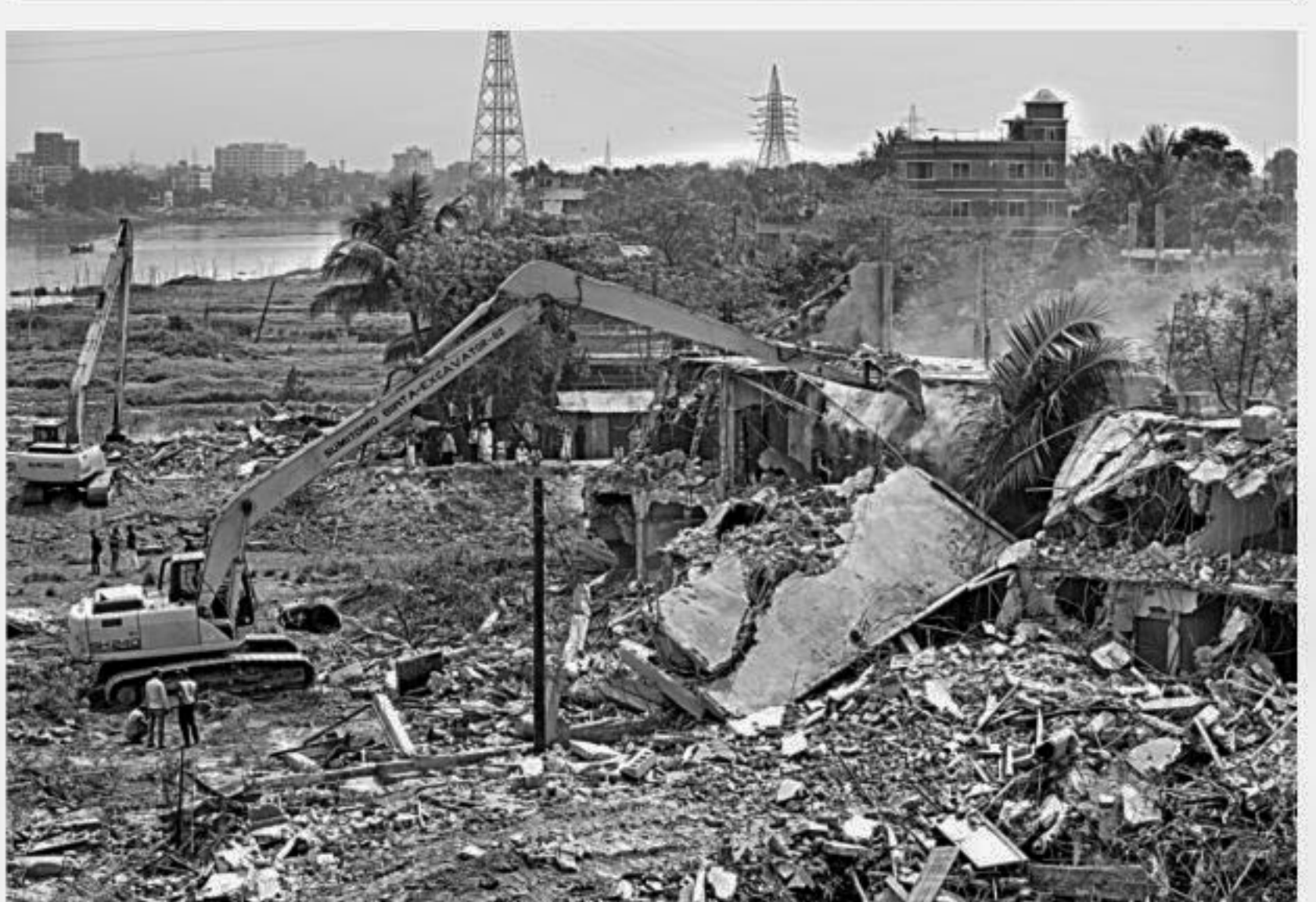
Excavators of Bangladesh Inland Water Transport Authority knock down illegal structures on the Buriganga in Washpur of Keraniganj yesterday. The authorities have been conducting an eviction drive along the river since January 29 to save it from encroachment.

current activity is deliberate and purposeful," said researchers at the Washington-based Center for Strategic and International Studies (CSIS). Researchers said that the activity at Sohae Satellite Launching Station in Tongchang-ri may be intended to "demonstrate resolve in the face of US rejection" of the North's request for an easing of sanctions in return for some dismantlement of nuclear weapons infrastructure. South Korean media said yesterday new activity has been detected at the North Korean intercontinental ballistic missiles plant at Sanumdong in Pyongyang.