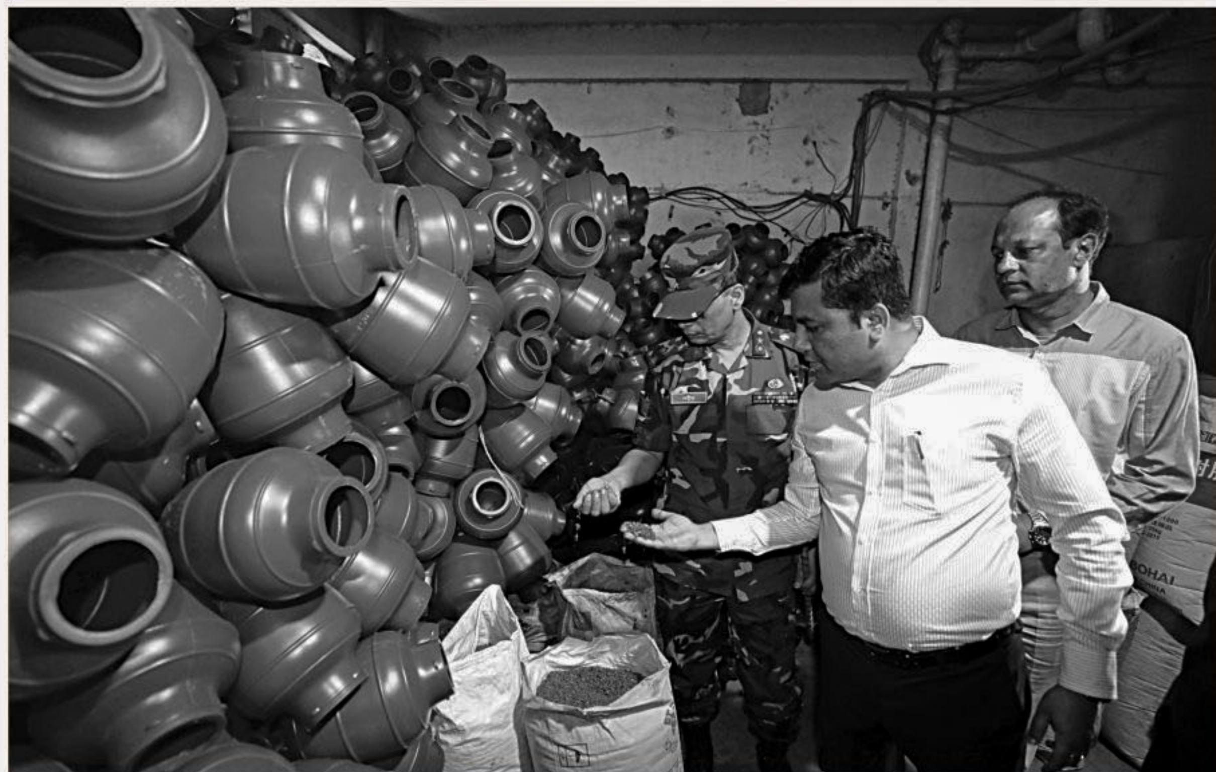
A team of Dhaka South City Corporation inspectors inspect a plastic factory in Old Dhaka's Bakshibazar area yesterday during a drive against illegal chemical warehouses and plastic factories in the old town.