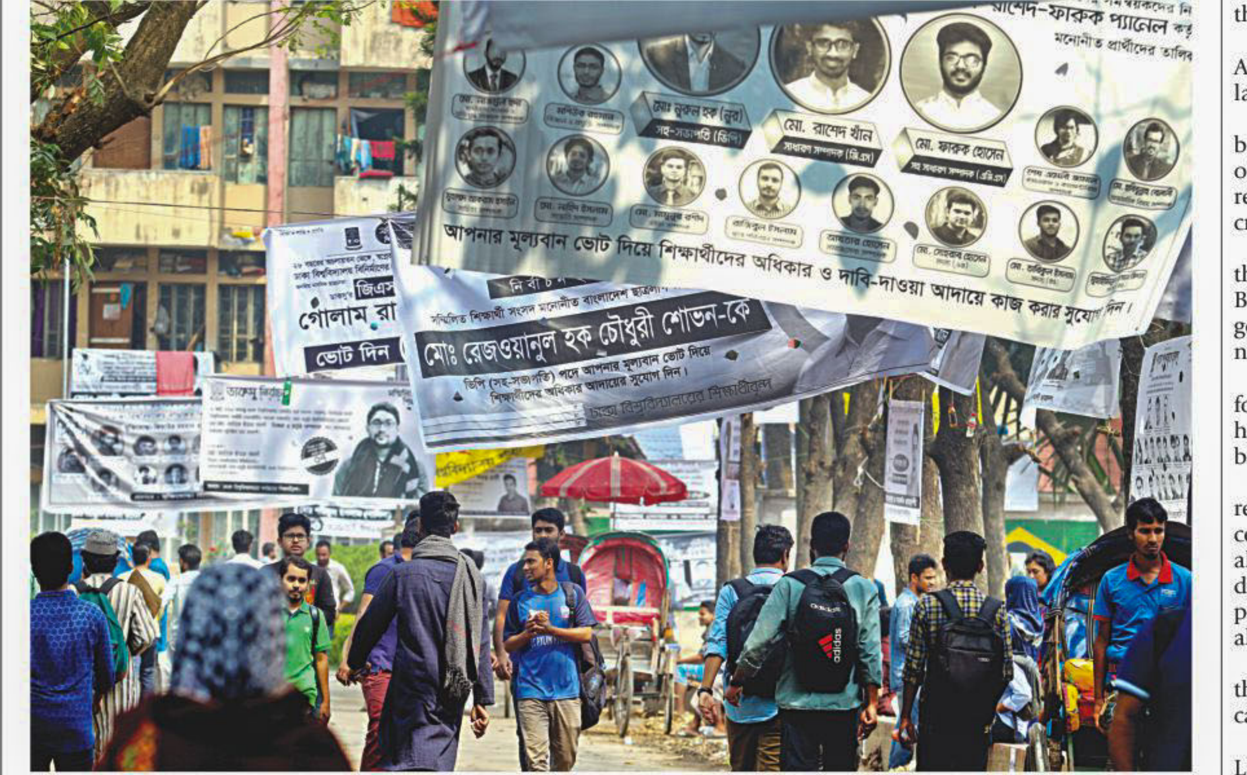
With Ducus election just days away, Dhaka University campus is abuzz with campaigners. The picture of posters and banners near Kabi Jasimuddin Hall was taken yesterday.