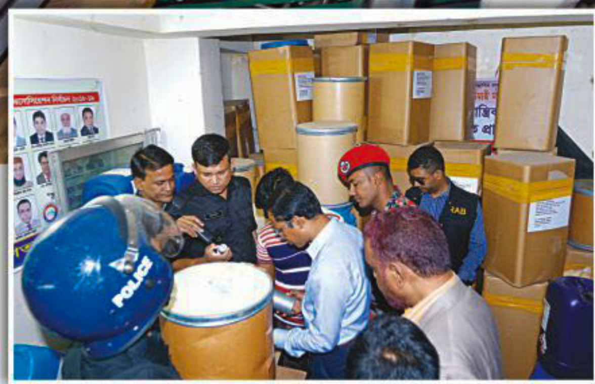
A team of Dhaka South City Corporation inspects a polythene bag factory in Bakshibazar during a drive against illegal chemical warehouses and factories in the old town yesterday. Inset, a mobile court of Rab inspects products at a chemical warehouse in Armanitola.