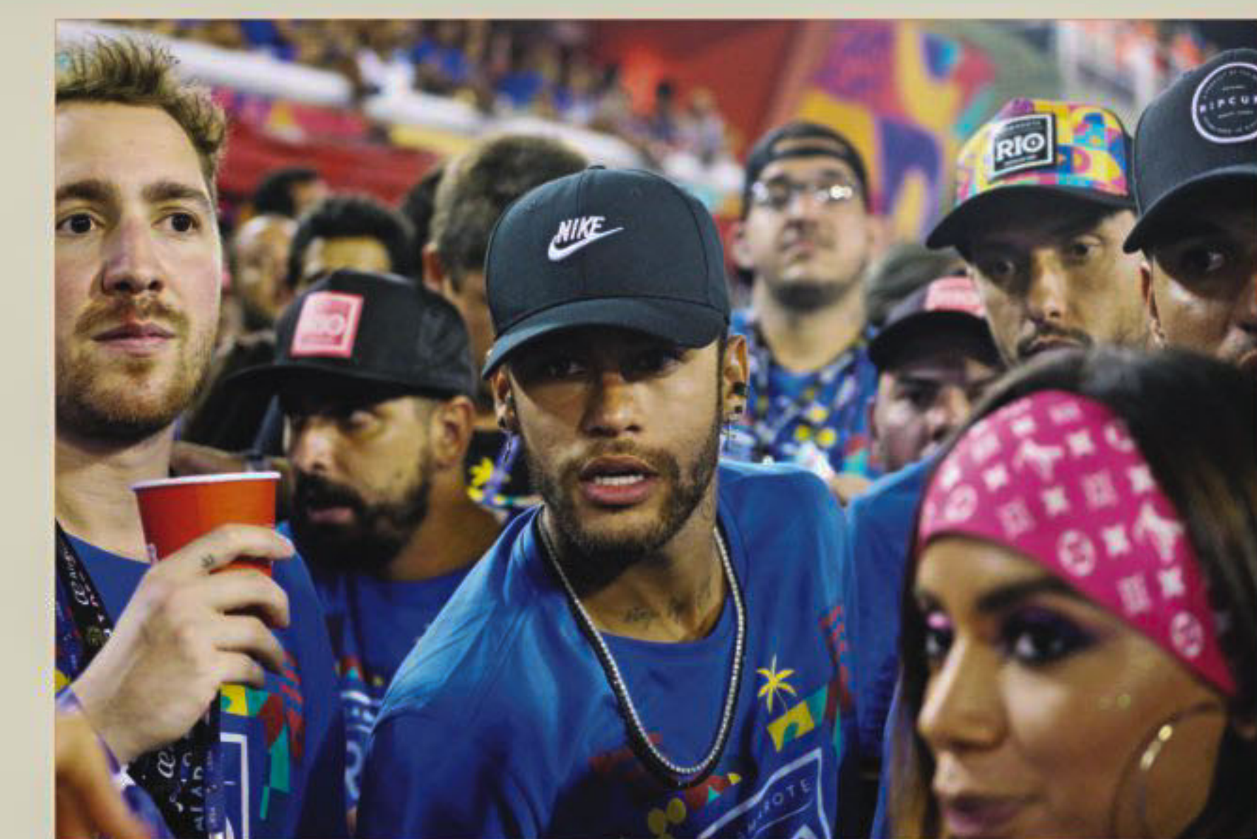
Brazil star Neymar attends the second night of the Rio de Janeiro Carnival parade at the Sambadrome yesterday.