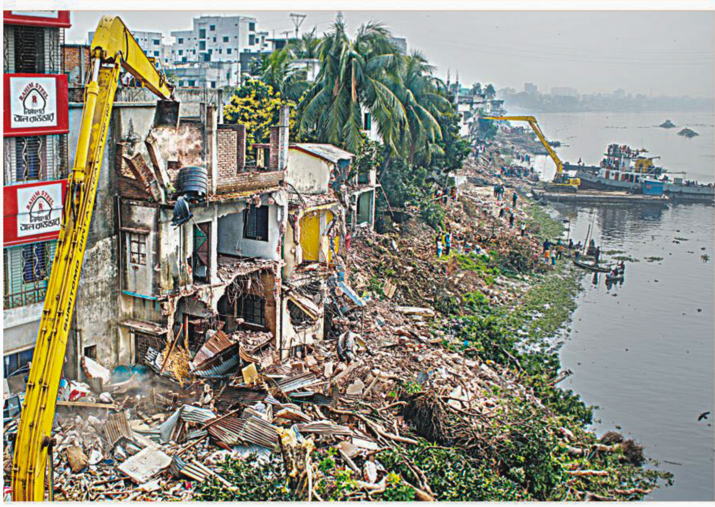
Bulldozers tear down illegal structures on the Buriganga during an eviction drive by the BIWTA near the Basila Bridge in the city's Mohammadpur yesterday. The authorities have been conducting the drive to save the river from encroachment. Story on page 2