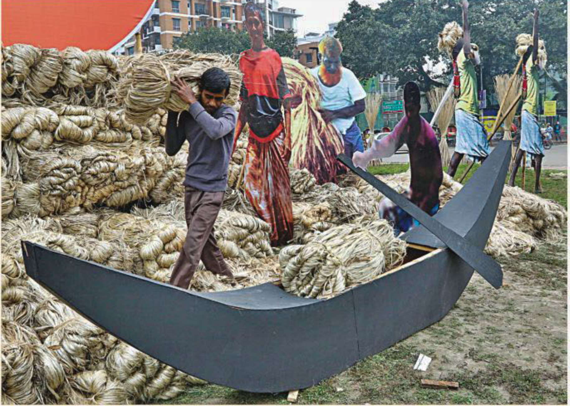
A worker is busy decorating a road island with raw jute and cutouts of farmers in the city's Khamarbari area yesterday ahead of the National Jute Day today.