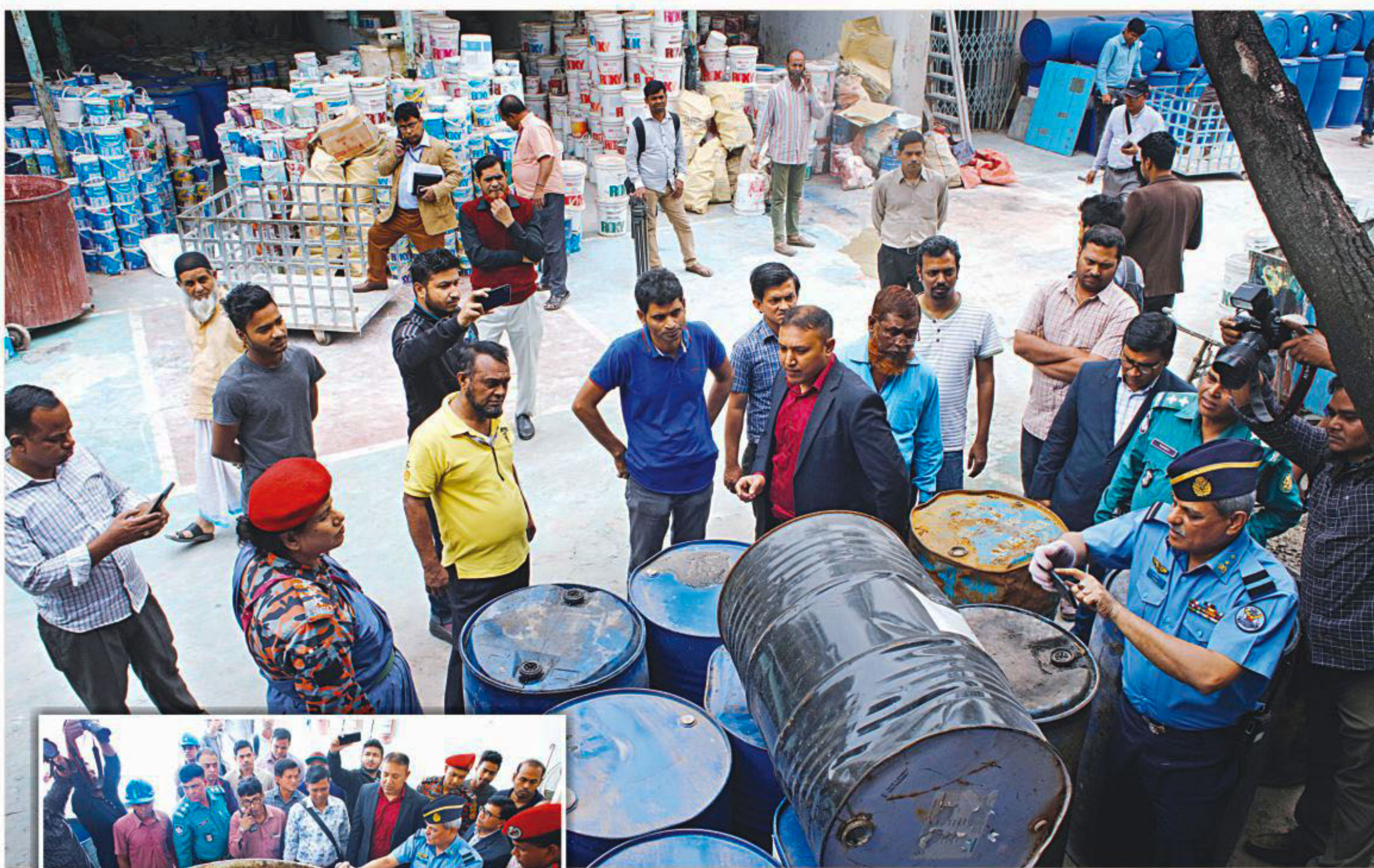
Members of the government taskforce conducting a drive against chemical warehouses in Old Dhaka inspect containers in front of a dye storage in Hazaribagh yesterday. Later in the day, the taskforce disconnected all utility connections to the storage.