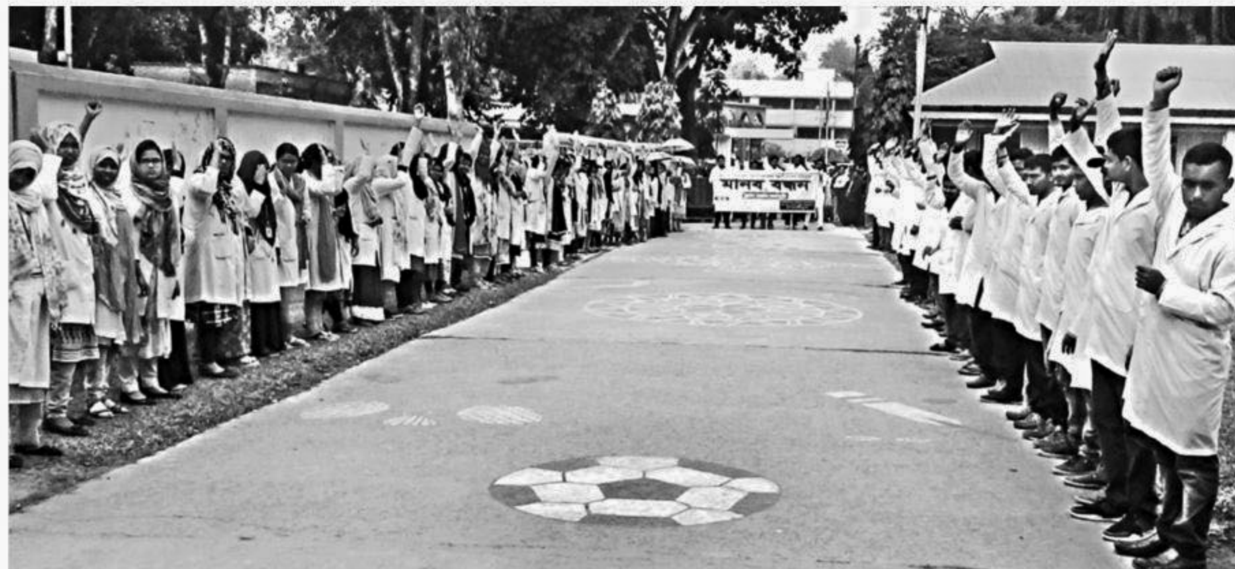
Students of Sheikh Hasina Medical College in Jamalpur form a human chain on the college campus, boycotting their classes for the third consecutive day yesterday, demanding arrest and punishment of two local youths who assaulted two students of the college on Thursday.

Demanding safety for all SHMC students, especially for female students who often fall prey to stalking by local youths, the students attending the human chain also vowed to continue their boycott until the attackers of their fellow students are brought to book.