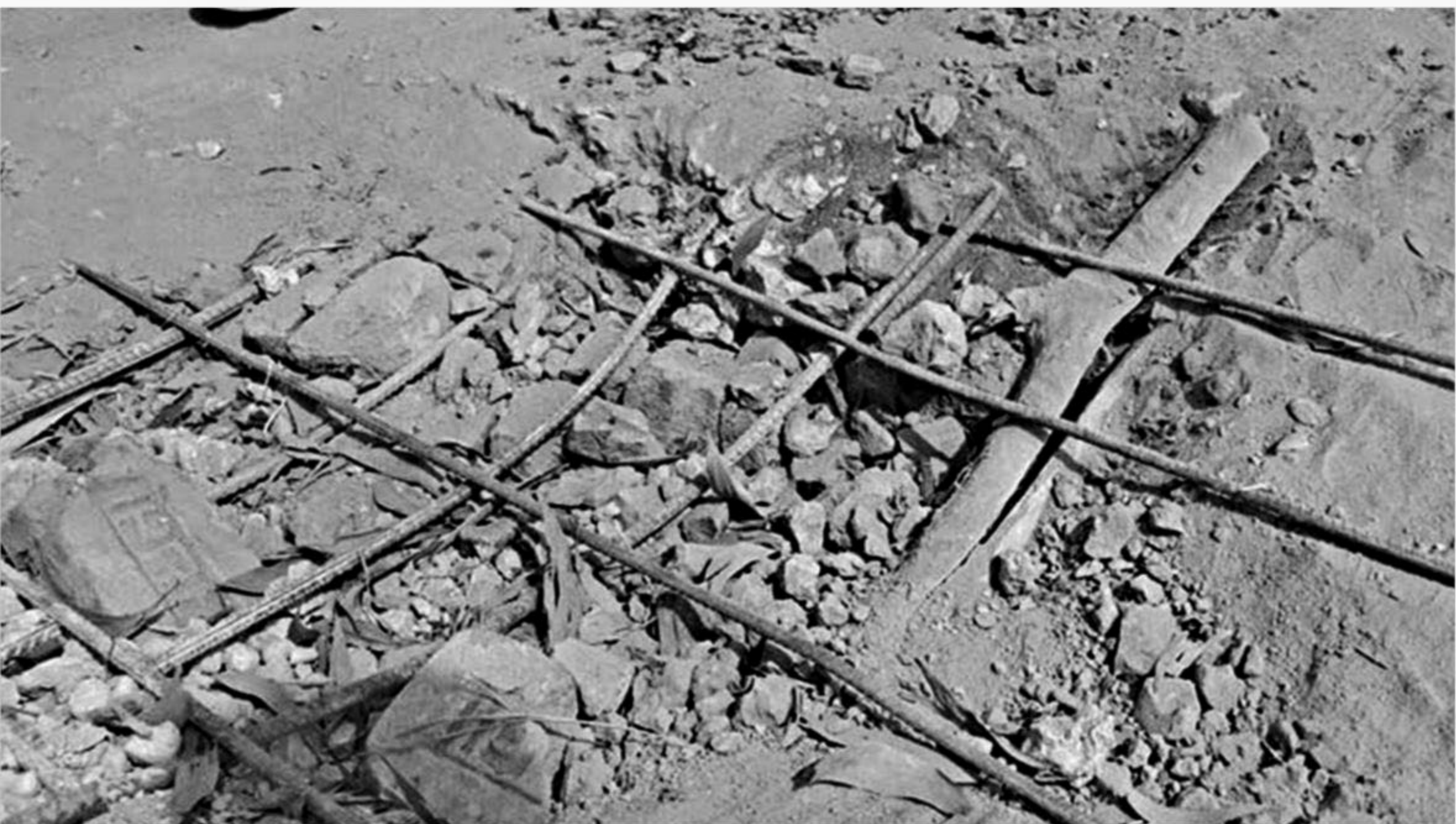
A degenerating section of Madhabpur-Padmachara link road where a tree branch was used in place of iron rod. The brick chips used in the road was also found to be of inferior quality.