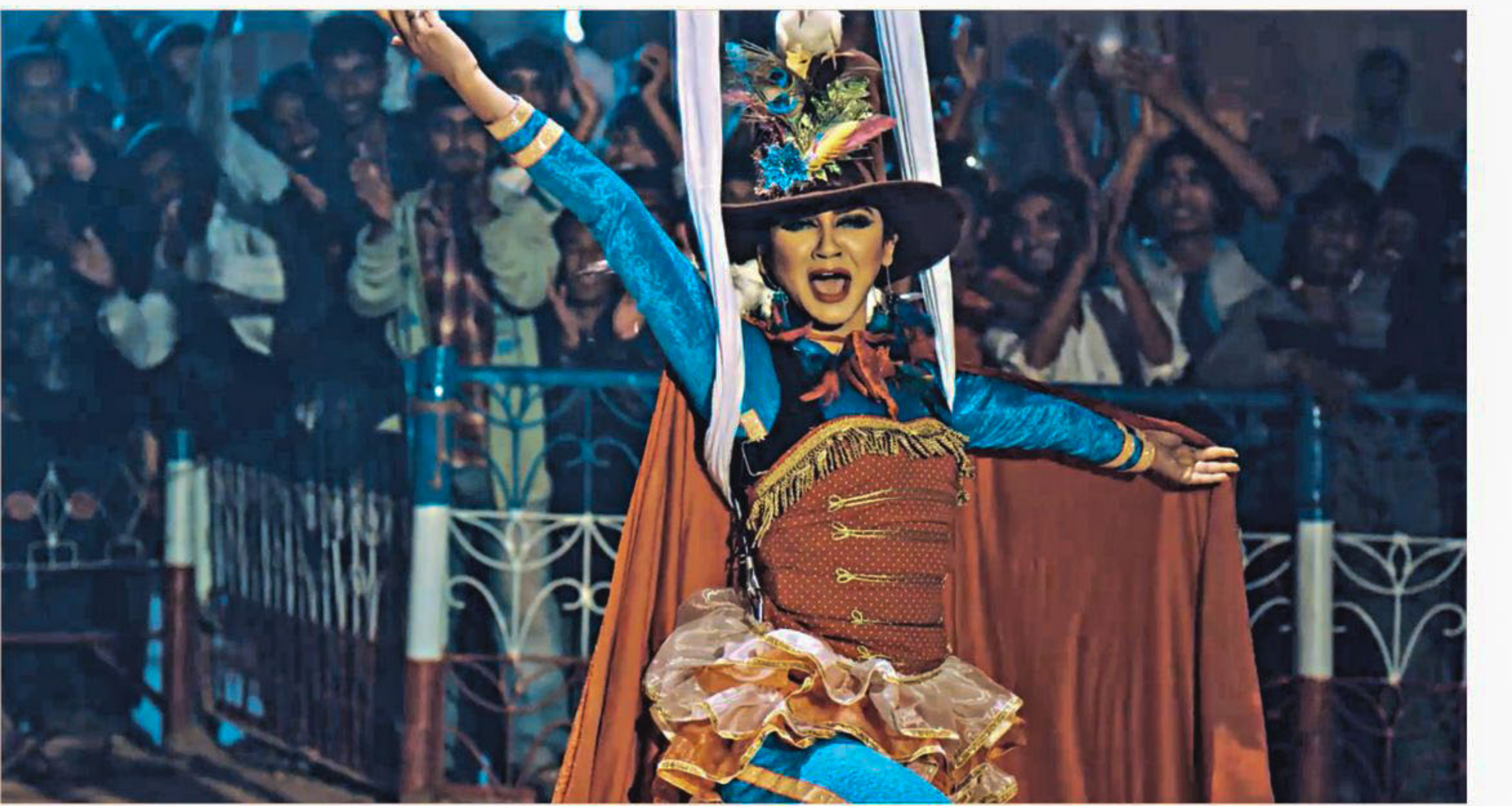
A snippet of the teaser released for the film.