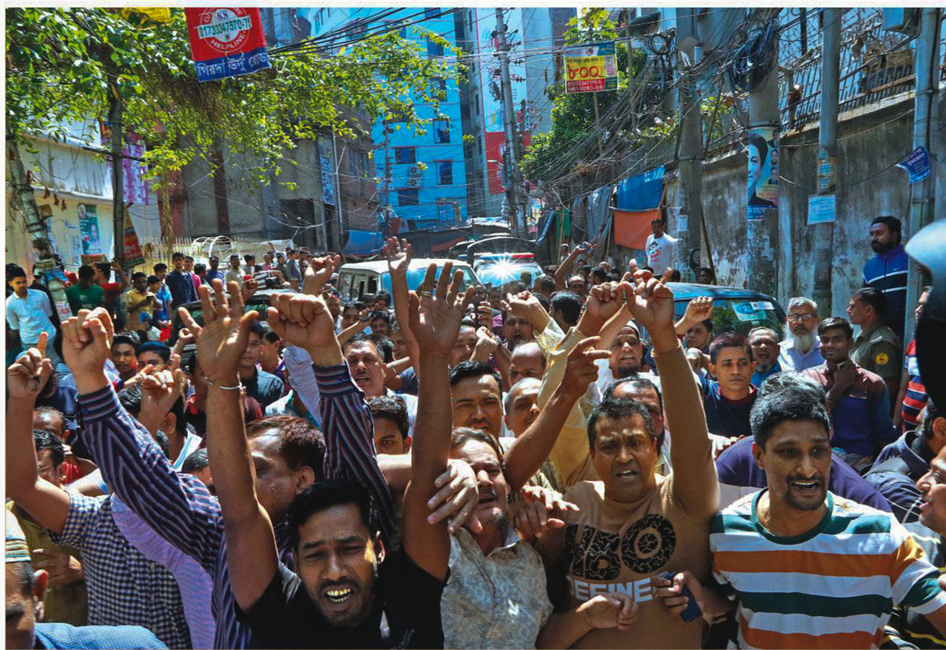
Locals protesting a drive against chemical warehouses and factories in Bakshibazar area of Old Dhaka yesterday, the second day of a month-long crack-down by a taskforce of 14 government agencies. Right , electricity connection of an unauthorised warehouse being snapped; officials cornered by locals at one stage around noon; and Dhaka South City Corporation Mayor Sayeed Khokon joins the drive in the afternoon.