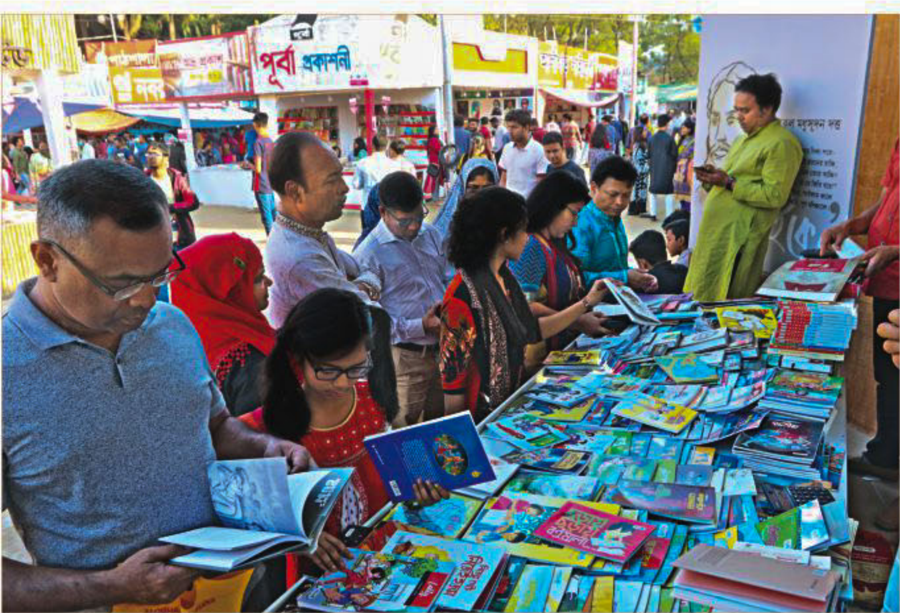
People browsing through children's books at a stall on the last day of the month-long Ekushey Boi Mela at Suhrawardi Udyan yesterday.