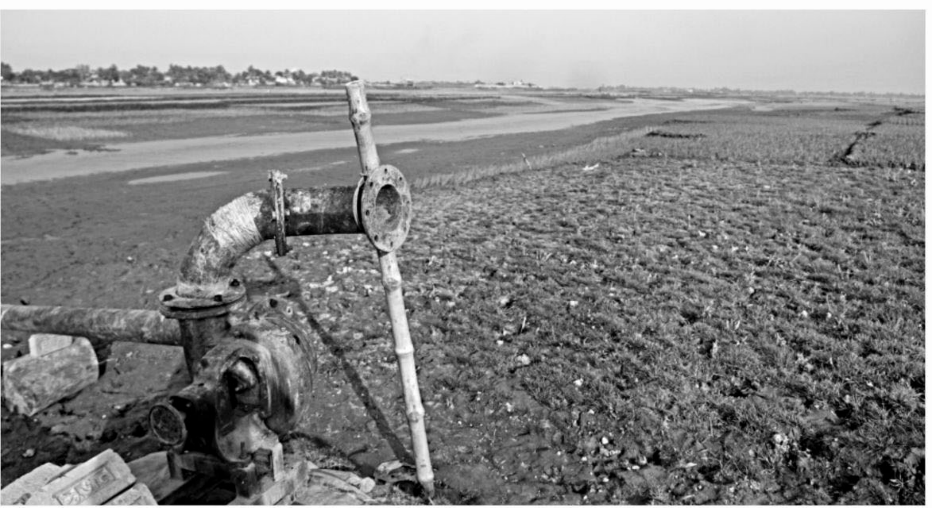
One of the irrigation pumps, set up along the nearly dried up Chikondiya river in Goalnagar area in Brahmanbaria's Nasirnagar upazila, has remained inoperative due to inadequate flow of water in the river this season.