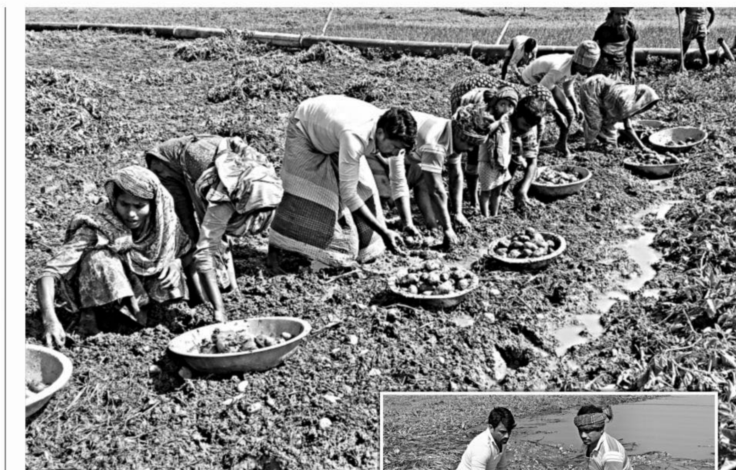
Farmers hurriedly pick potatoes in a bid to save whatever they can at a field of Baluchar area in Sirajdikhan upazila of Munshiganj yesterday as unexpected spring rain during the last couple of days caused damage to the crop in different areas of the famous potato producing district.