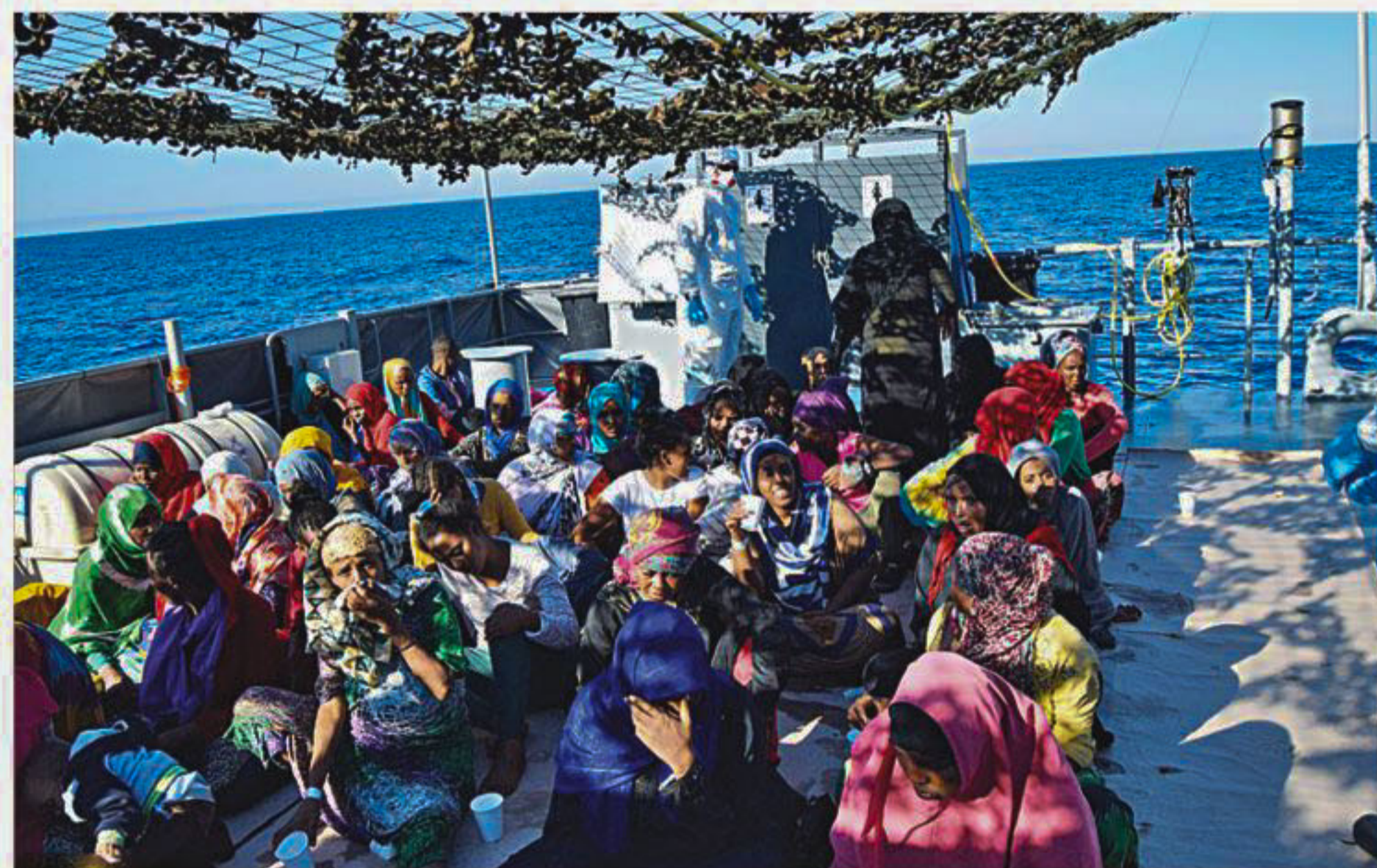
Migrants travelling on the Libya-Italy route—the most dangerous way to cross the Mediterranean.

Recently, a little refugee boy from Mali also drowned in the Mediterranean. In preparation for the ill-fated trip, he had stitched a school report to his clothes to show European authorities what a good student he was.