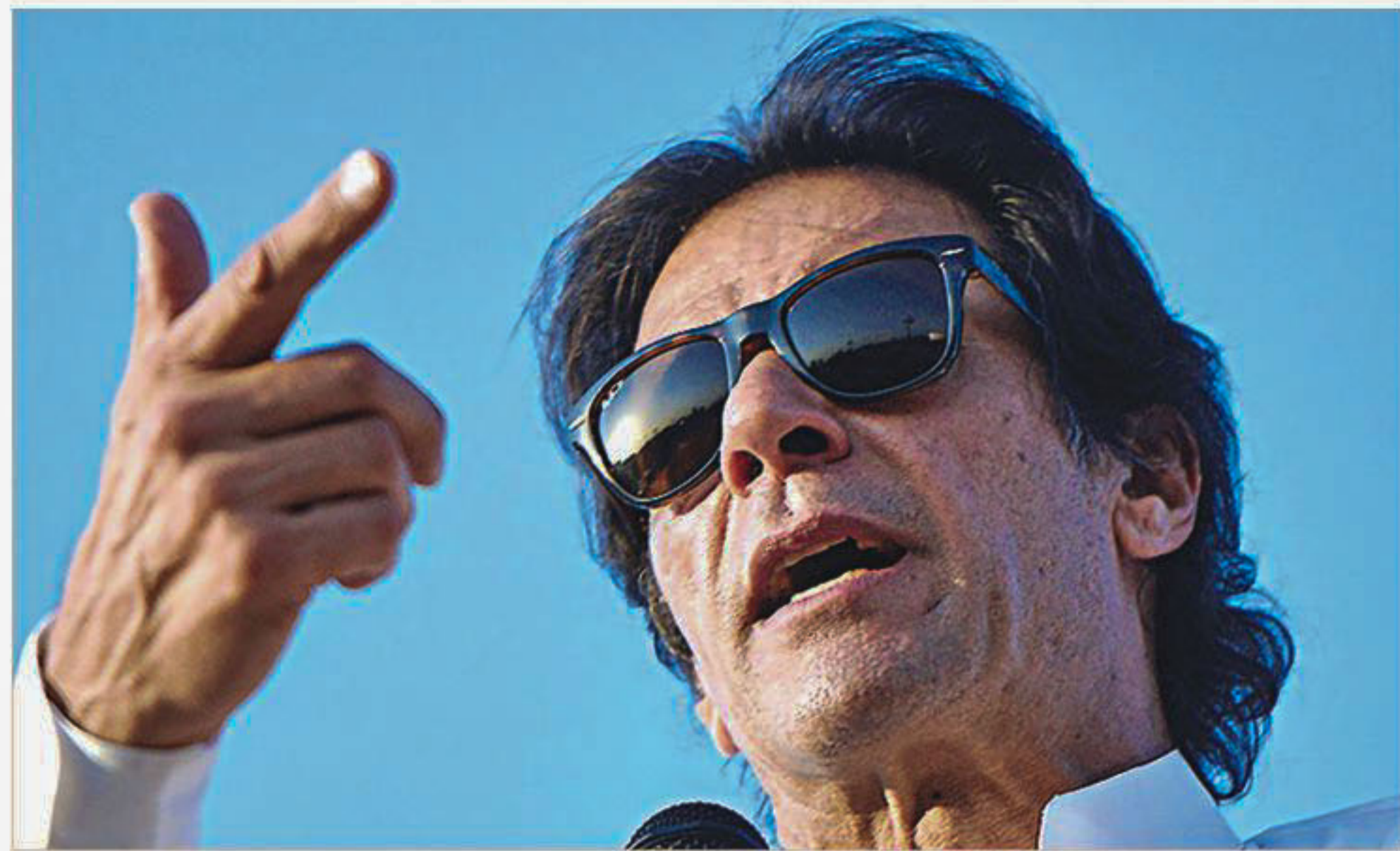
"Pakistan will release captured Indian Air Force pilot Abhinandan Varthaman on Friday as a 'peace gesture'," Prime Minister Imran Khan said on Thursday.

When she returned to power in 1980, she was a chastened politician. She fought the