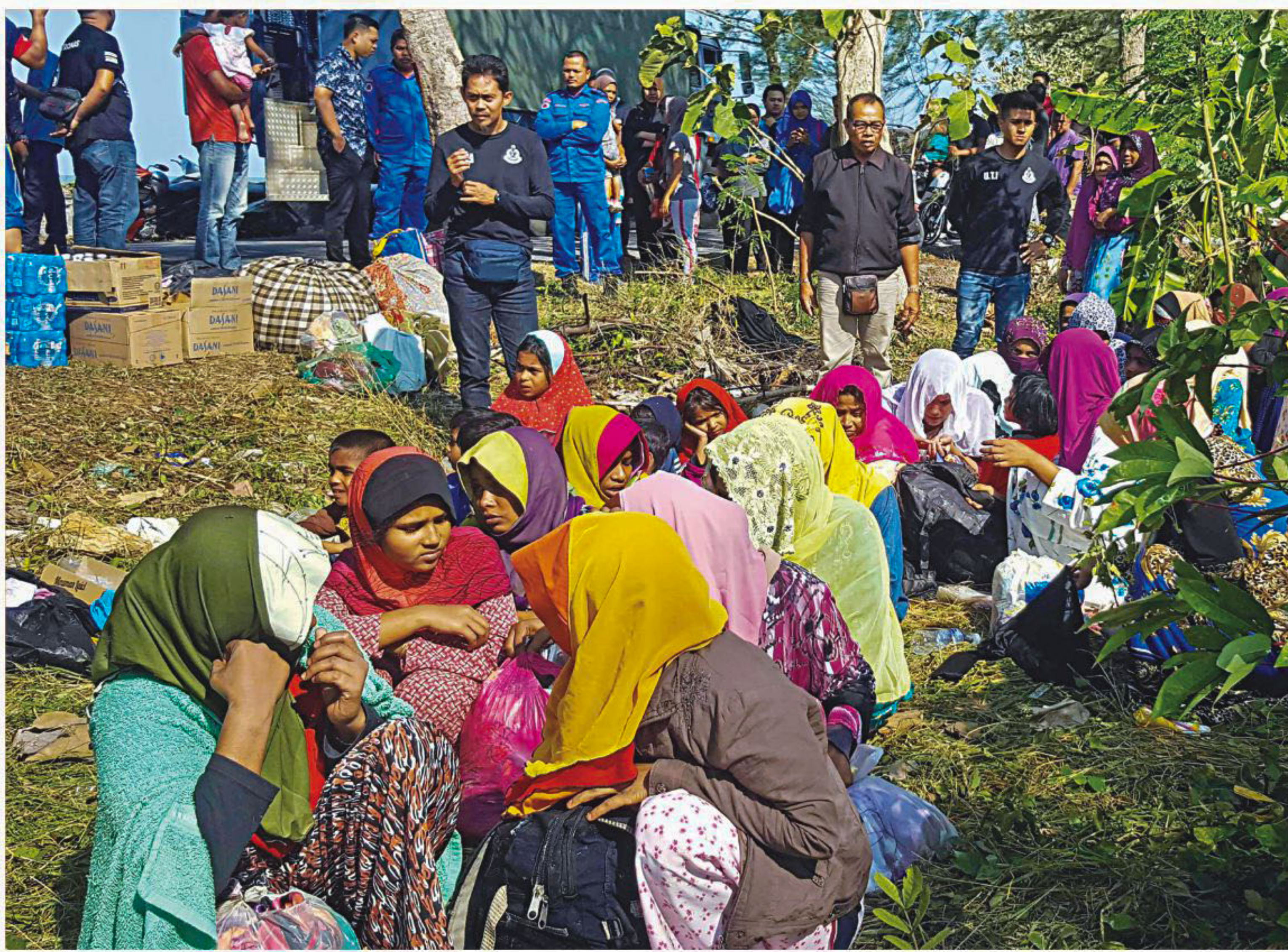
Rohingya refugees, who landed on an isolated northern shore near the Malaysia-Thai border, huddle in a group in Kangar yesterday, following their detention by Malaysian immigration authorities. Thirty-four Rohingyas landed on an isolated beach in Malaysia yesterday, police said.