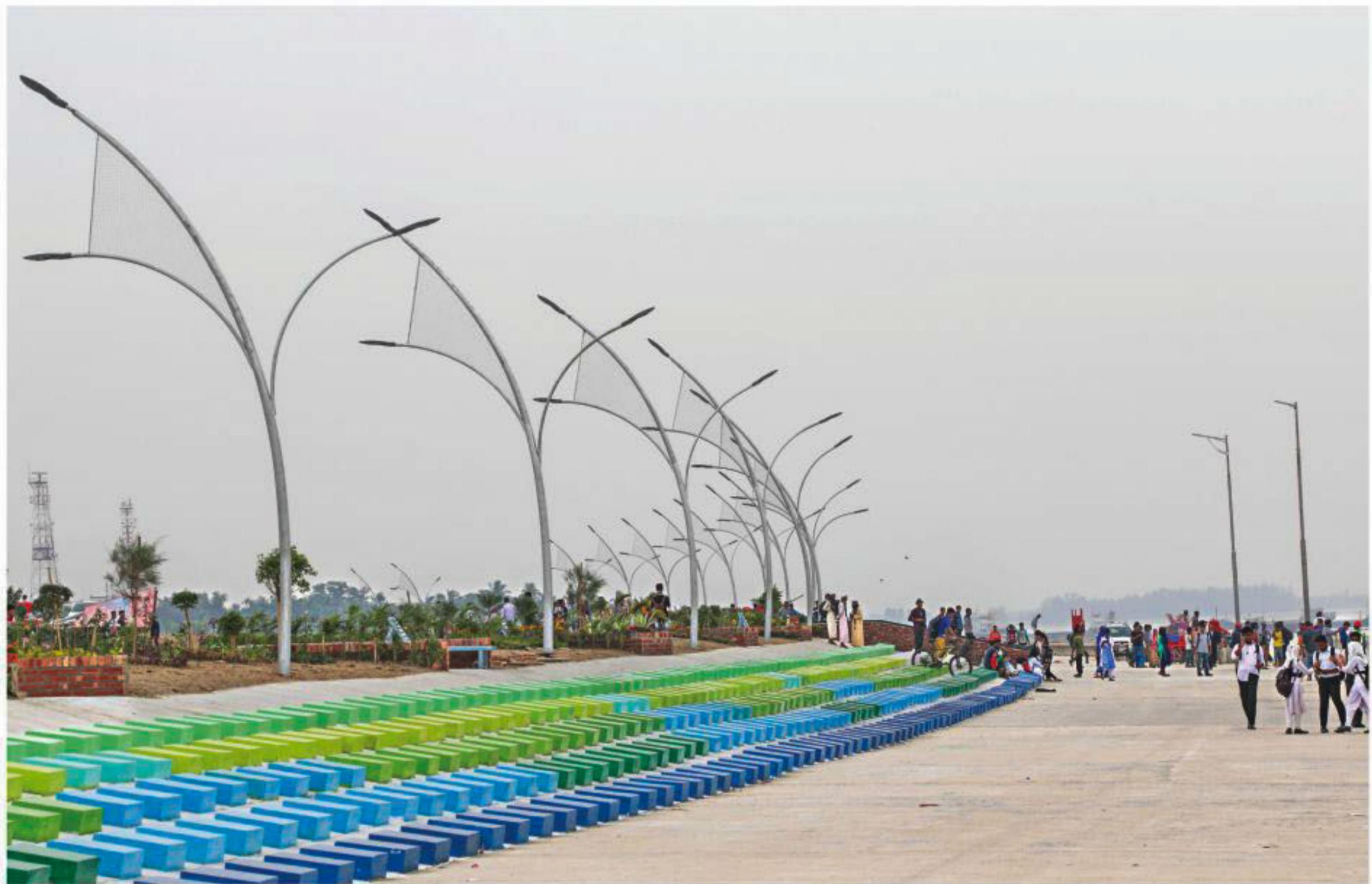
Authorities have taken the initiative to brighten up one of Chattogram's most popular tourist spots, Patenga sea beach. This photo was taken on Thursday.