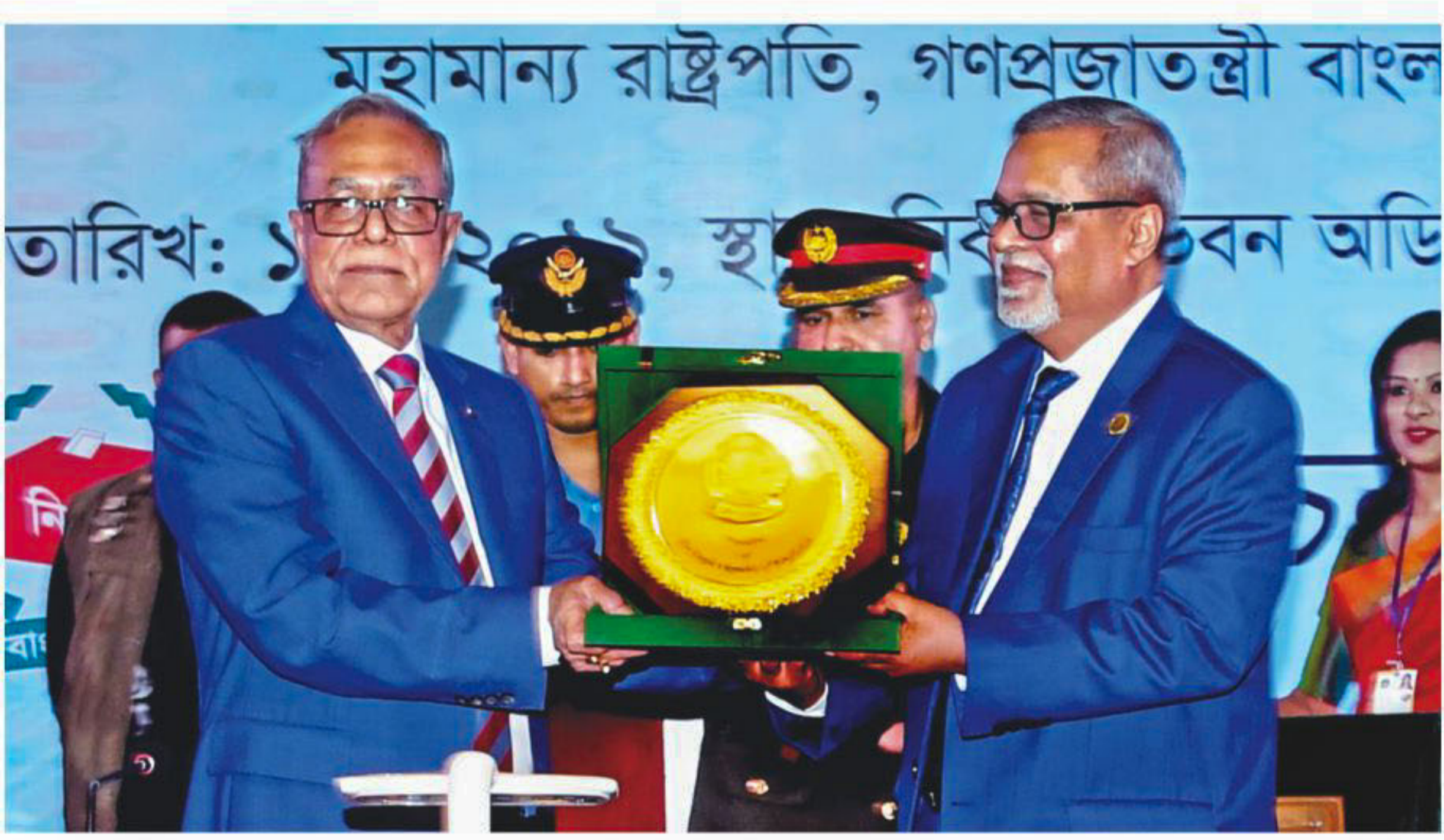
President Abdul Hamid hands over a crest to Chief Election Commissioner KM Nurul Huda in a programme observing National Voters' Day yesterday.