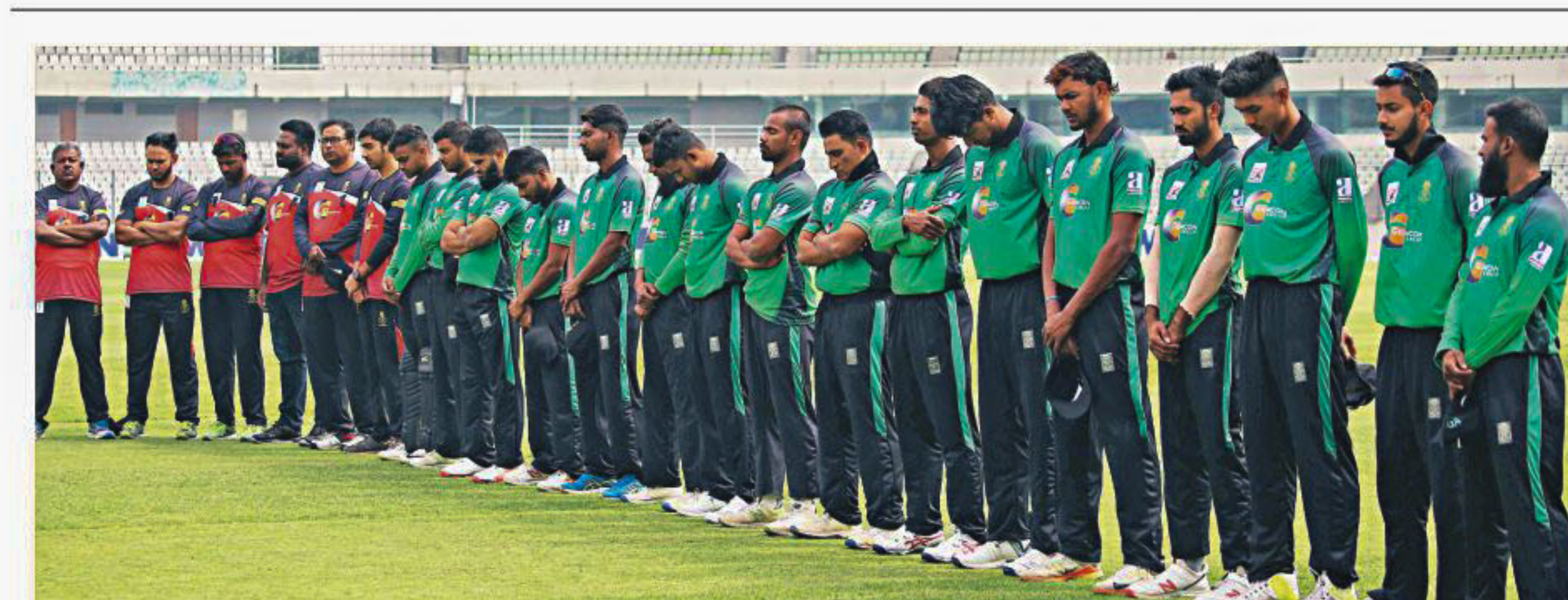
Ahead of the scheduled start of the Dhaka Premier League T20 fixtures at the Sher-e-Bangla National Stadium yesterday, four teams present at the venue observed a moment of silence in solidarity with victims of the Chawkbazar fire which claimed the lives of at least 67 people.