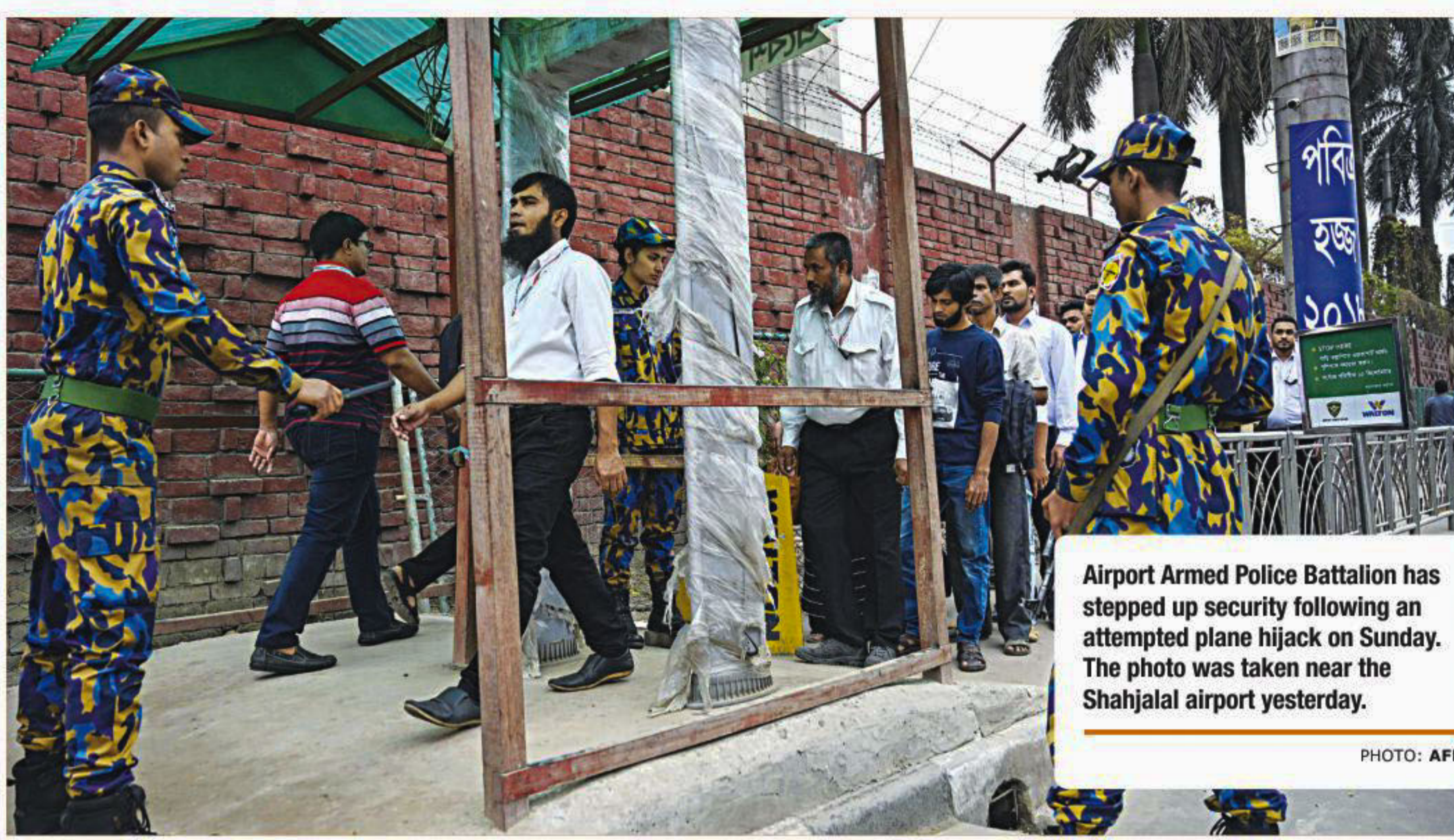
Airport Armed Police Battalion has stepped up security following an attempted plane hijack on Sunday. The photo was taken near the Shahjalal airport yesterday.