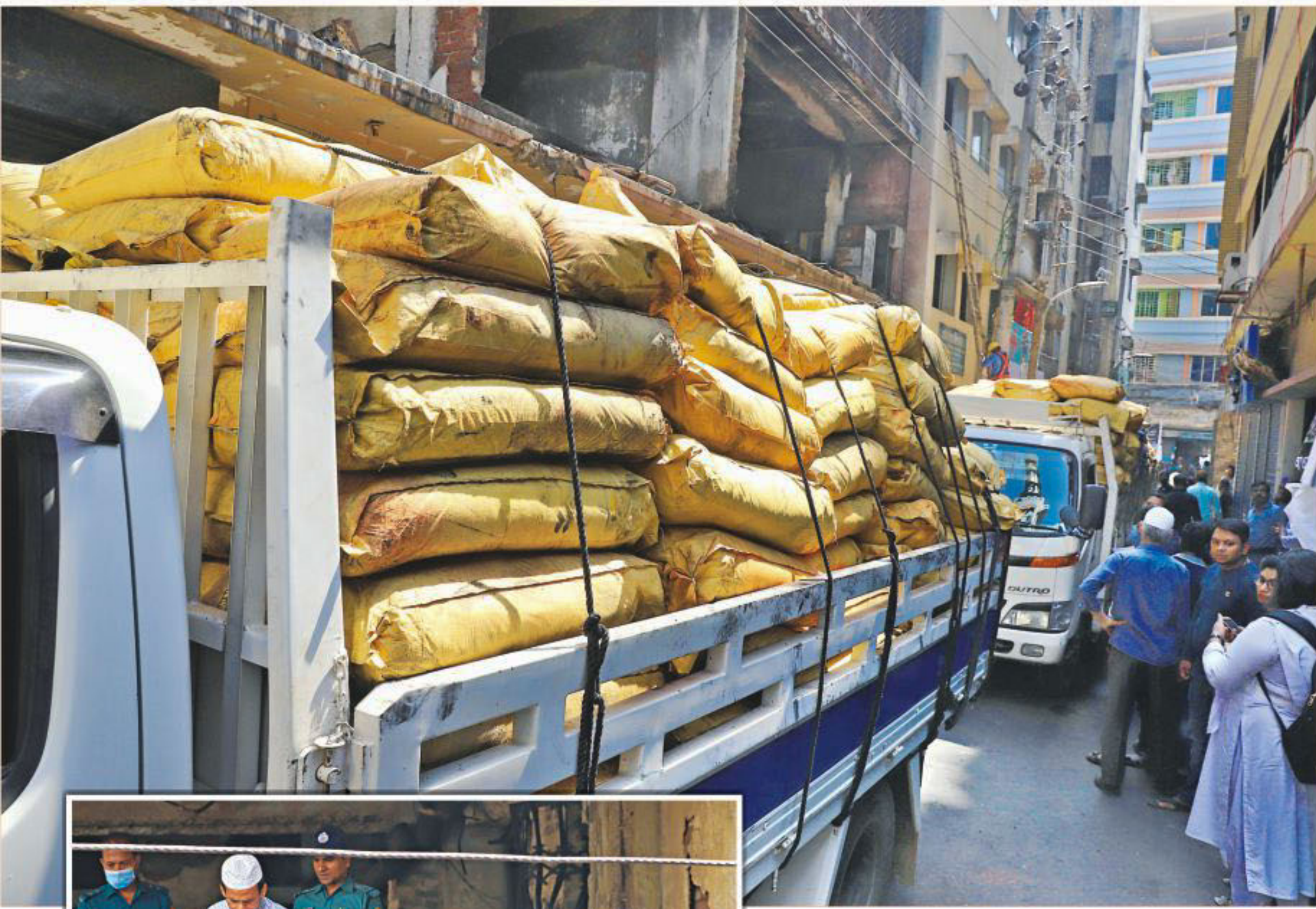
Sacks of what appears to be chemicals being removed from the basement of Haji Wahed Mansion by Dhaka South City Corporation yesterday noon. Inset, police collect evidence from the first floor of the building.