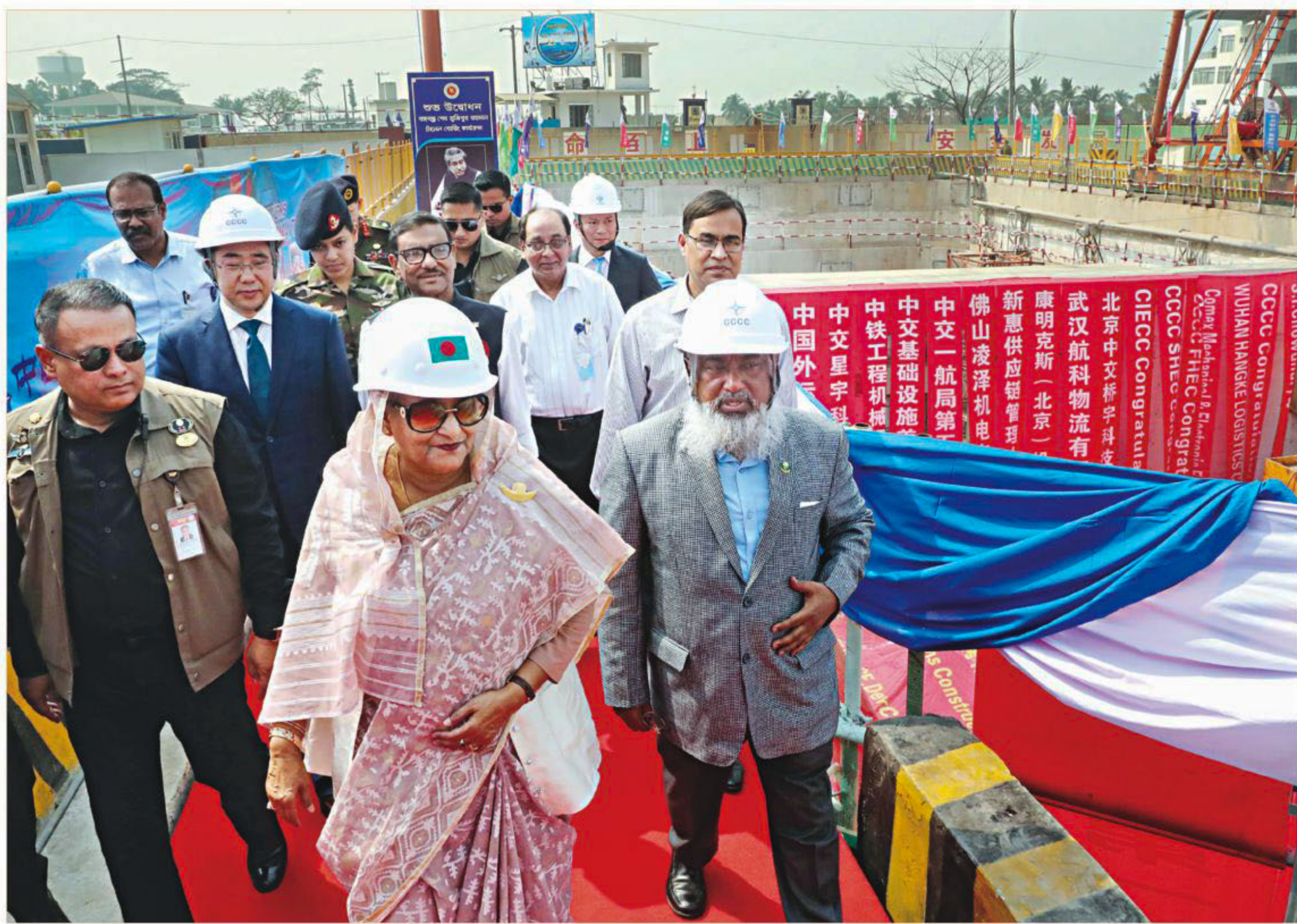
Prime Minister Sheikh Hasina taking a walk after launching the boring of Bangabandhu Sheikh Mujibur Rahman Tunnel across the Karnaphuli river in Chattogram yesterday. The country's first tunnel will improve communication in the port city and attract investment.