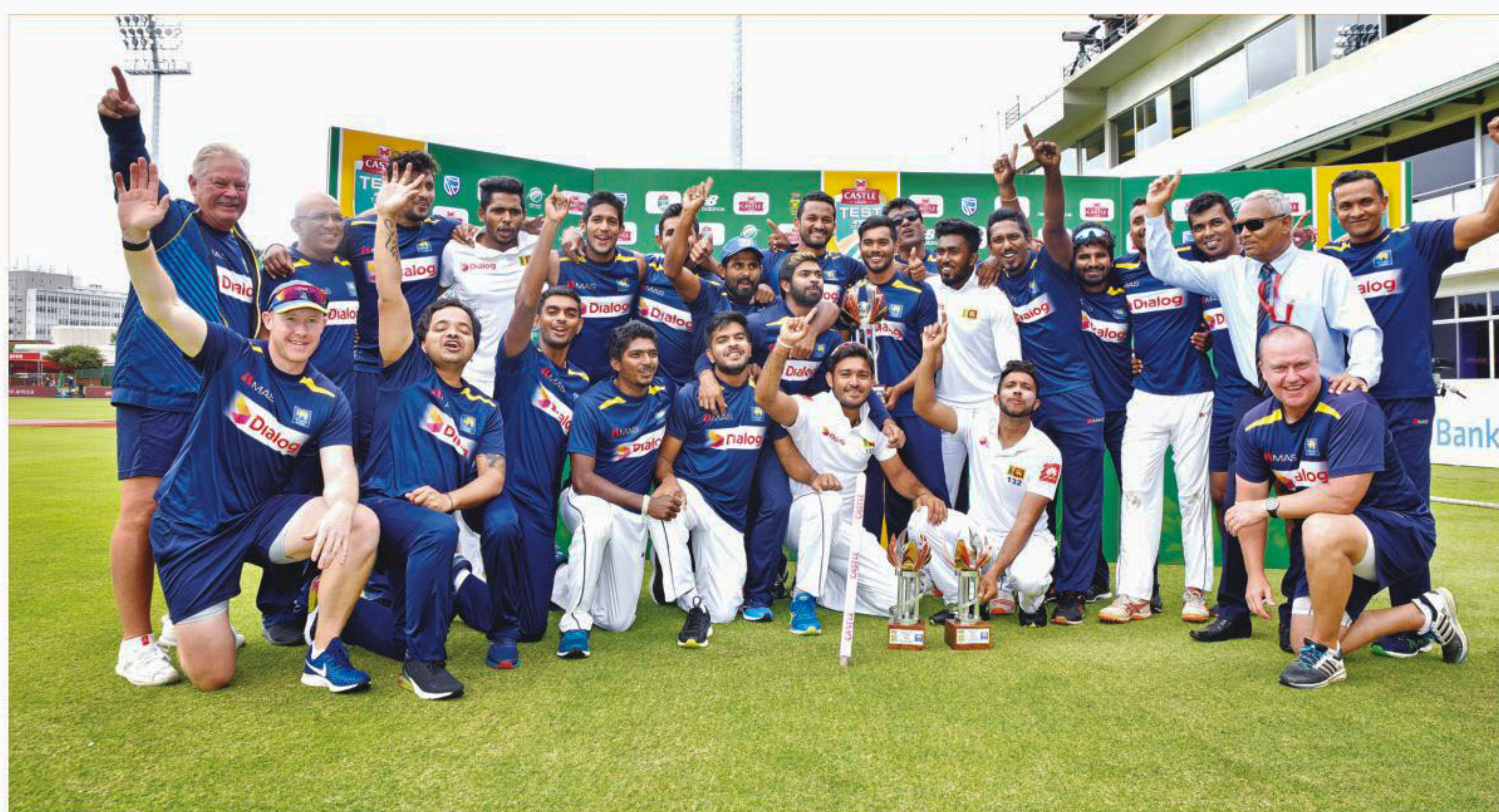
The Sri Lanka team pose with the Test series trophy after winning the second Test against South Africa by eight wickets in Port Elizabeth yesterday. With this, the visitors completed a clean sweep of the two-match series and became the first Asian side to win a series in the longest format of the game in South Africa.

However, now that the batsmen have had their turn, it will be important for the visiting bowlers to gain in confidence as well on the second day before facing the real test against New Zealand.