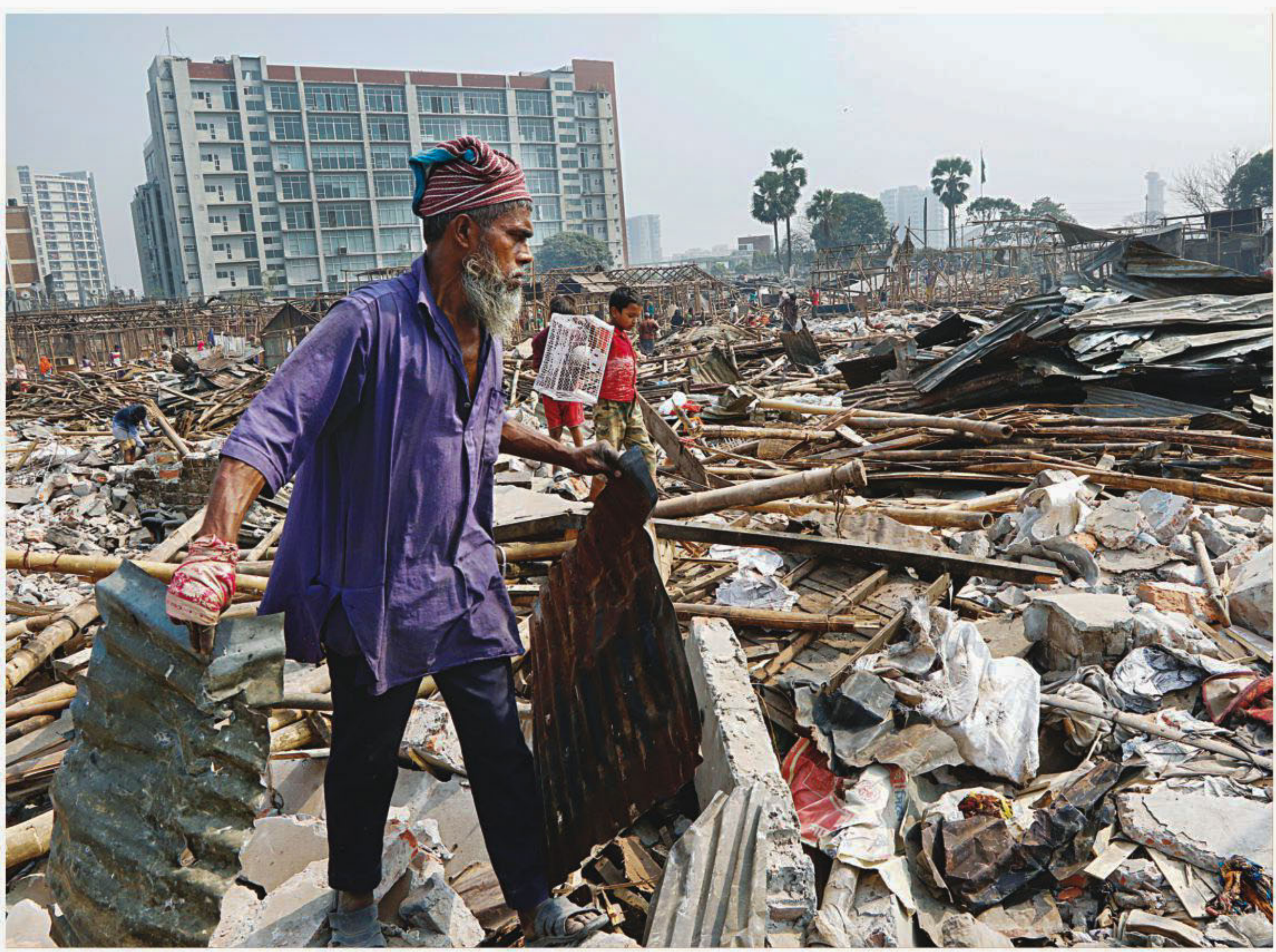
A man collects remnants of shanties in the city's Bhasantek area yesterday, three days after the National Housing Authority in an eviction drive knocked down dwellings at Bhasantek slum.