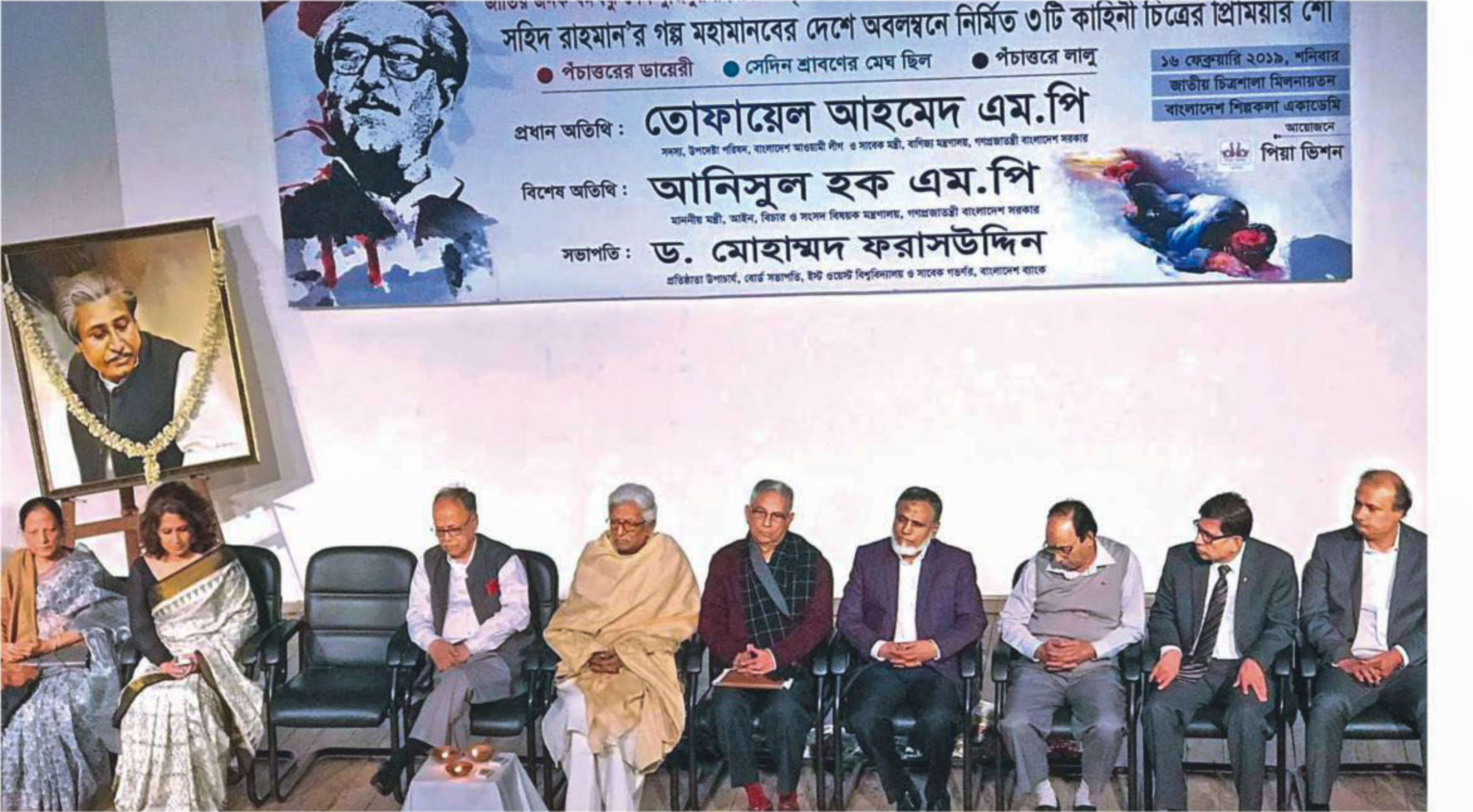
The guest speakers at the event.