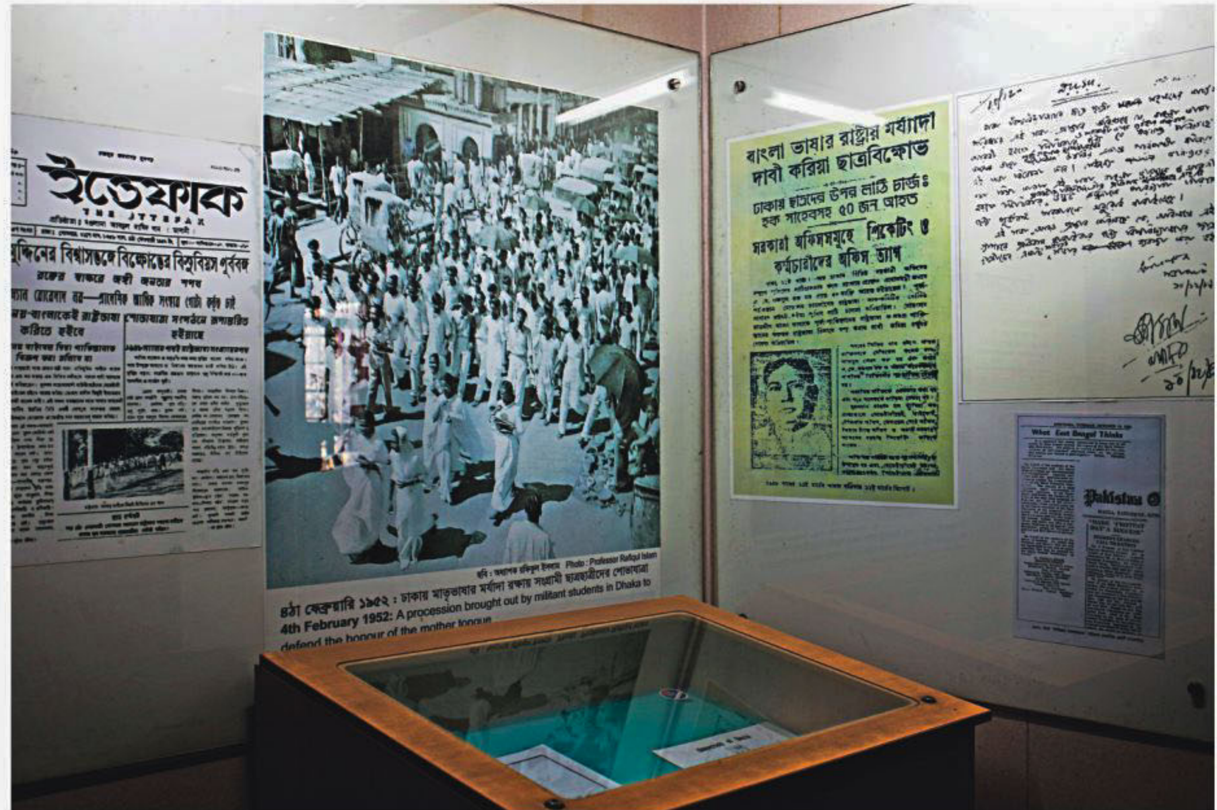
A gallery of the museum exhibiting newspaper pages covering the historic language movement.