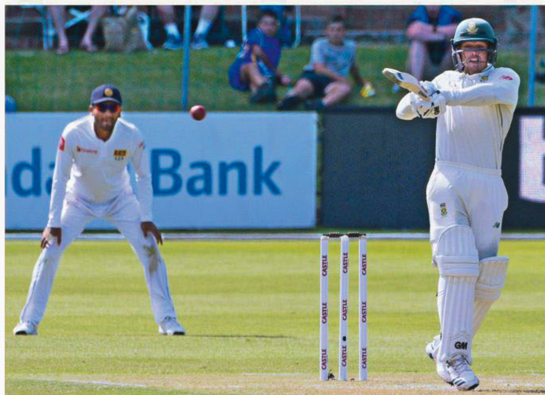
South Africa's Quinton de Kock pulls the ball during his knock of 86 runs as his team were bowled out for 222 in the first day of the second Test against Sri Lanka in Port Elizabeth yesterday. Sri Lanka were 60 for 3 wickets at stumps.

City still have some work to do in the return leg on March 12 with Fernandinho, who was booked when conceding the second spot-kick, and Otamendi both suspended.