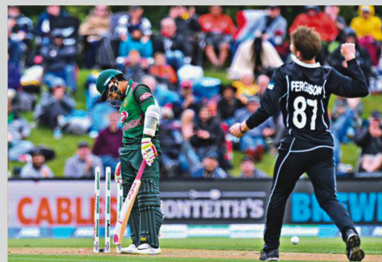
Mushfiqur Rahim perfectly captures the mood of the Bangladesh top order during their three-match ODI series against New Zealand. The highest the first five batsmen managed to take the total to was a paltry 93 runs.

A simple statistic depicts how badly the top-order performed in