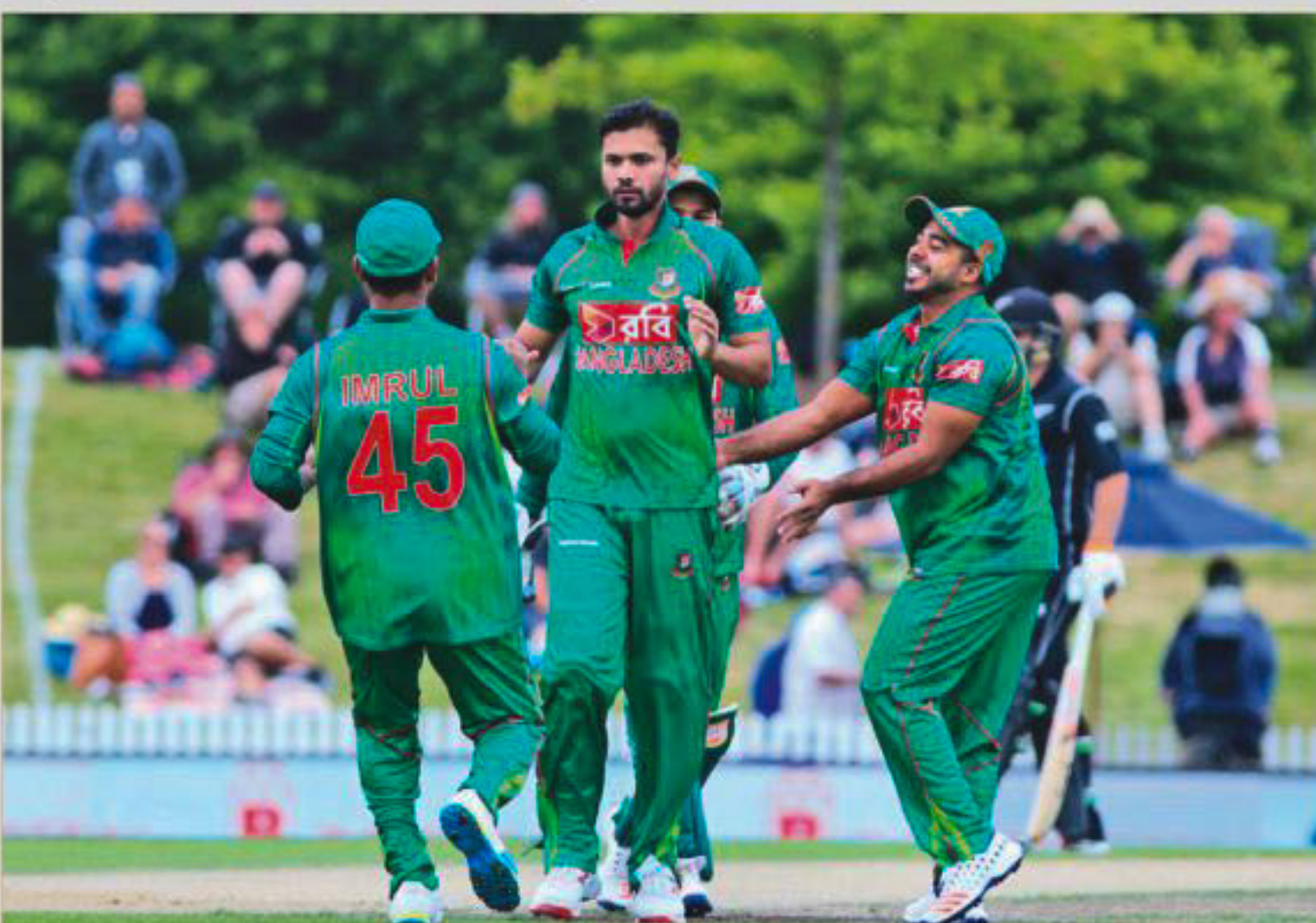
Unlike in 2016, the Tigers did not even come to the party this time around as they crumbled to a series sweep against New Zealand with two eight-wicket losses and an 88-run defeat against the hosts.

The Tigers were only to be blamed for losing the second game in Nelson where they bowled the home side out for 251 and then saw a second-wicket stand between Sabbir Rahman and Imrul Kayes taking the score to 105 in 22.5 overs. After the departure of Sabbir for 38, the Tigers