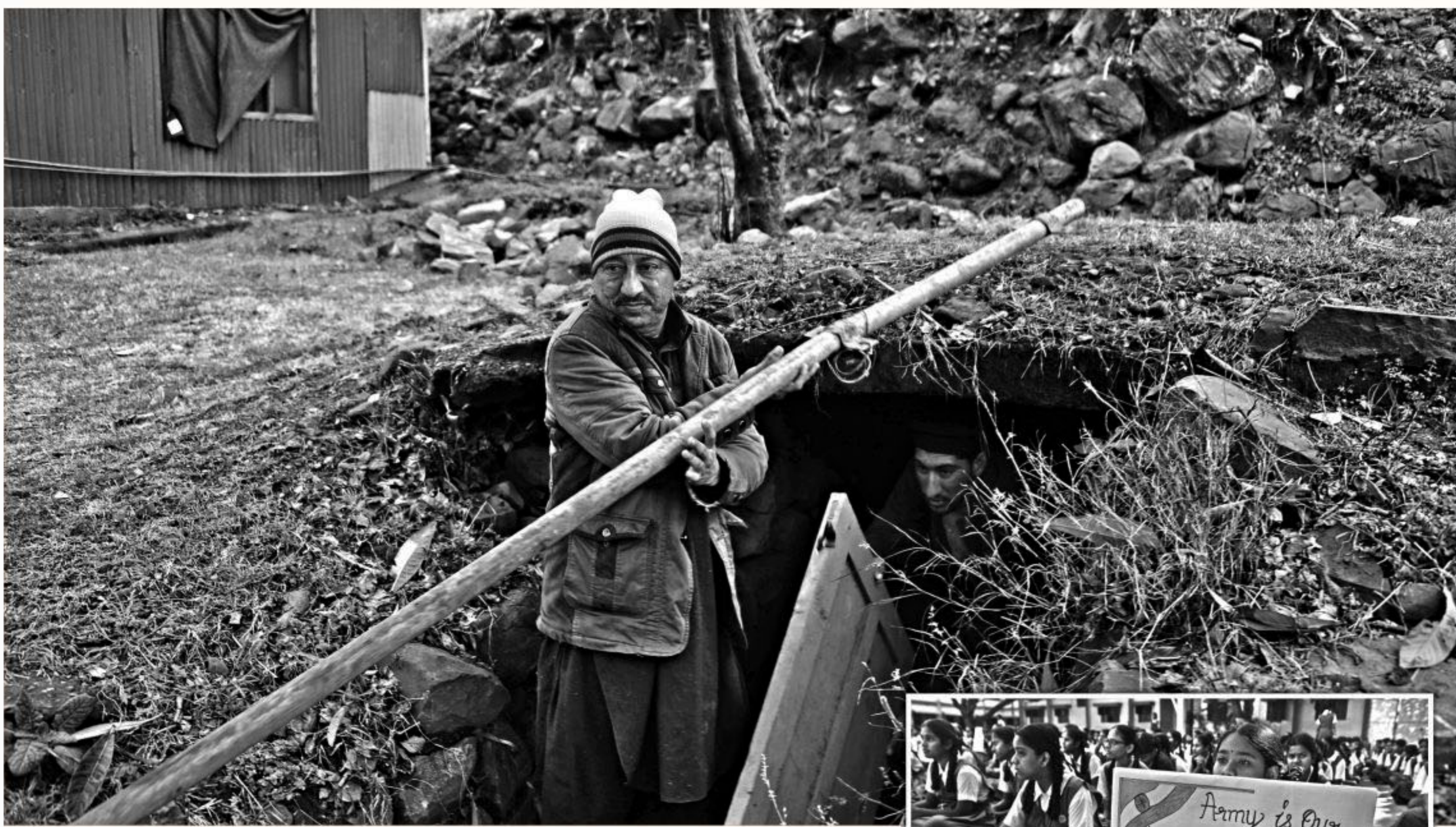
Local residents remove things from a bunker in the border town of Chakothi in Pakistan-administered Kashmir, some 3 km from Line of Control (LoC). Bunkers are being rebuilt and a blackout has been ordered in the area after a deadly attack in India-occupied Kashmir. Inset, an Indian student from the Saint Francis Girls High School holds a placard as they pay tribute to the slain Central Reserve Police Force (CRPF) personnel, in Hyderabad.