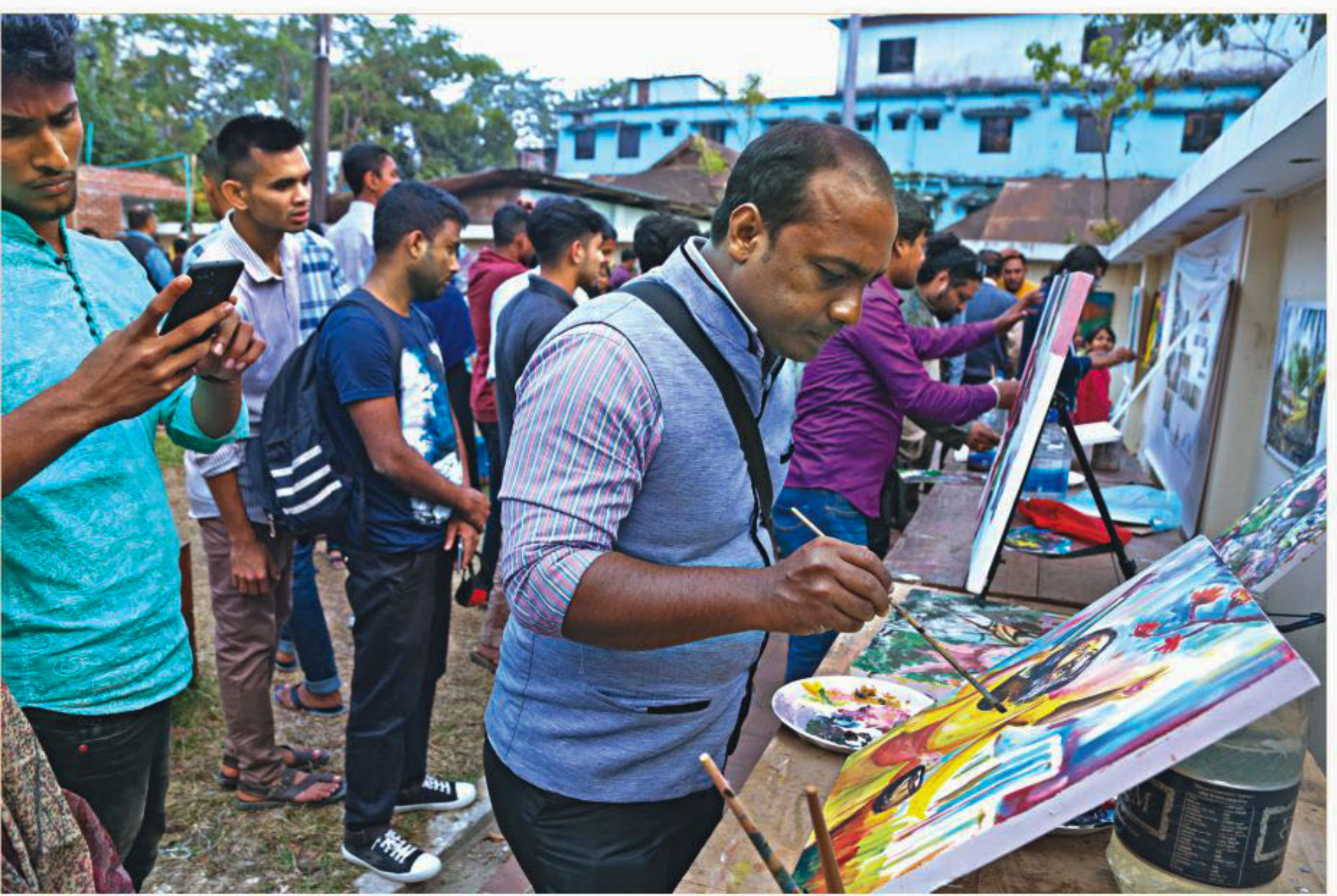
A colourful depiction of Ekushey comes to life on an artist's canvas at Sreehatta Art Camp on Sylhet Central Shaheed Minar premises yesterday.