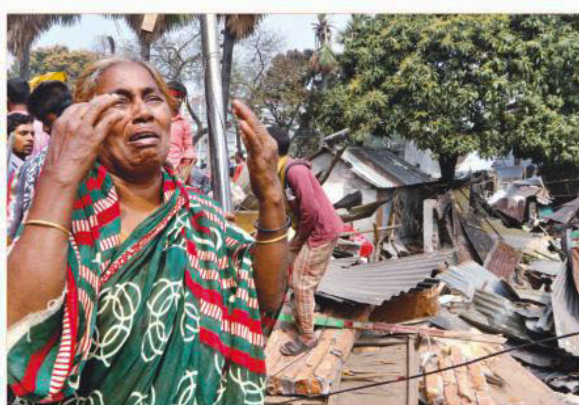
A distraught woman sitting on the scattered shards and rubble of what was her home at Bhasantek slum. Below, residents of the slum in tears after their homes and shops have been bulldozed by the National Housing Authority yesterday.