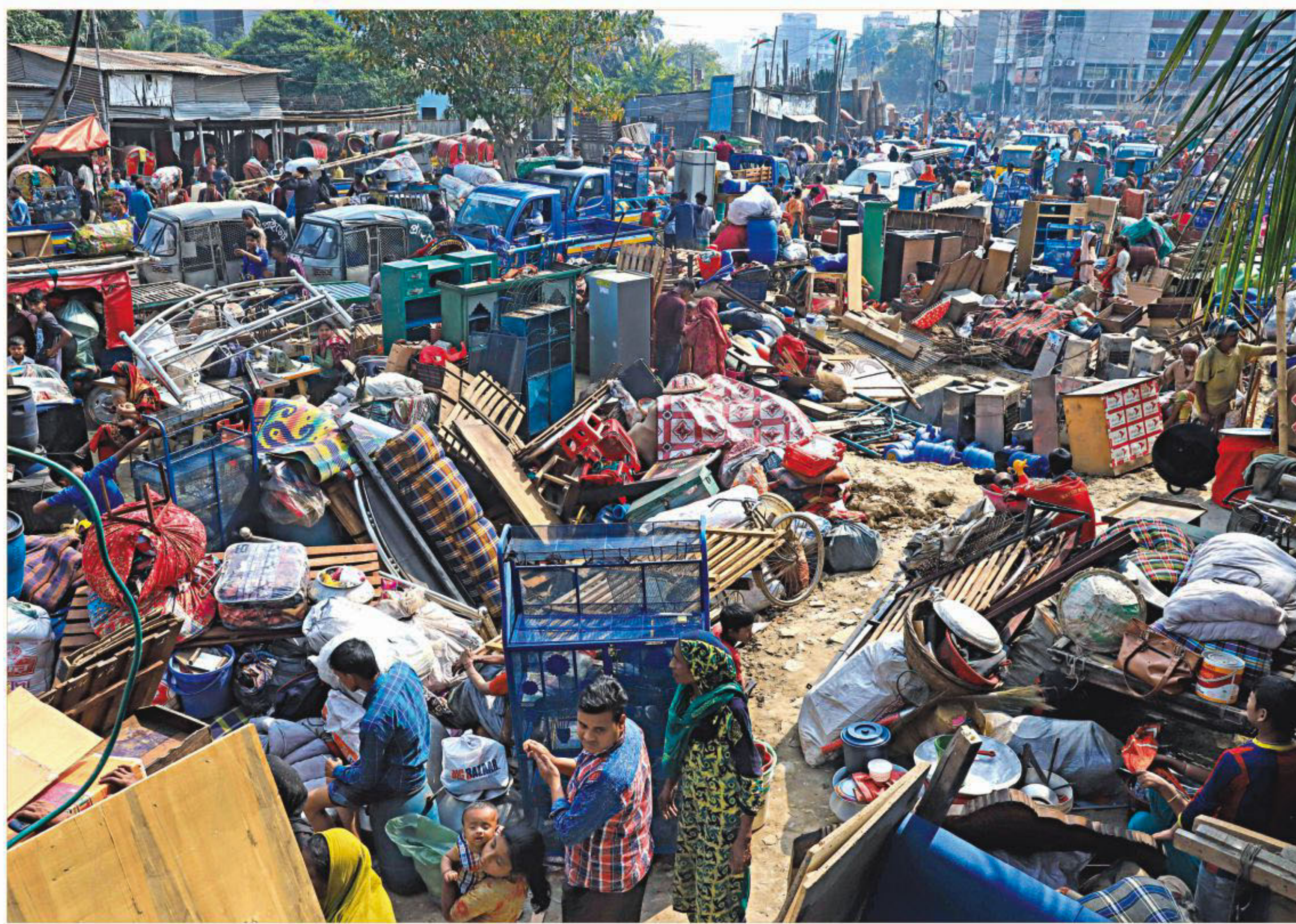
Furniture and household goods are left in the open in the city's Bhasantek area after the National Housing Authority carried out an eviction drive at Bhasantek slum yesterday. The authorities say they will build flats on 10 acres of government land there.