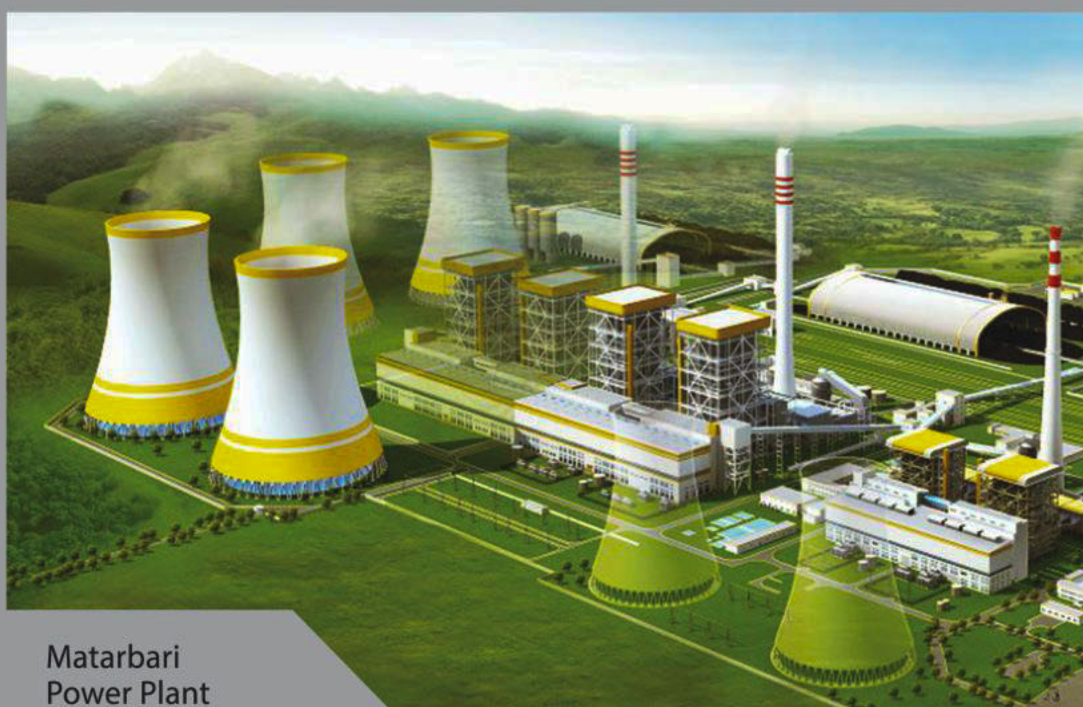
Matarbari Power Plant