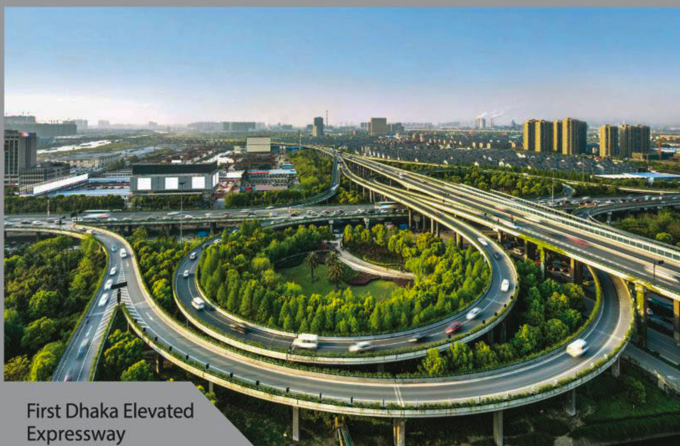
First Dhaka Elevated Expressway

We believe in progression. So the major infrastructural architecture of present Bangladesh including the first Dhaka Elevated Expressway, Metro Rail, Sirajgonj Power Plant, Rooppur Nuclear Power Plant, Matarbari Power Plant and Padma Bridge are being constructed with the international standard quality Bashundhara Cement.