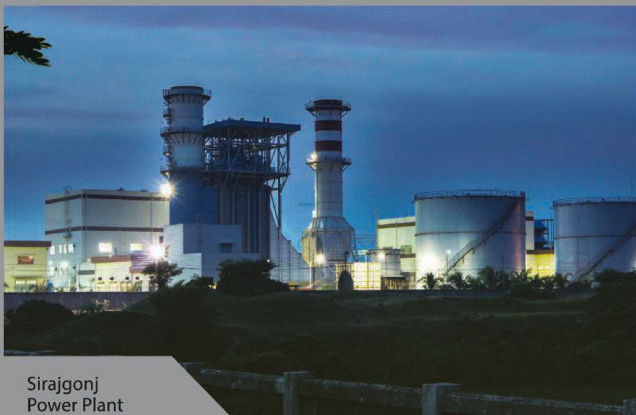
Sirajgonj Power Plant