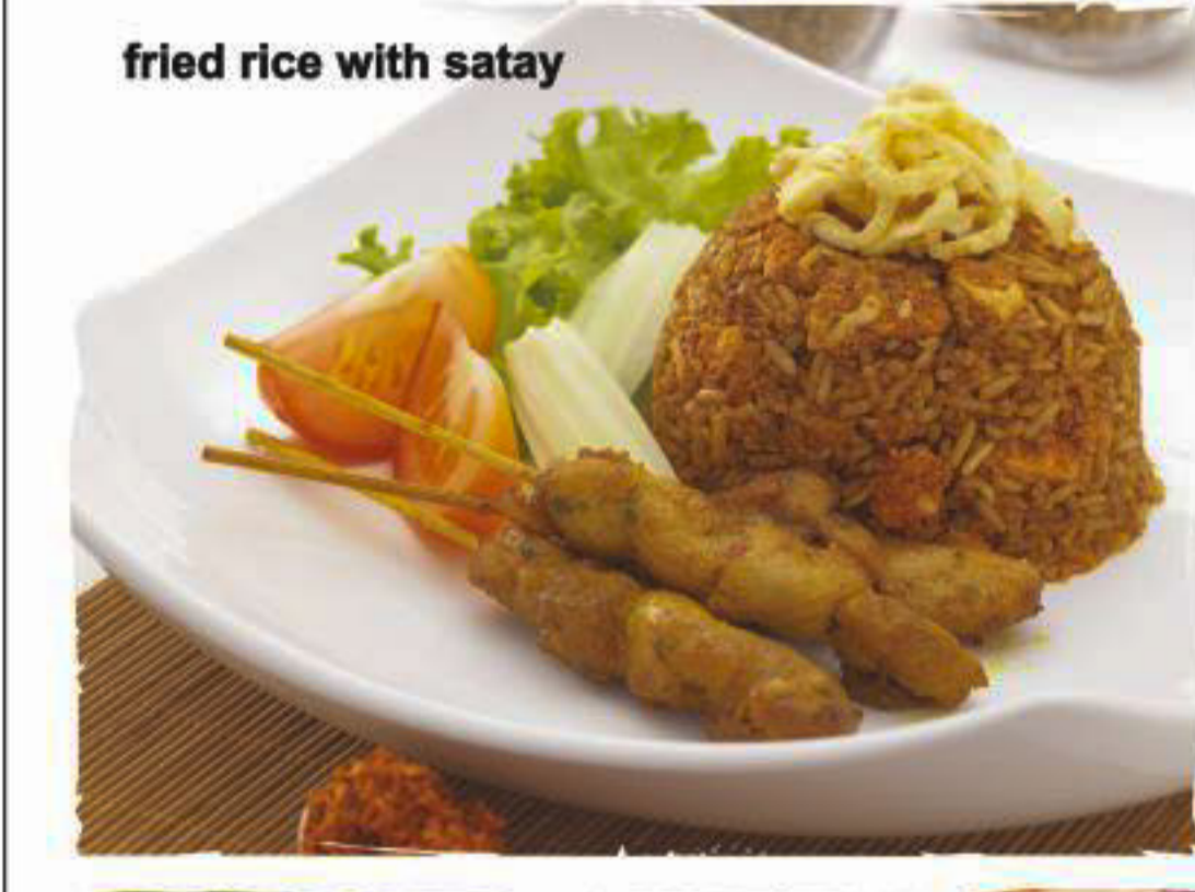
fried rice with satay