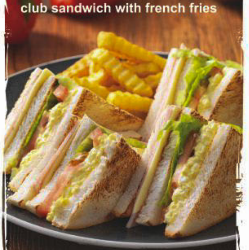
club sandwich with french fries