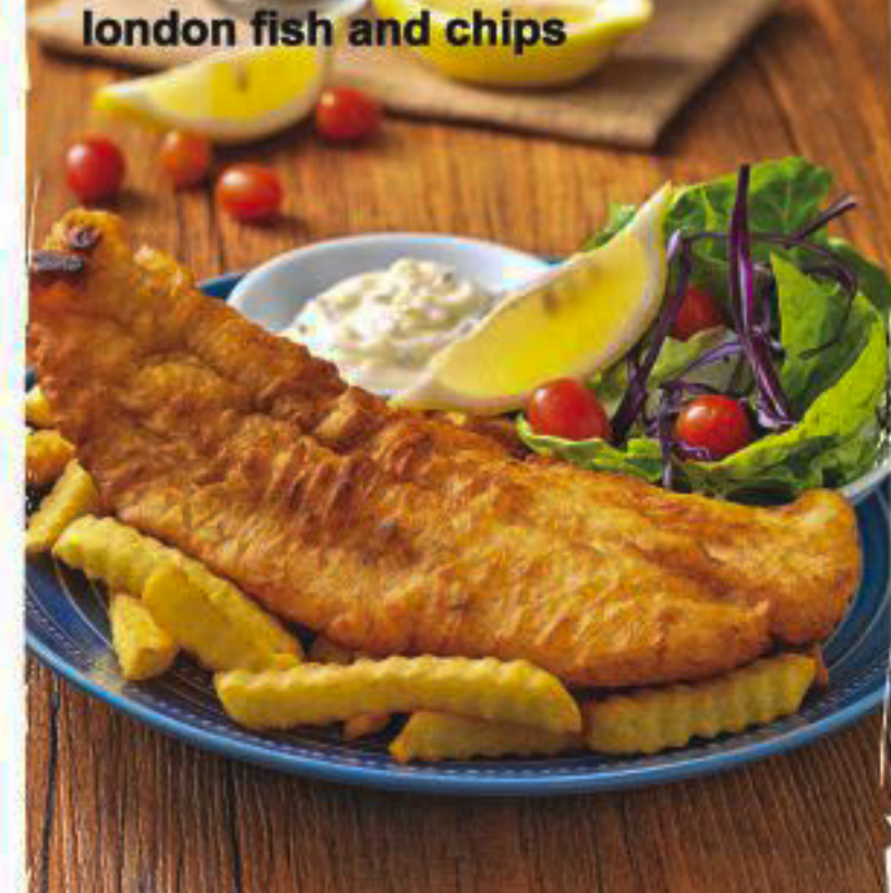
london fish and chips