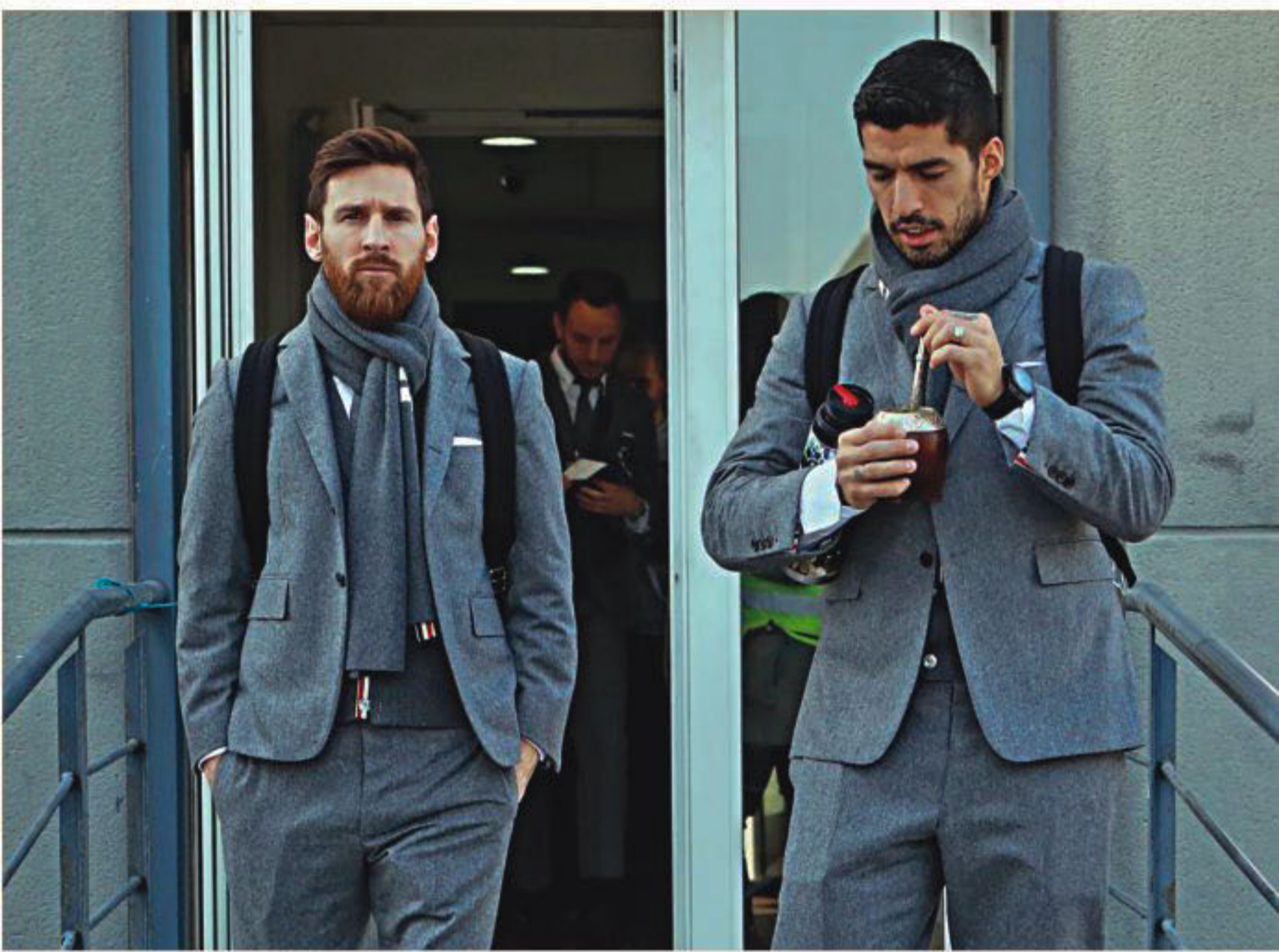
Barcelona superstar Lionel Messi (L) and strike partner Luis Suarez arrive at the Lyon-Saint Exupery Airport yesterday ahead of their Champions League Round of 16 first leg tie against Olympique Lyon tonight.