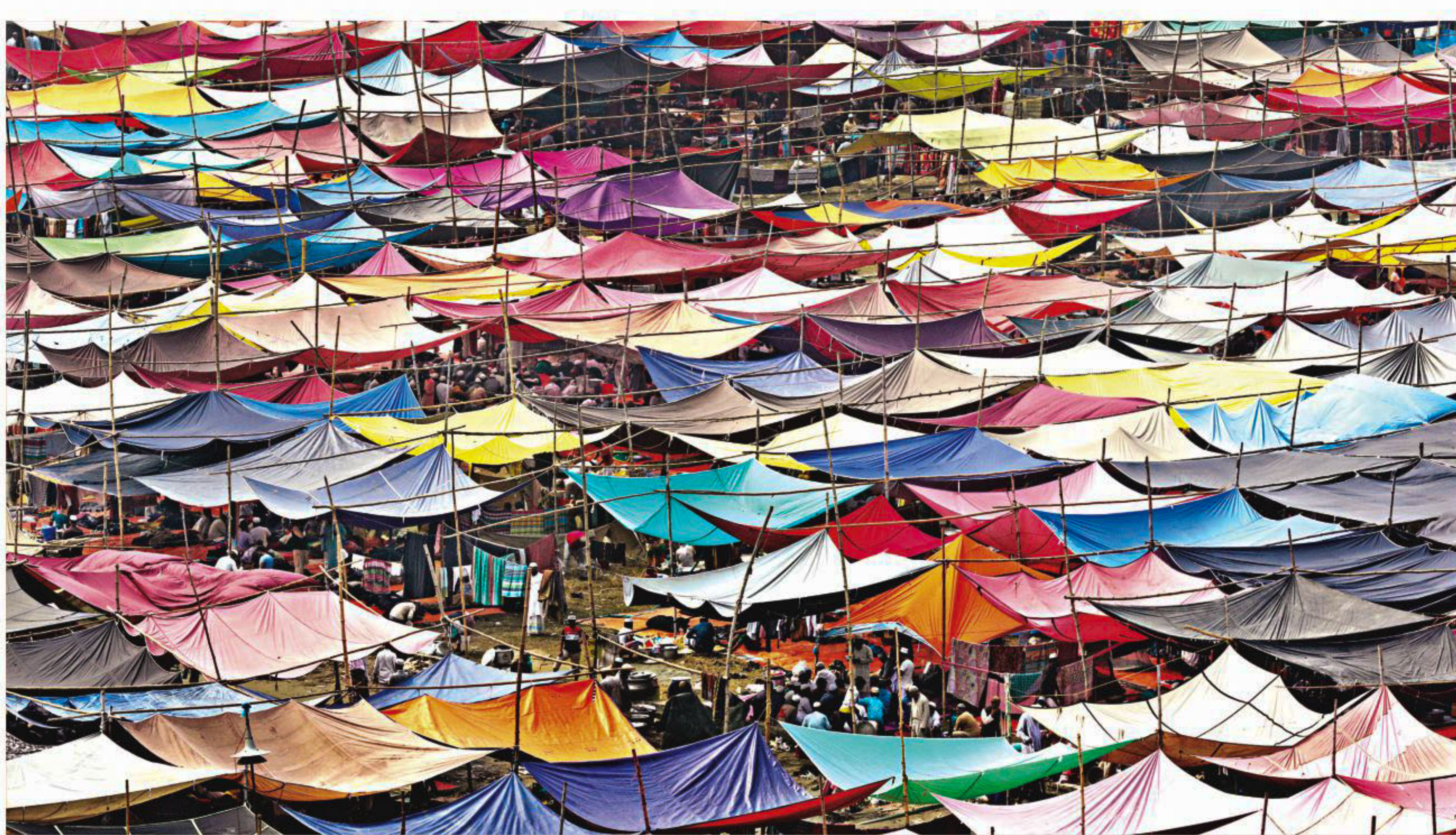
Thousands of devotees camp out under a rainbow of canopies on the penultimate day of Biswa Ijtema 2019. The second akheri munajat is scheduled for today, on the bank of the Turag river in Tongi. This picture was taken yesterday morning.

The platform also said that they would not form any alliance with any student organisation that has a "parent political party" but would welcome the quota reformists for a "discussion" if they want.