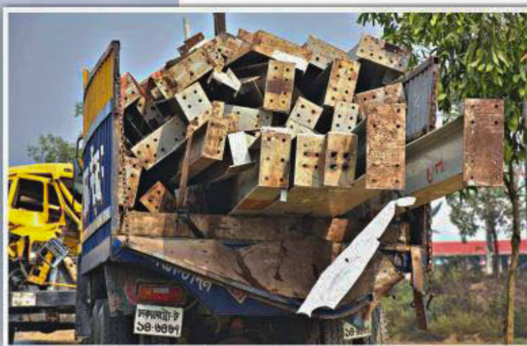
The severely damaged bus after it hit a truck, inset, loaded with steel bars from behind in Cumilla yesterday.