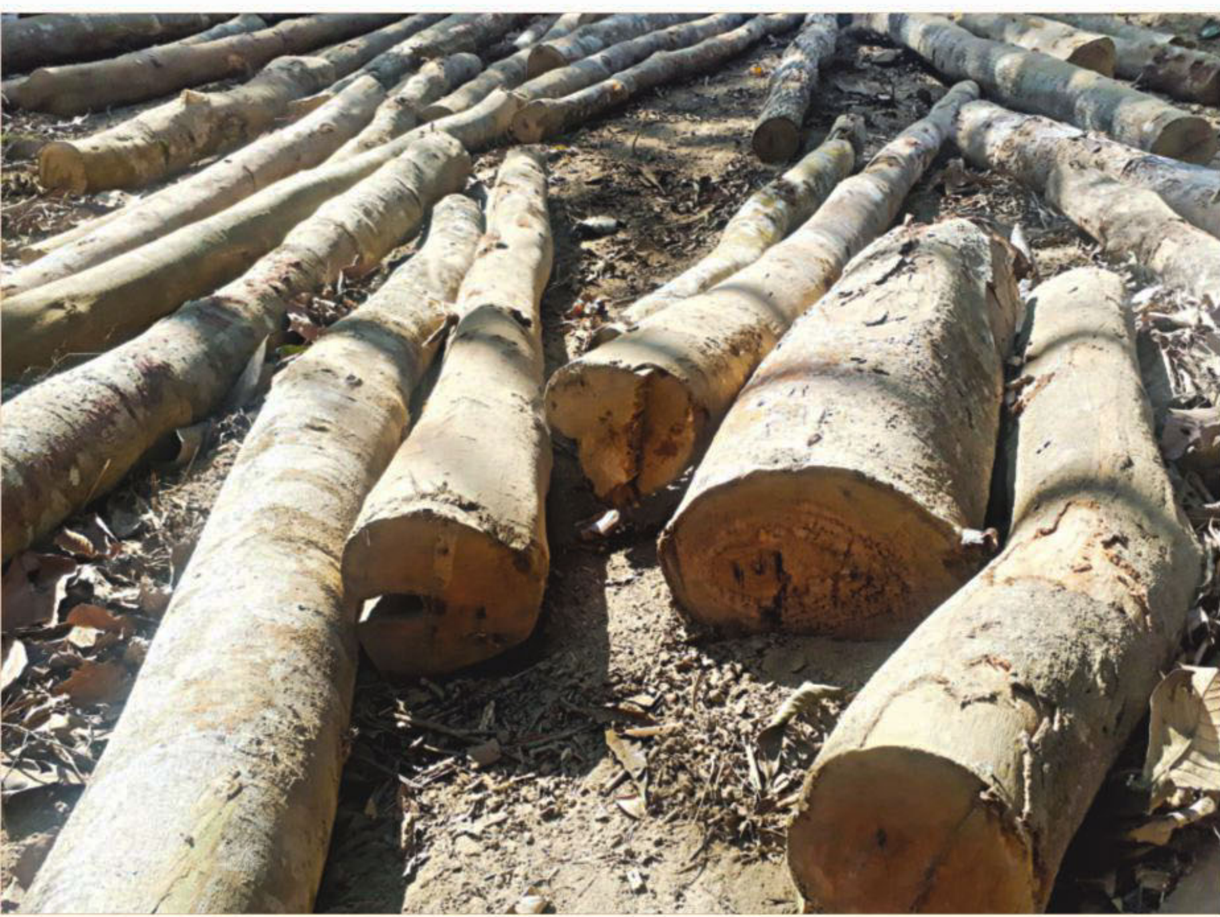
The forest department seizes logs of over a hundred trees, felled allegedly without permission, at Manchara forest area in Kulaura upazila of Moulvibazar during the last couple of days.