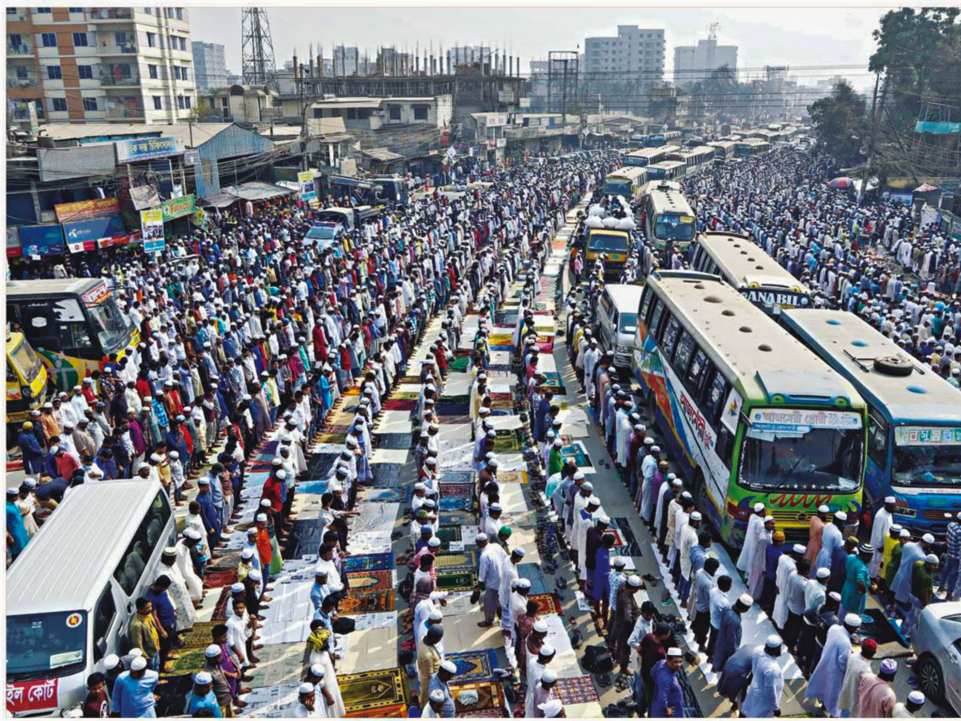
Devotees spill over on to Dhaka-Mymensingh highway near Tongi Bus Stop during the Juma prayers on the first day of Biswa Ijtema yesterday.