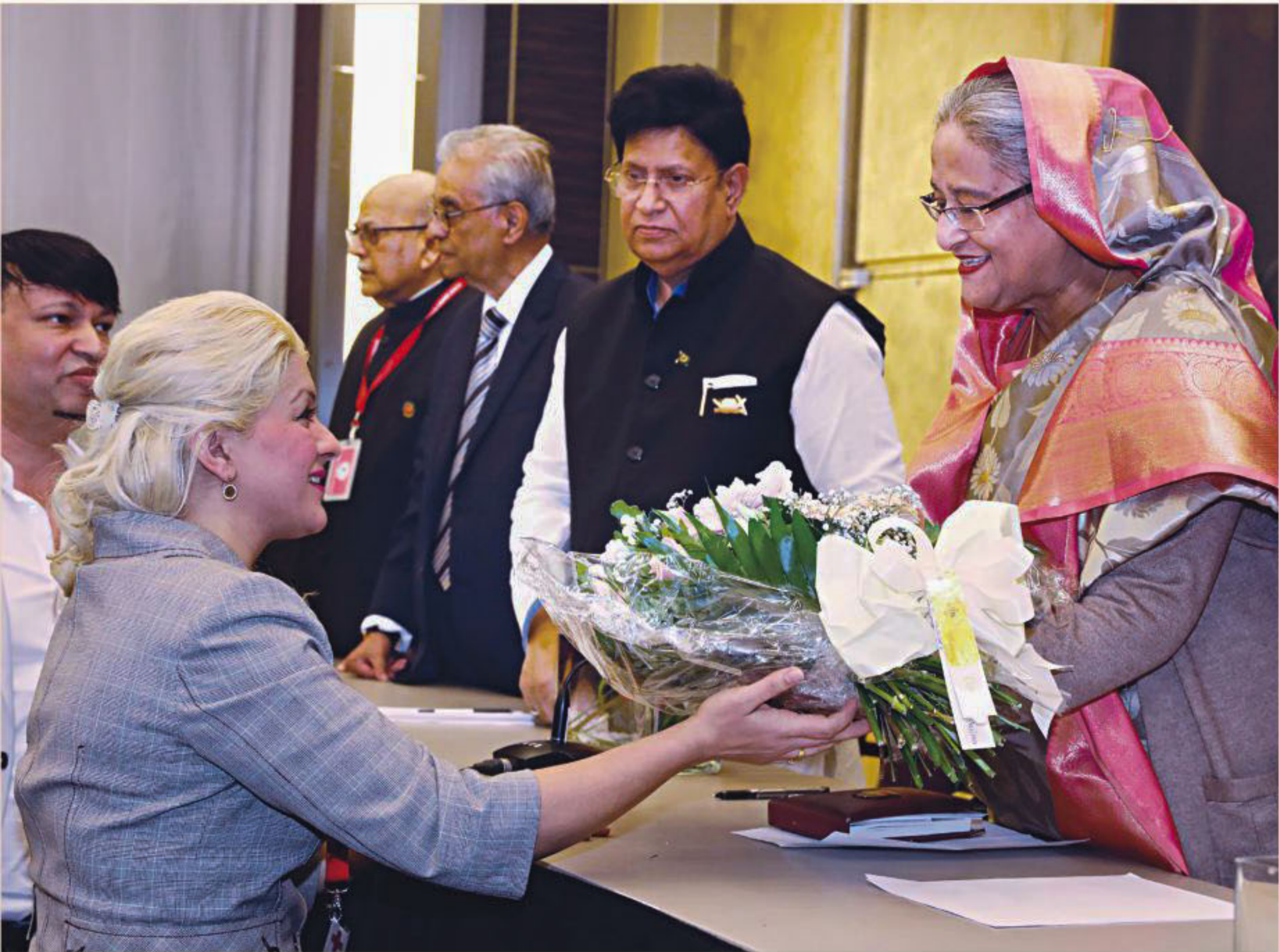
A representative of German Red Cross greets Prime Minister Sheikh Hasina with a bouquet for sheltering Rohingyas in Bangladesh on humanitarian grounds. The photo was taken during a civic reception accorded to Hasina by expatriate Bangladeshis at Hotel Sheraton Munich Arabella Park on Thursday.