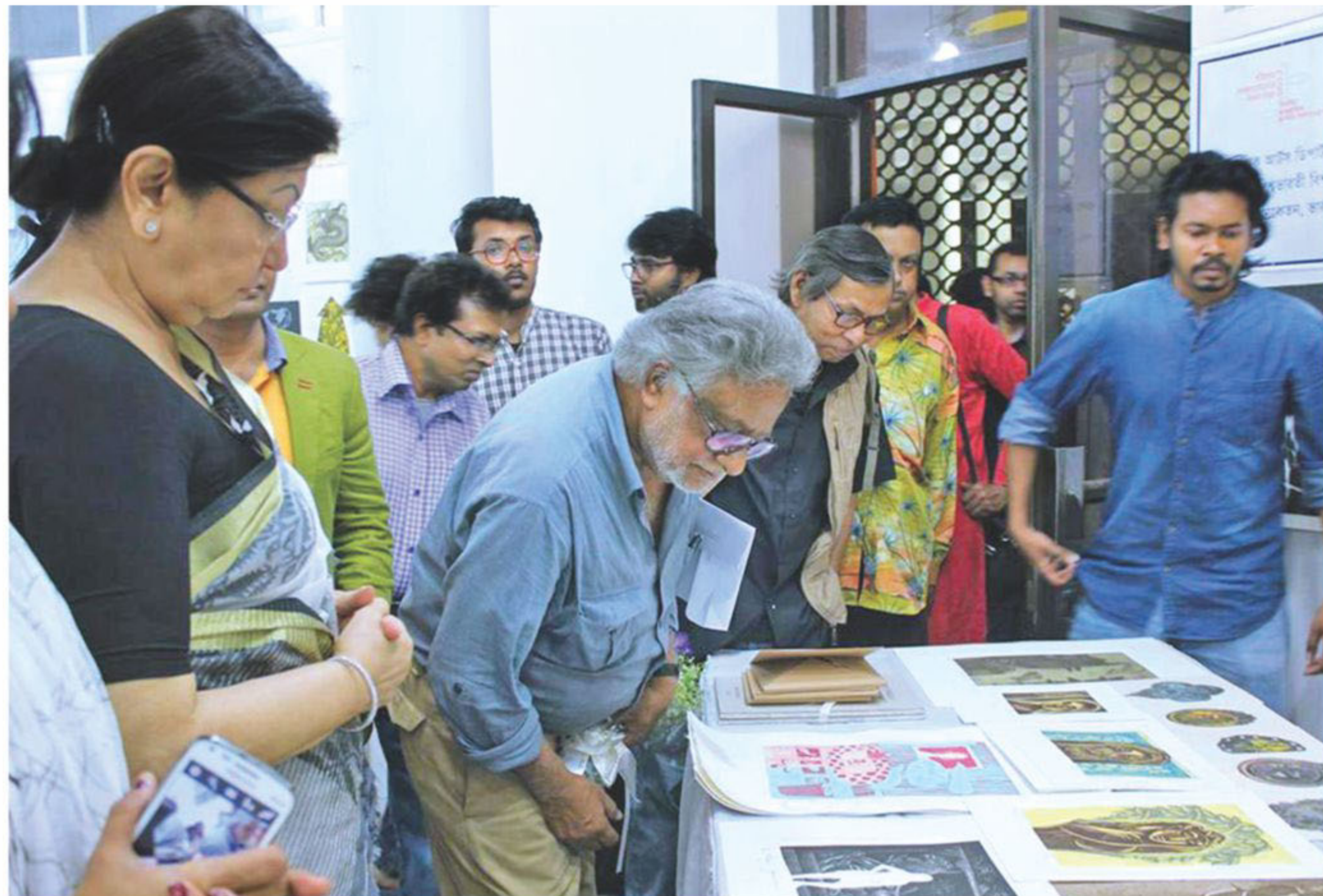
Renowned artist Monirul Islam (centre) viewing the exhibit.

Apart from that, several renowned Dhaka and Delhi-based printmaking studios will participate in the fair that is open from 3 pm to 8 pm daily, until February 17.