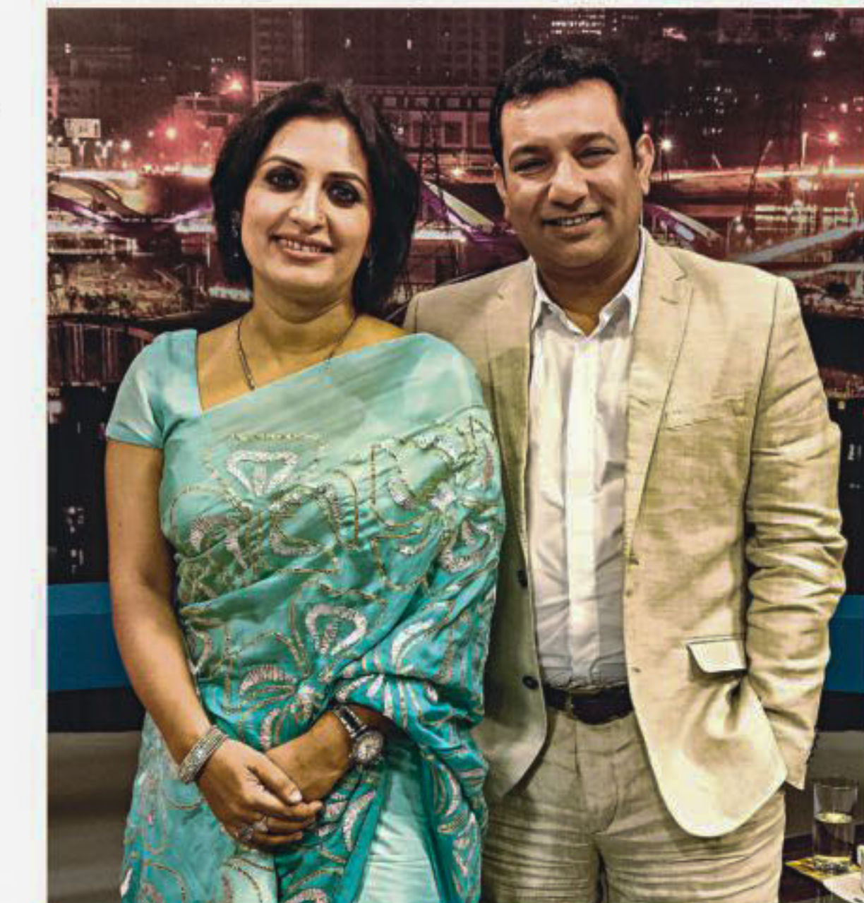
Bipasha Hayat and Tauquir Ahmed

SHAH ALAM SHAZU Noted actor Zahid Hasan has been entertaining viewers with his versatile roles both on television and the silver-screen for years. He also has a number of tele-fictions to his credit as a director. On the other hand, his wife, a noted model, actor and dancer, Sadia Islam Mou, has been enthraling the audience for ages. Both of them have built a happy life together with two kids. Internationally acclaimed director Mostafa Sarwar Farooki and popular actor Nusrat Imrose Tisha, who have been happily married for a long time, have teamed up for numerous projects on the professional front. Tisha has been featured in many of Farooki's films. Needless to say, they make a great team, both on and off screen. The famous power couple Omar Sani and Moushumi fell in love on the sets of their films and eventually tied the knot. They first worked together in the film, Prem Prem , which became a smash hit. Today, they are parents of two children. Mosharraf Karim taught at a coaching center where Jui was a student. They eventually fell in love and got hitched. While Mosharraf has established himself as one of the busiest actors on television, Jui's acting career is promising.