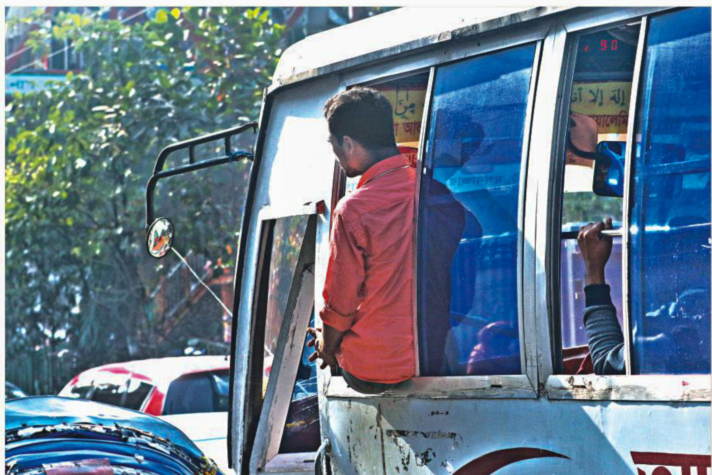
A man sits on a window of a bus while it travels on a road in the capital's busy Motijheel area yesterday. Such stunt could turn fatal in no time.