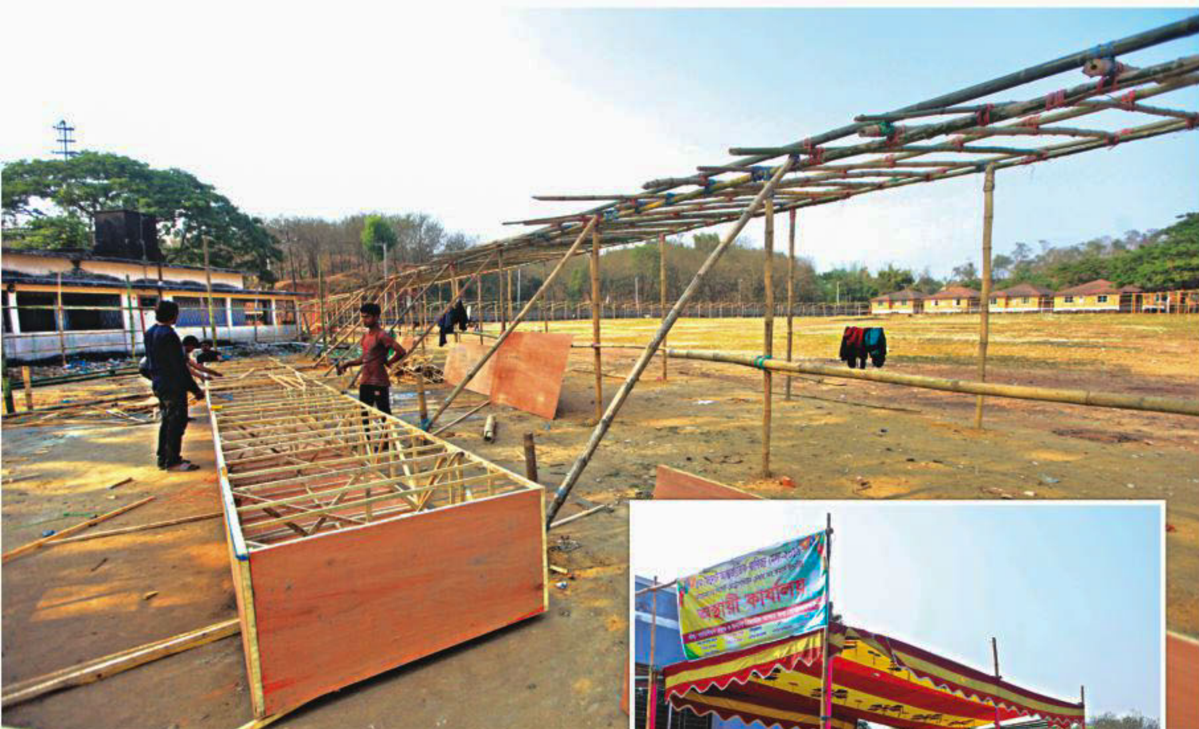
Barely a month has passed since the last trade fair ended at Sheikh Russel Mini Stadium in Sylhet. Now, work is going on to hold another month-long fair. Inset, a temporary office set up by organisers.