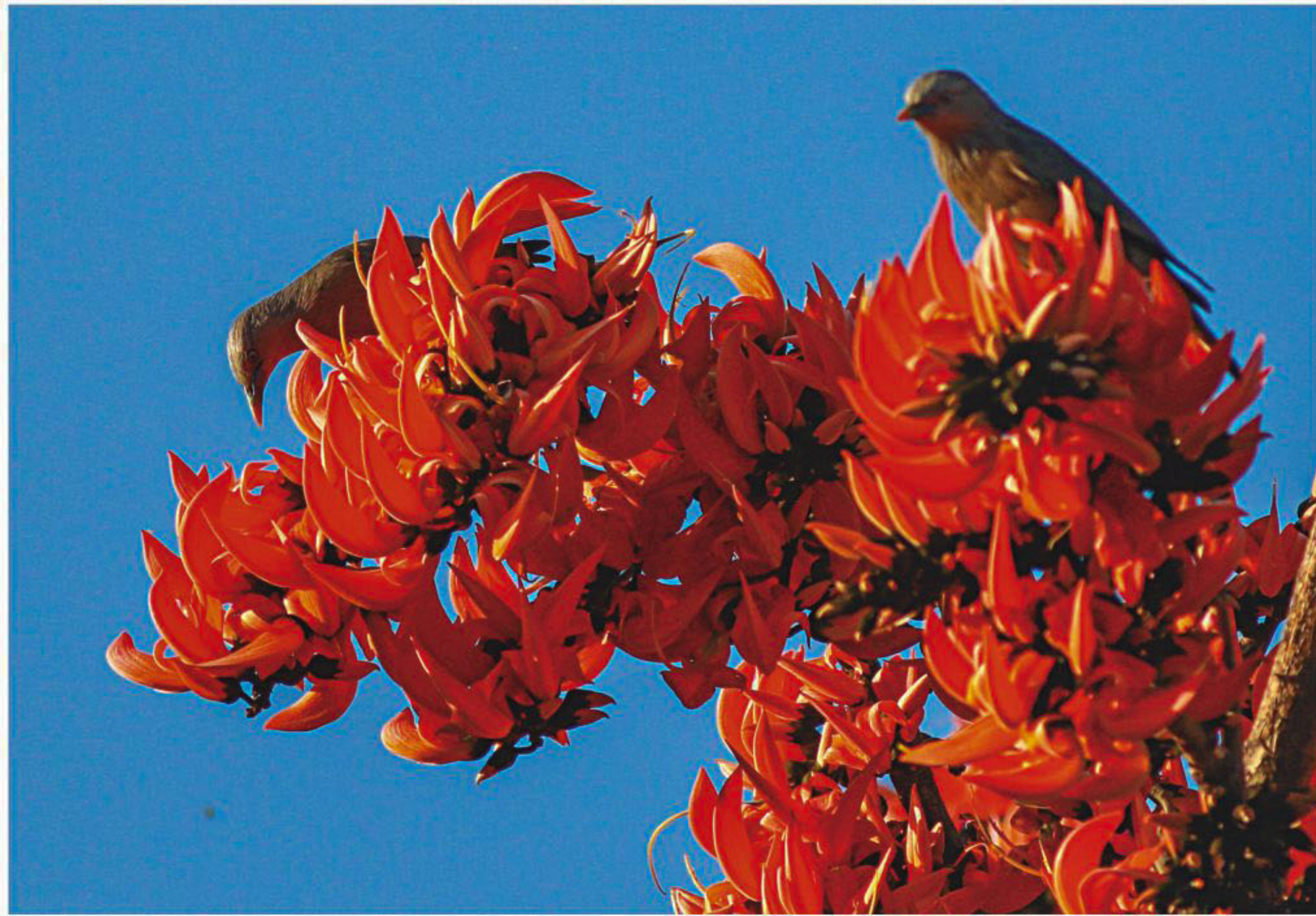
The fiery kiss of the Palash flower, which is adorned by two brilliantly coloured birds perched on its top, ushers in the month of Falgun and its companion season Spring. The photo was taken in Chattogram city's Court Hill area early this month.