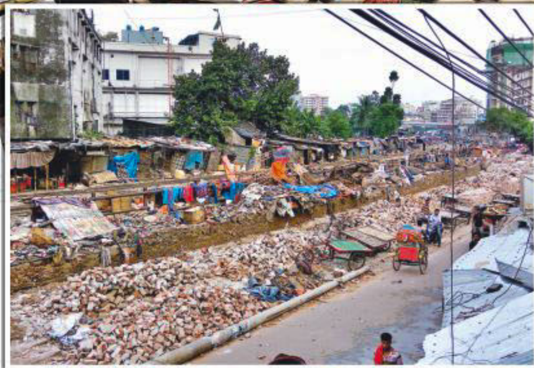
A few depots and shops line the rail tracks from Tejgaon station to the FDC level crossing, which has once again been encroached upon. Inset, this file photo of the same rail tracks last year shows the rubble of illegal structures and shanties demolished for the construction of an elevated expressway. With no oversight after the eviction, things are back to the way they were.