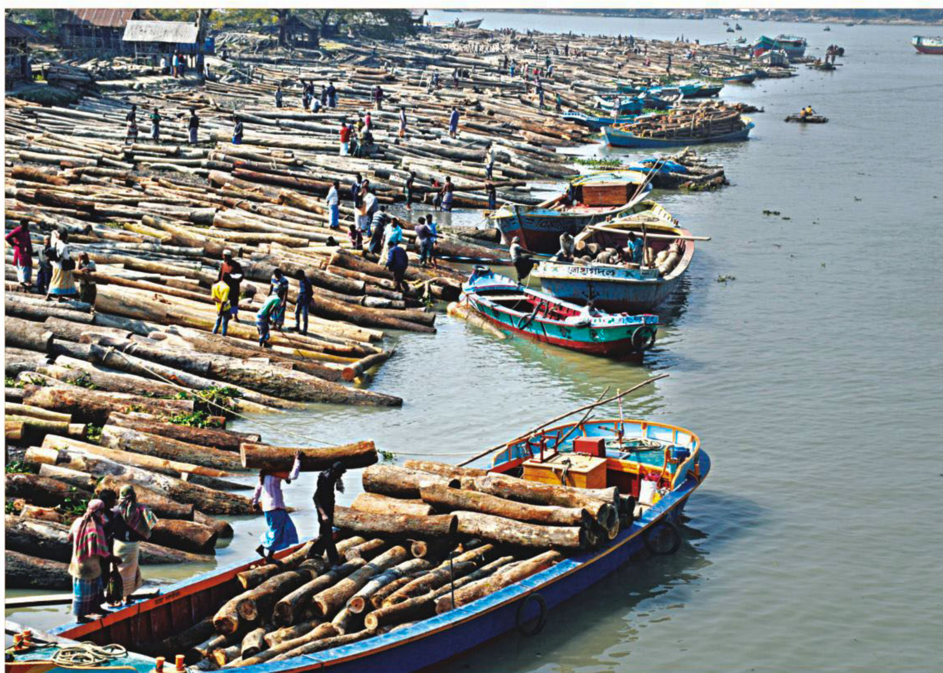
The banks of the Shitala, a tributary of the Shondi river, are full of logs brought from nearby areas. This is one of the country's biggest log markets set up on khasland in Pirojpur's Swarupkathi upazila.