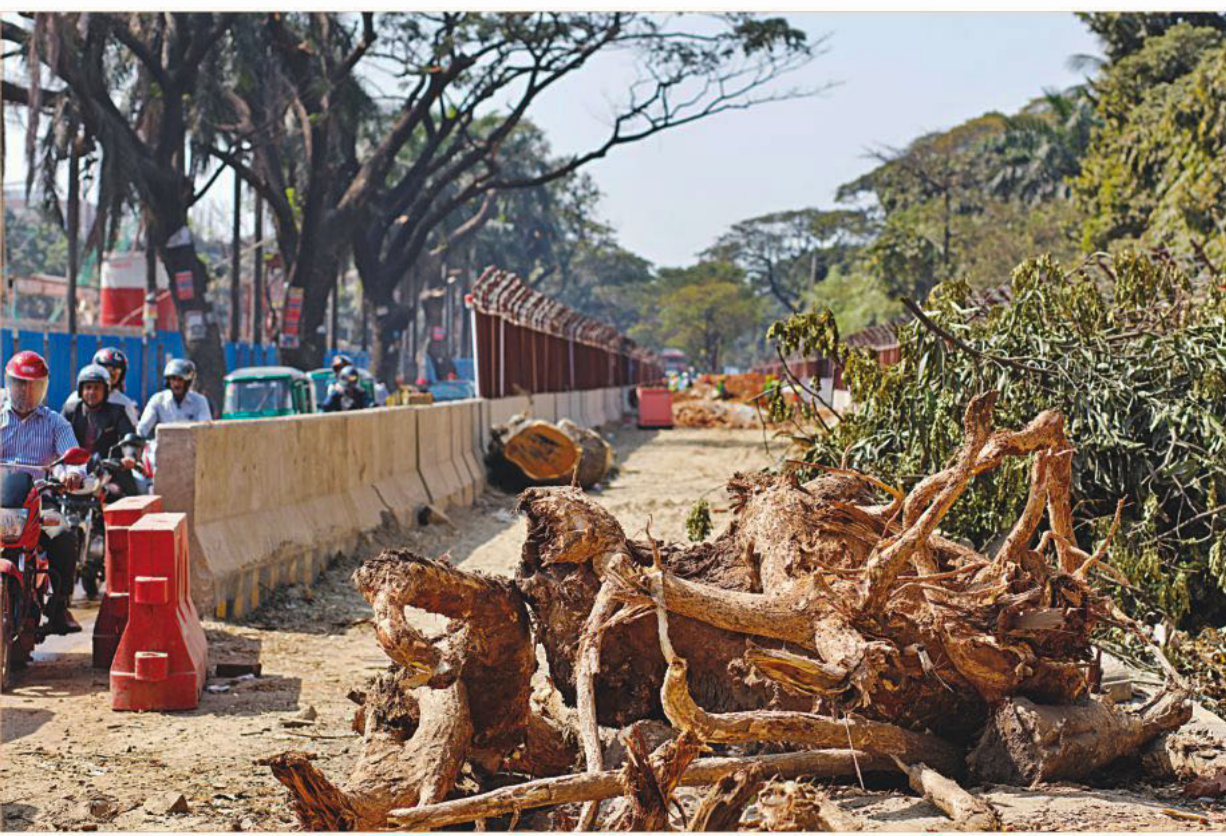
VICTIM OF DEVELOPMENT: A number of trees have been felled on the Khamar Bari Road in the capital recently, to make way for the construction of the metro rail project. The photo was taken yesterday.