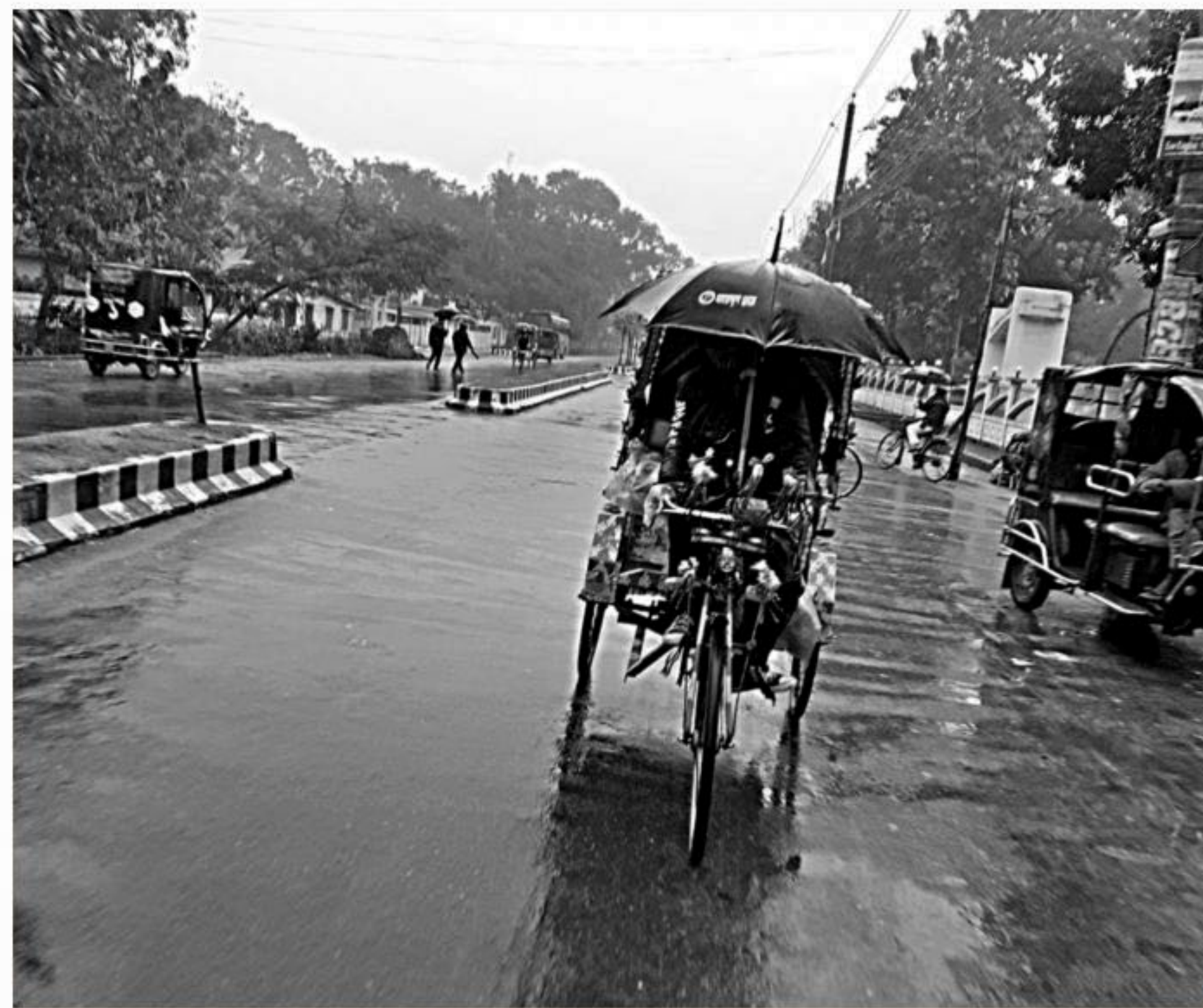
The main thoroughfare in front of Thakurgaon Government Boys' High School in the district town sees very thin presence of vehicles and pedestrians as hours-long drizzle during the ongoing winter paralysed life in the area yesterday.

Police rushed to the spot and fired 10 rubber bullets and four tear gas shells to bring the situation under control and later arrested two men from the area, said Habiganj Model Police Station OC Mohammad Sahidur Rahman.