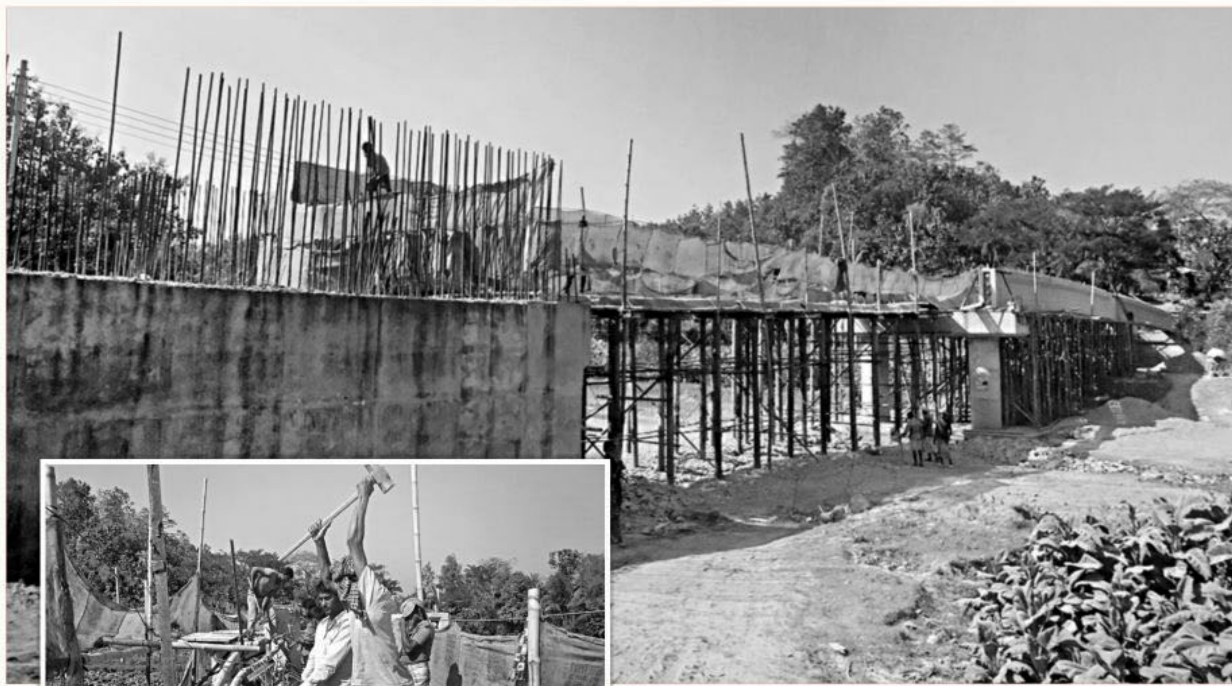
An under-construction bridge collapsed at remote Roambo village in Bandarban's Alikadom upazila over a week ago. Inset, workers remove remains of the broken part of bridge.