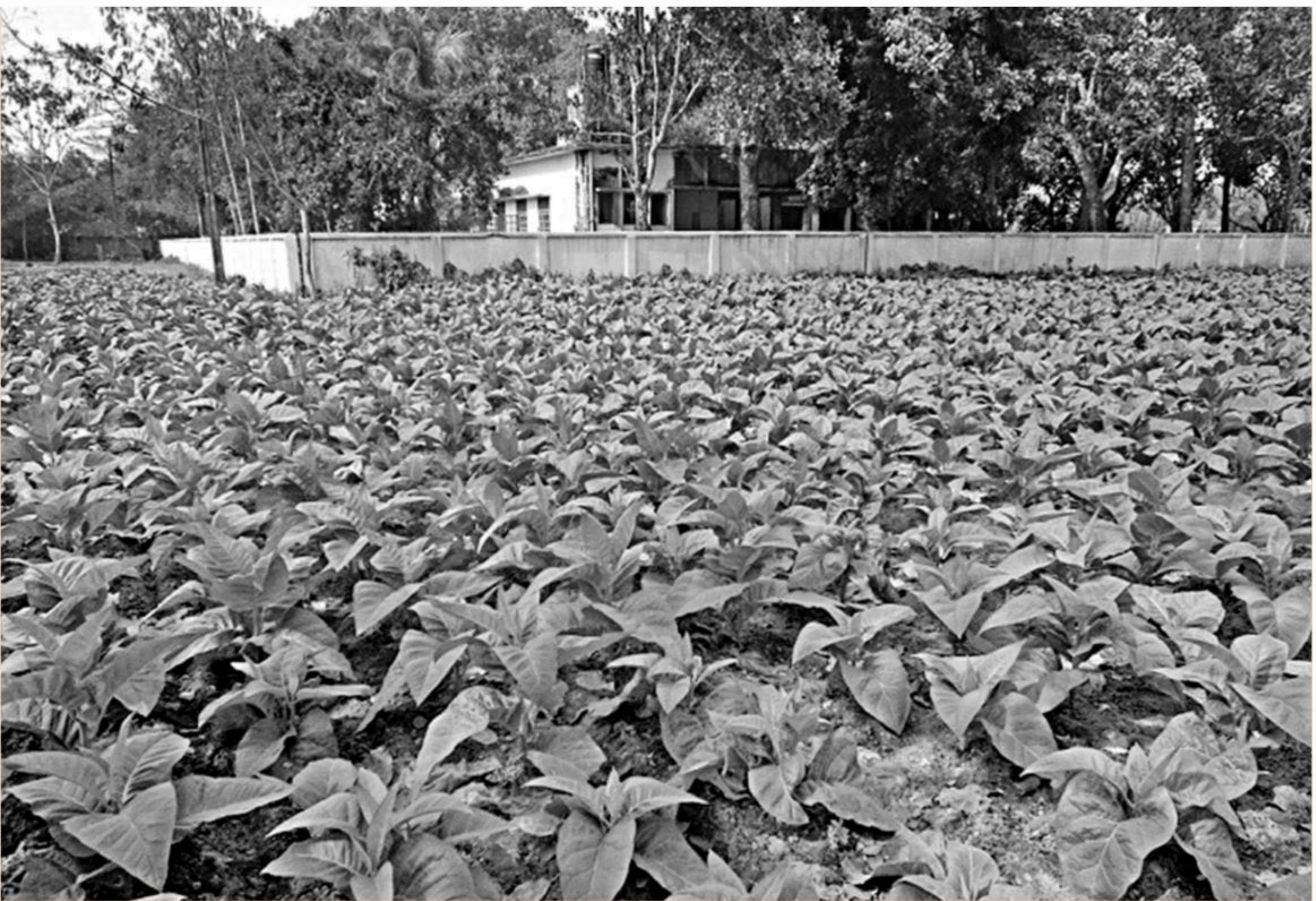
Tobacco farming continues on the land belonging to the government-run Leprosy Hospital in Nilphamari for years, thanks to the callousness of the growers and negligence of the authorities concerned.