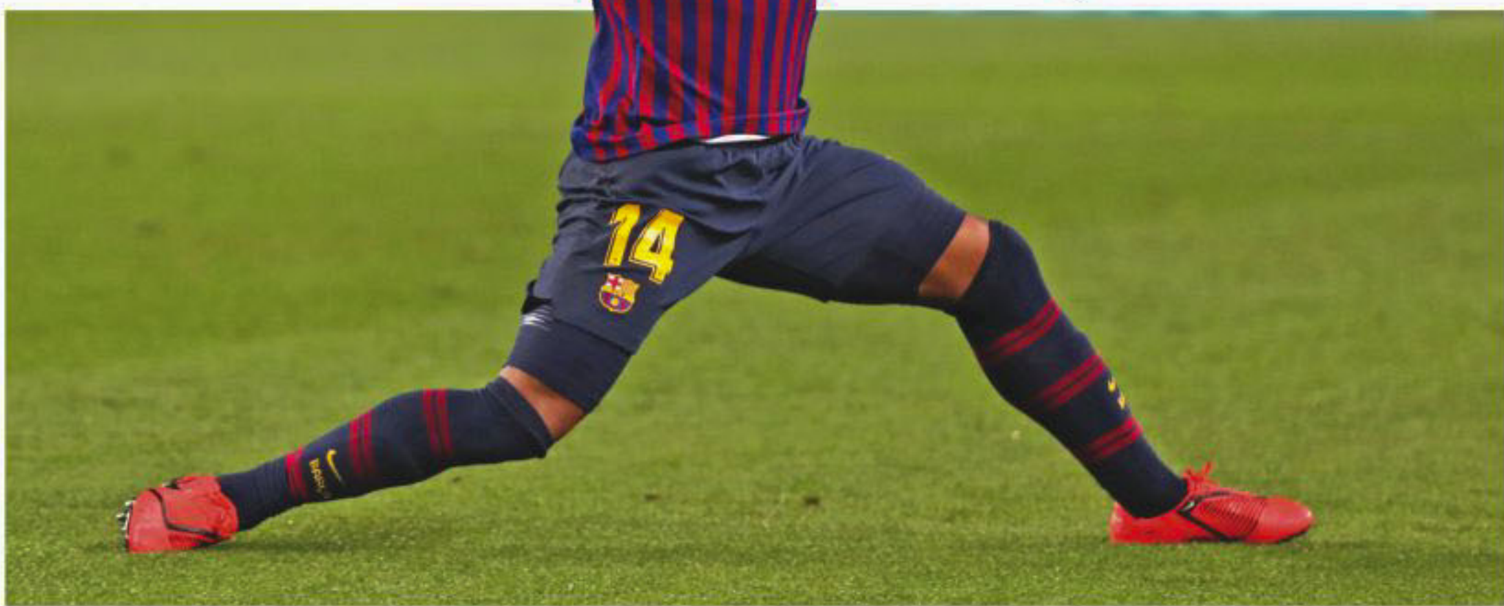
Barcelona midfielder Malcom celebrates his equalising goal against Real Madrid during their 1-1 draw in the Copa del Rey semifinal first leg at the Nou Camp on Wednesday.

Madrid had the better of the first half against Barcelona on Wednesday, breaking the deadlock through Lucas