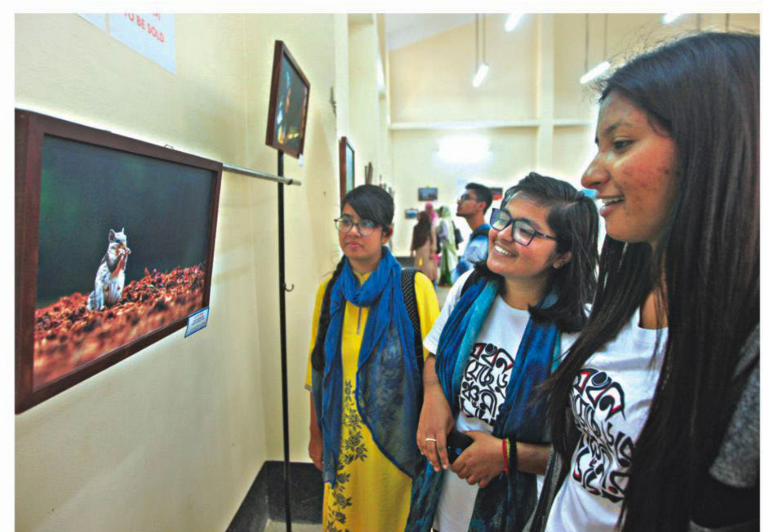
Visitors look at photographs at Sylhet Agricultural University's three-day National Photography Exhibition. Over a hundred photographs were selected for the exhibition through a nationwide competition.

Chase and counter-chase took place between two groups of Bangladesh Chhatra League (BCL)-affiliated youths yesterday afternoon over establishing supremacy on Chittagong University (CU) campus, causing panic among general students. The two groups, Choose Friends with Care (CFC) and Sixty Nine, are based around the shuttle train that runs to and from Chattogram city and CU. The groups armed themselves with sharp weapons and took position at Shah Amanat and Shahjalal Hall respectively at around 4 pm, said police. They engaged in multiple chases and counter-chases and pelted brickbats and stones. However, no one was injured, said Inspector Md Akhteruzzaman, in-charge of CU Police Outpost. Police fired three tear gas canisters to disperse BCL men and brought the situation under control, he added. On Tuesday night, two BCL activists were injured in a clash between the two rival groups over beating one of their members in the city's Sholoshohor Station. Three rounds of gunshots were heard during the clash, he added. A tense situation prevailed in the campus at the time of filing this report.