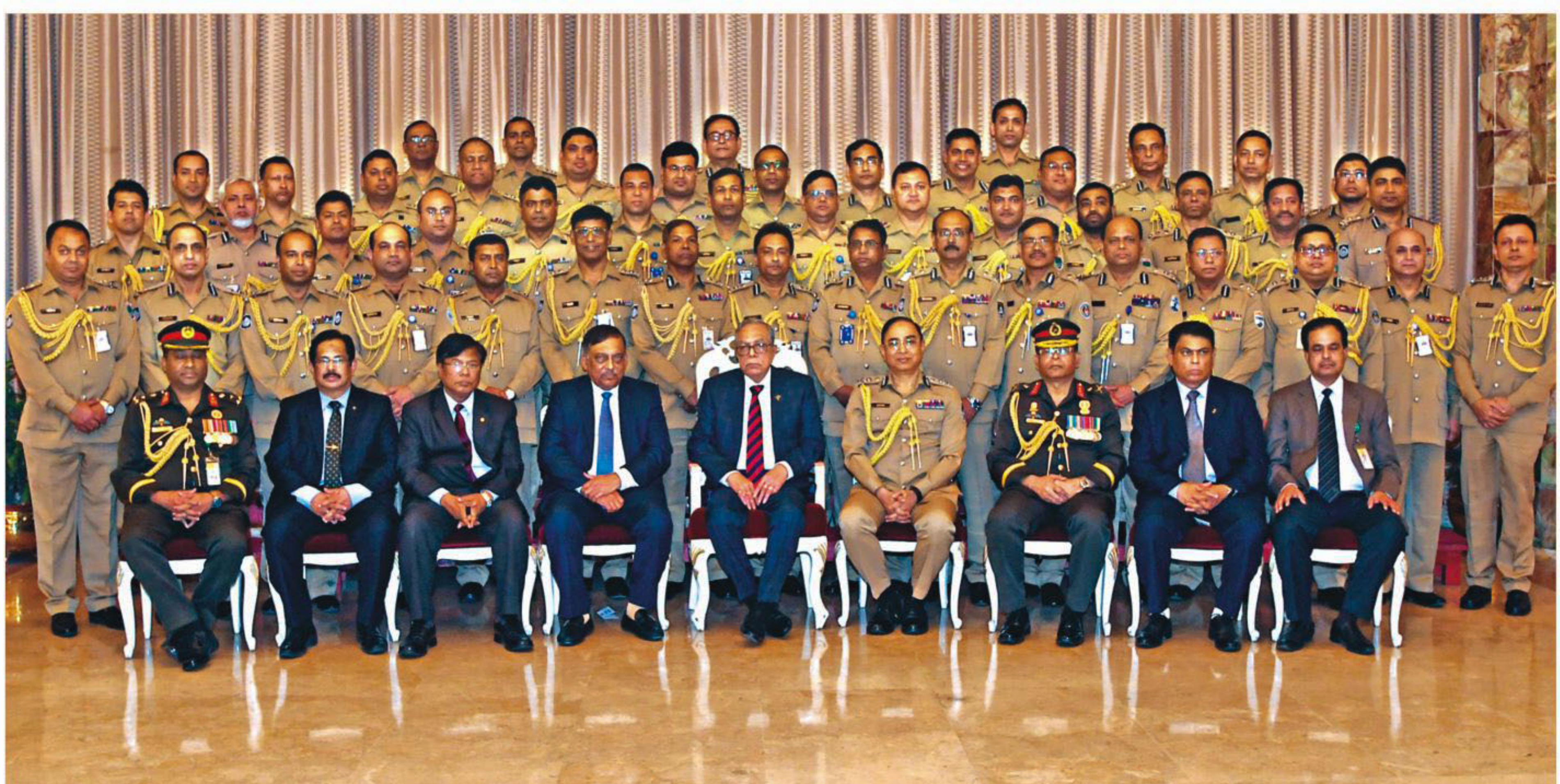
President Abdul Hamid with high officials of police at Bangabhaban yesterday, marking Police Week 2019.