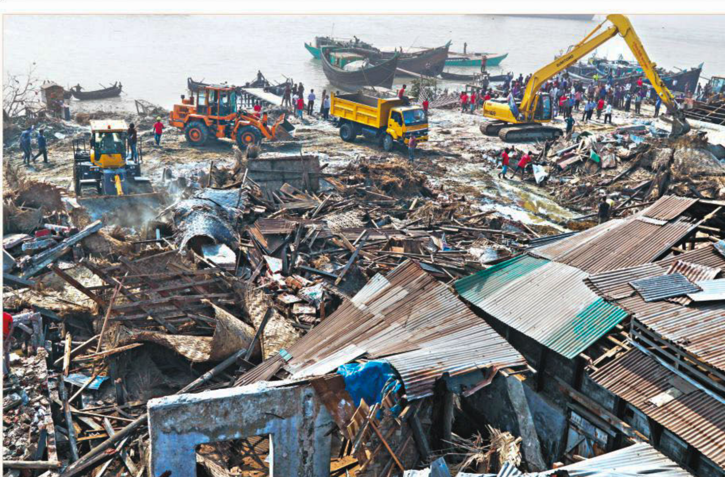
Erection drive continues on Karnaphuli river banks. On the third day, 40 structures were demolished, bringing the total number of dismantled structures to 120.