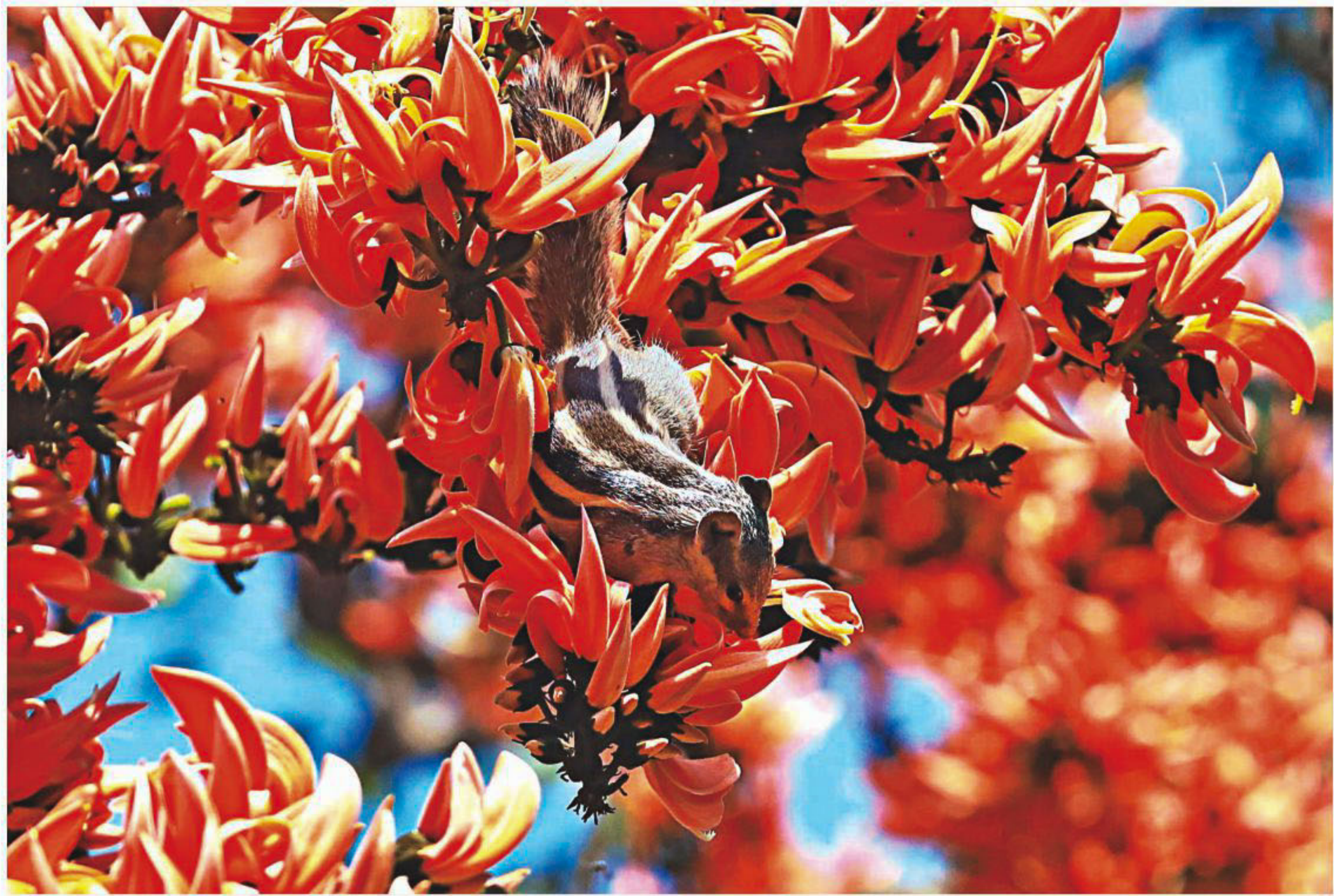
A squirrel rests on a branch of a blooming Shimul tree. This deciduous tree has shed its leaves during winter and bold red flowers have started to appear at the advent of spring. The photo was taken at Ramna Park recently.