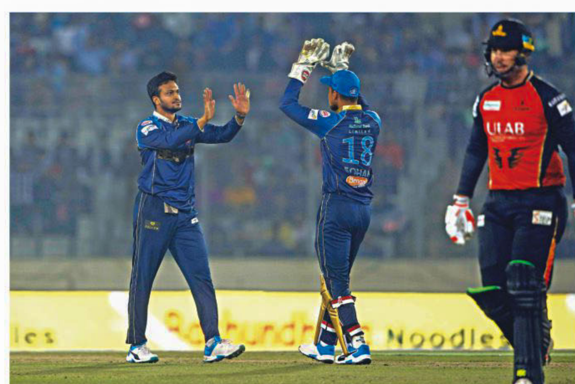
Dhaka Dynamites captain Shakib Al Hasan (L) celebrates one of his two wickets which helped the side defeat Khulna Titans by six wickets and secure their place in the playoff phase in a BPL encounter in Mirpur yesterday.