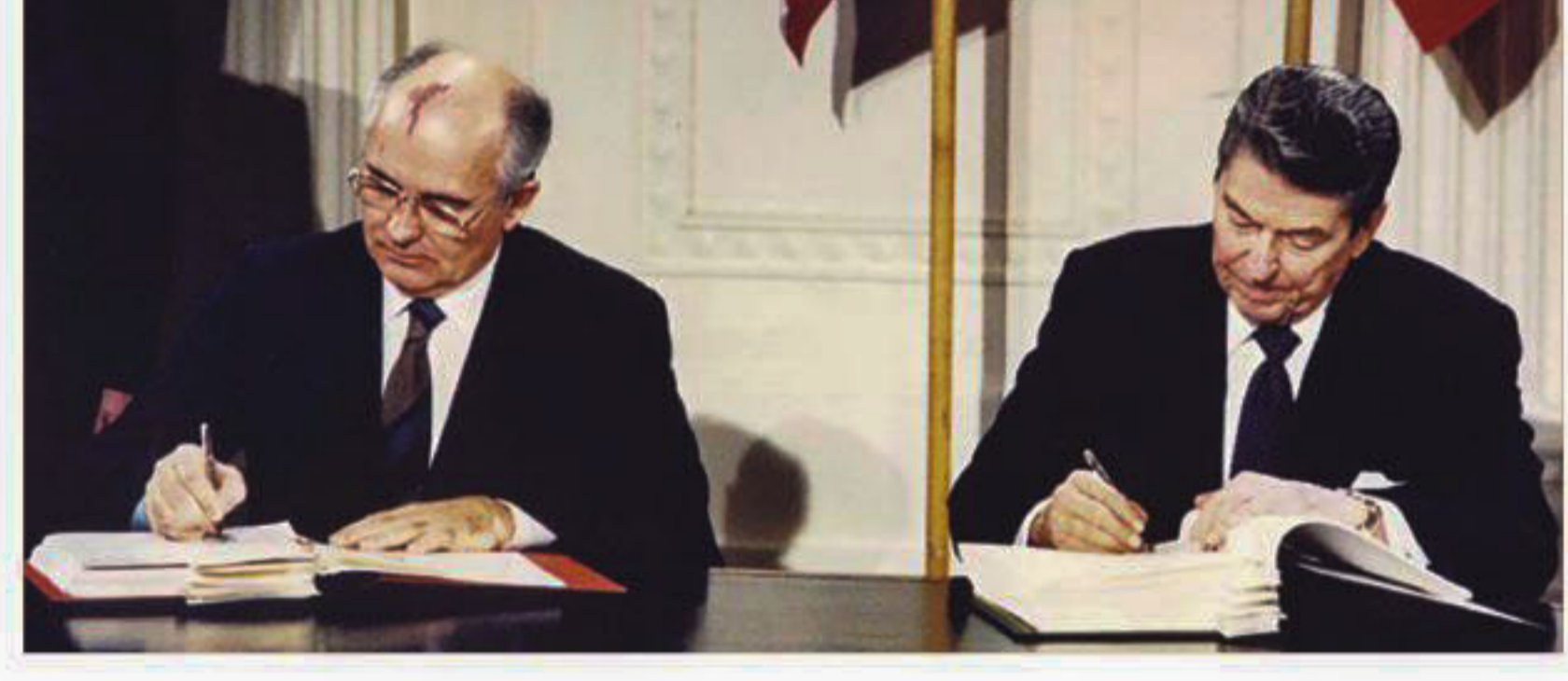
Ronald Reagan and Mikhail Gorbachev sign the INF Treaty at the White House on December 8, 1987.