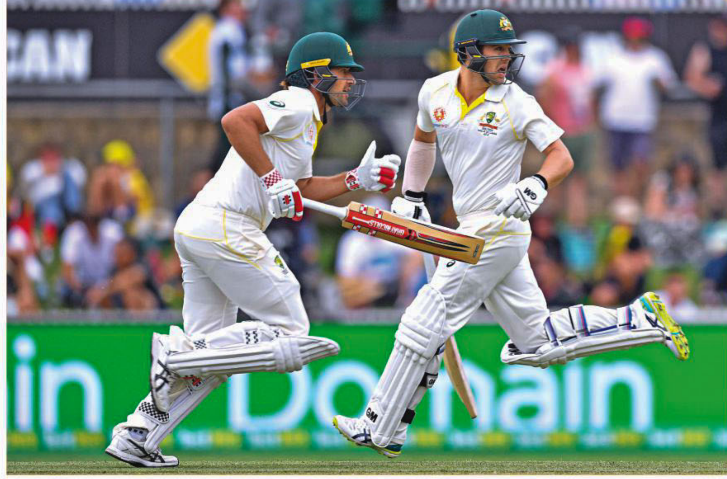
Australia batsmen Travis Head (L) and Joe Burns shared a 308-run fourth wicket partnership during the first day of the second and final Test against Sri Lanka at the Manuka Oval in Canberra yesterday.

"We knew the first hour was going to be tough, bit of grass on the wicket, so despite losing the three