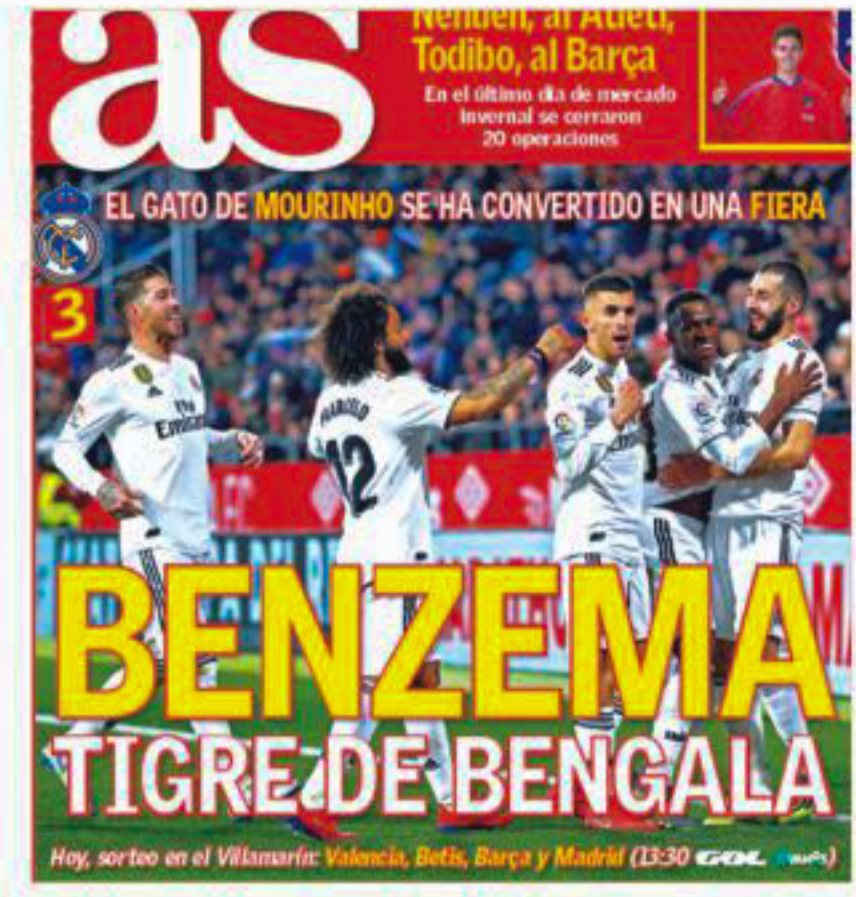
Madrid-based sport daily AS headlined the win: "Benzema a Bengal Tiger".

Real reached the Copa del Rey semis after completing a 7-3 aggregate victory over Girona on Thursday while Barcelona pulled off a brilliant comeback to beat Sevilla, overturning a 2-0 first-leg deficit by winning 6-1 at the Camp Nou.