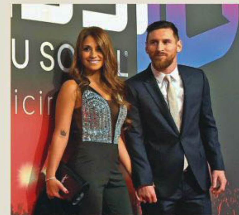
Lionel Messi and his wife Antonella Roccuzzo pose on the red carpet during a photocall for Cirque du Soleil's latest show "Messi 10" at the Nou Camp on Thursday.

Inter's late equaliser in vain as Lazio win Cup shootout Lazio reached the Coppa Italia semi-finals with a 4-3 shootout win over Inter Milan who had forced a 1-1 draw with a penalty