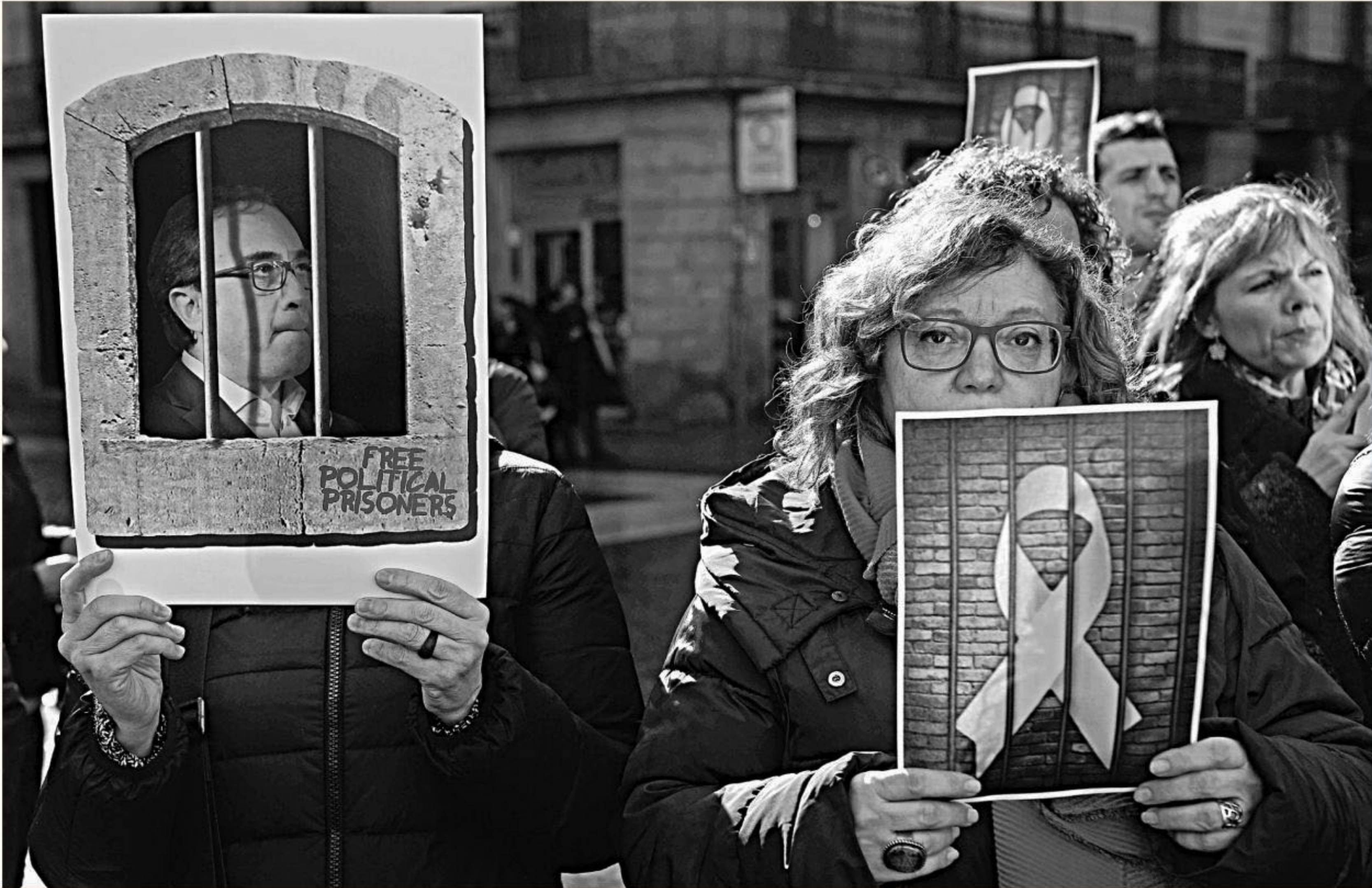
People hold pictures of jailed Catalan pro-independence leaders during a demonstration in Barcelona, yesterday, in support of twelve pro-independence leaders that were transferred from Barcelona to Madrid ahead of the start of their trial over a failed attempt to separate the northeastern region of Catalonia from the rest of Spain in October 2017.