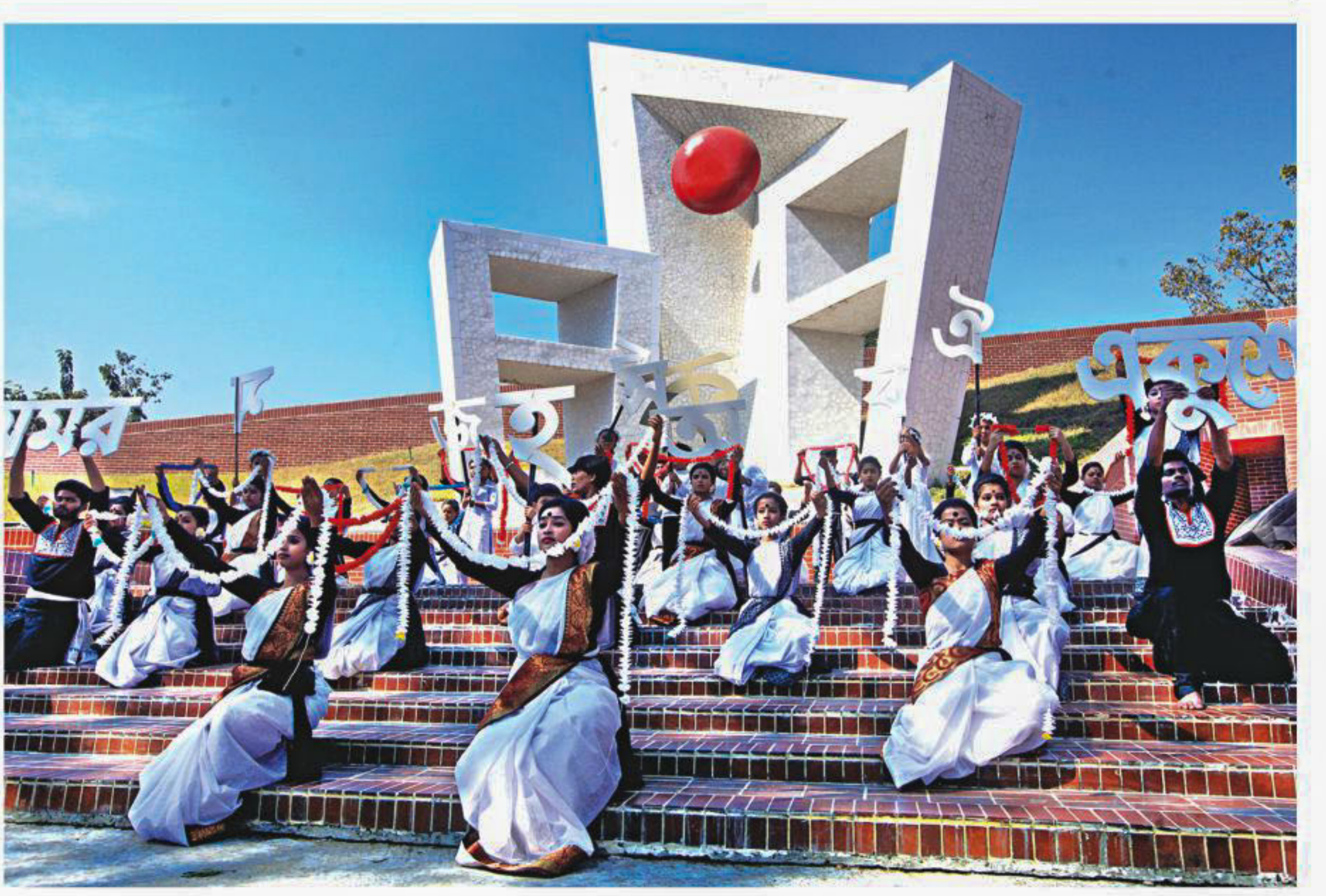
UPHOLDING THE SPIRIT OF AMAR EKUSHEY... With placards, depicting Bangla alphabets and the immortal 21st, and garlands youths usher in the month of February at Central Shaheed Minar in Sylhet city yesterday.