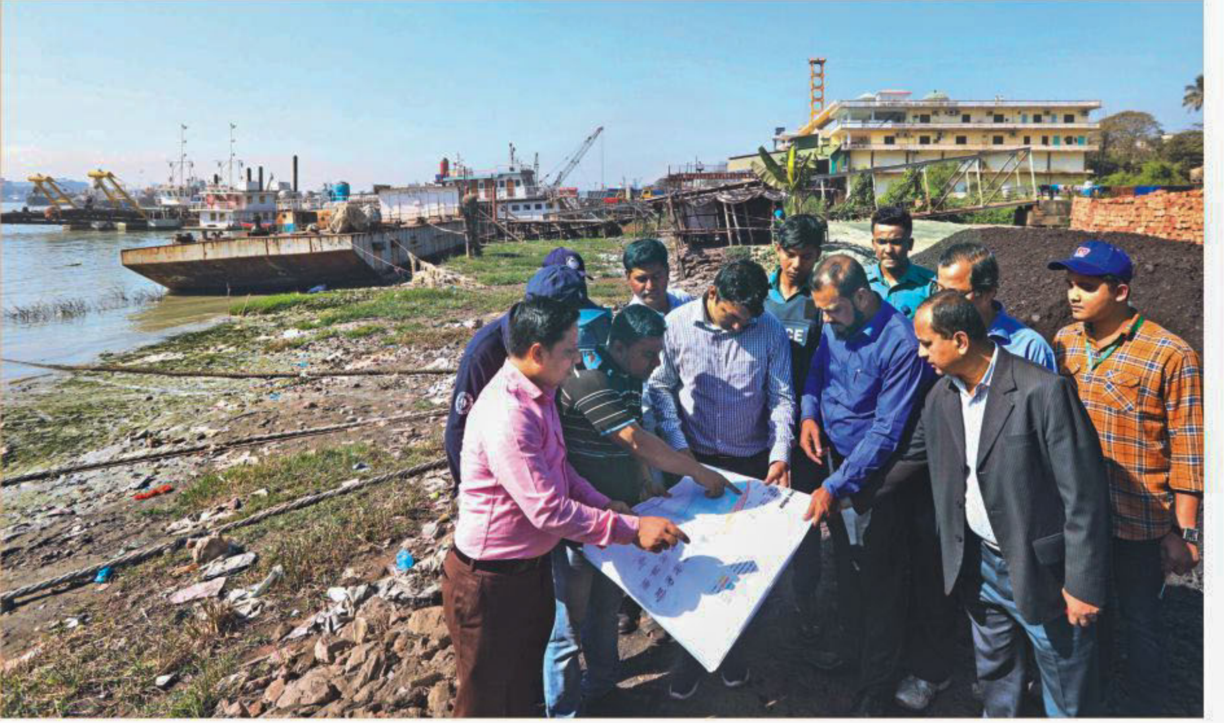
Officials of Chattogram district administration review a map for the demarcation of Karnaphuli river area. A drive to evict structures built occupying banks of the river will start from Monday. The photo was taken yesterday in Sadarghat area.

started walking away from us. We sat still for several minutes until they resumed moving normally and, at one point, walked towards us. When we were about a hundred feet from them, one took flight. It flew languidly in a wide circle and landed at high ground far to our right. The other Black Stork followed in a few seconds. The birds were soon gone. I had gotten precious photographs, but was left with many questions. What were they eating? Where was their nest? Where will they migrate to during the warm months? How many offspring have they given birth to? I guess I will never know. But I do know that I will remember this day. www.facebook.com/ikabirphotographs or follow ihtishamkabir on Instagram