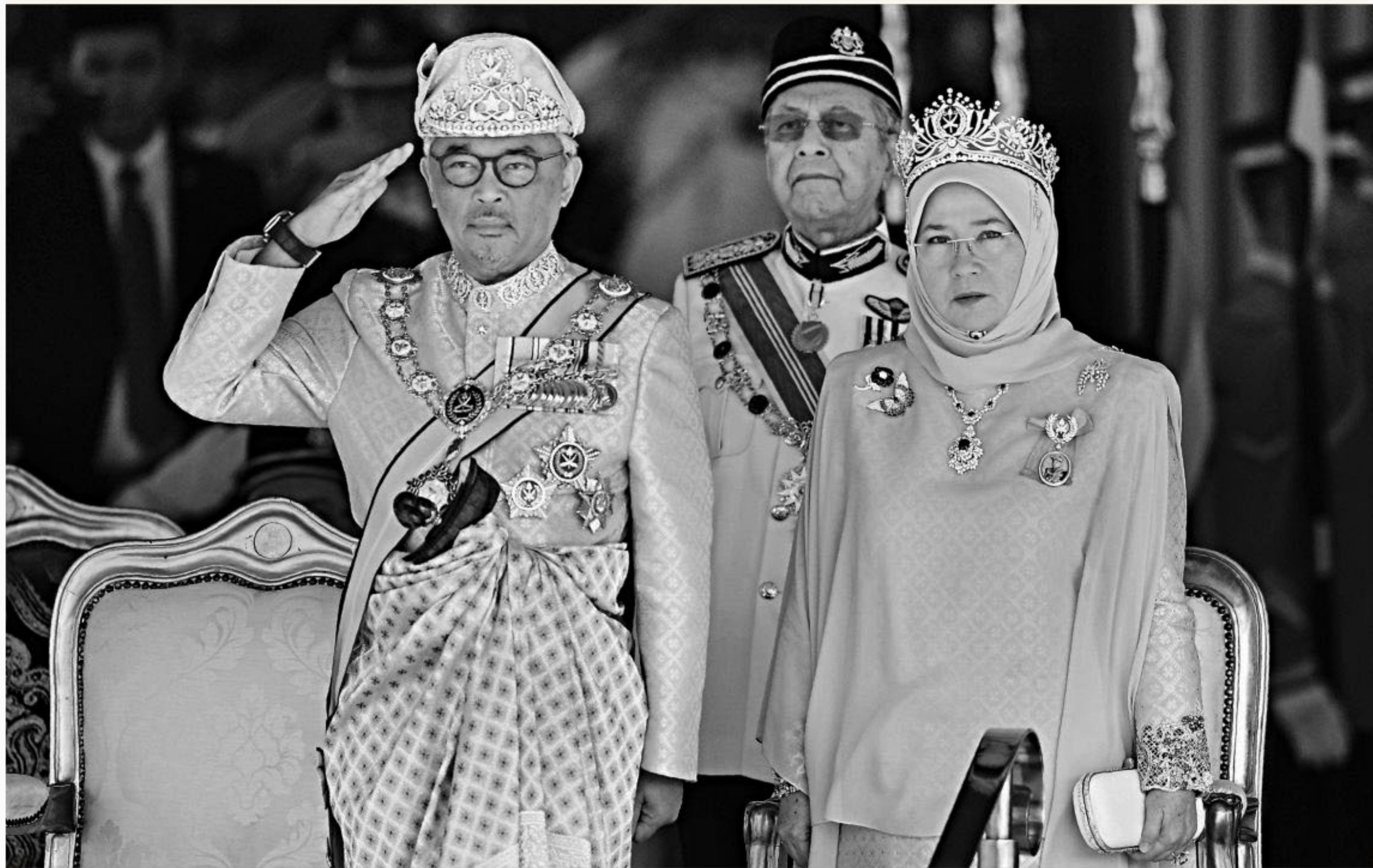
The incoming 16th King of Malaysia Sultan Abdullah Sultan Ahmad Shah salutes beside Queen Tunku Azizah Aminah Maimunah, while Prime Minister Mahathir Mohamad (C) observes during the welcoming ceremony at the Parliament House in Kuala Lumpur yesterday.

Officials pointed to ongoing talks between the Taliban and US special envoy Zalmay Khalilzad, who this week said