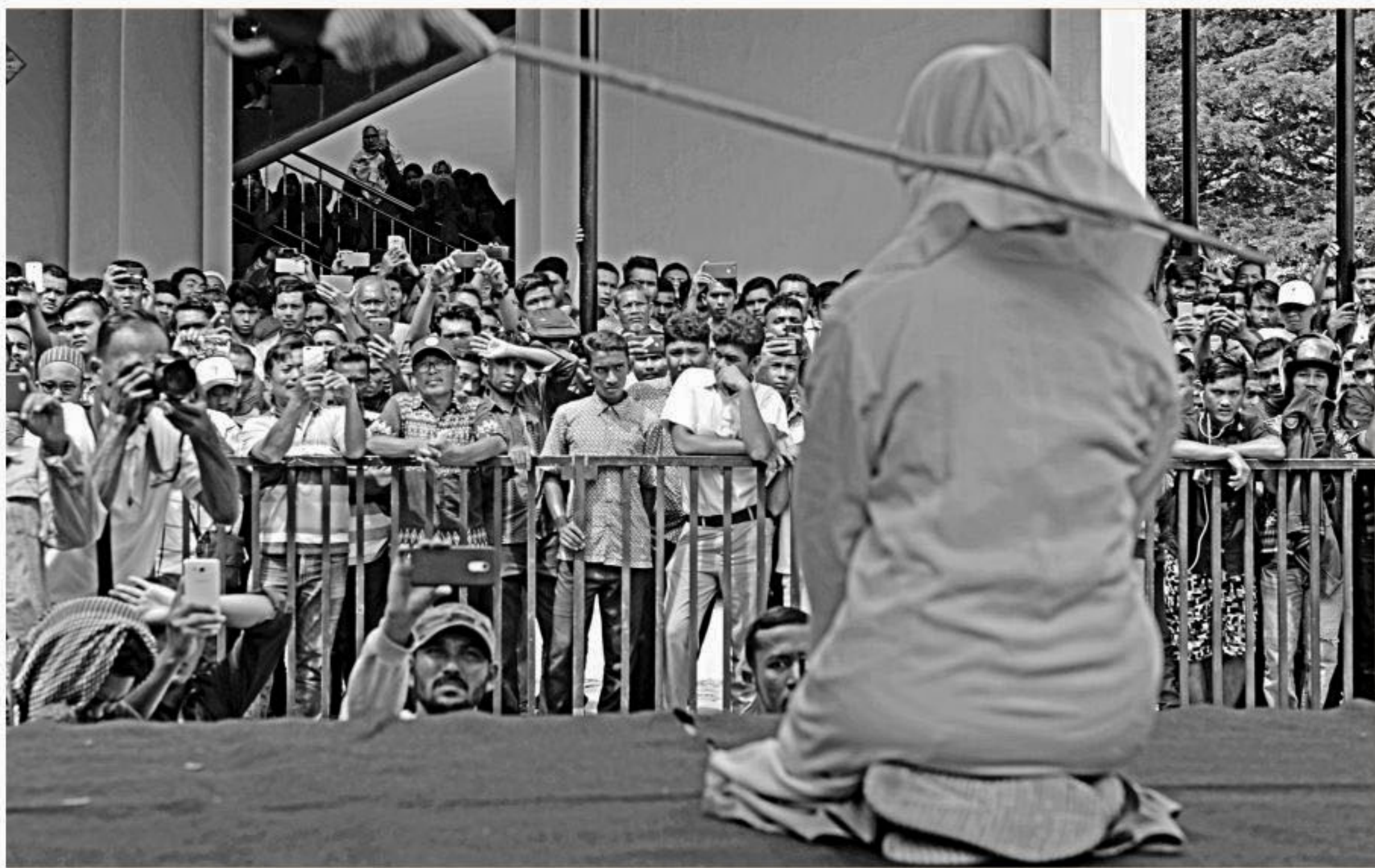
An 18-year-old Indonesian woman is caned in public in Banda Aceh yesterday, as punishment for being caught cuddling with her boyfriend. Aceh is the only province in the world's biggest Muslim majority country that imposes Islamic law.